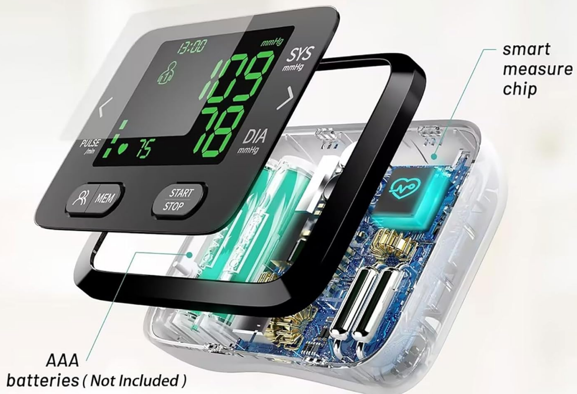
Image 3.1: Internal view of the monitor. This image illustrates the device's internal structure, highlighting the smart measure chip and the battery compartment for AAA batteries (not included).

Note: Batteries are not included in the package