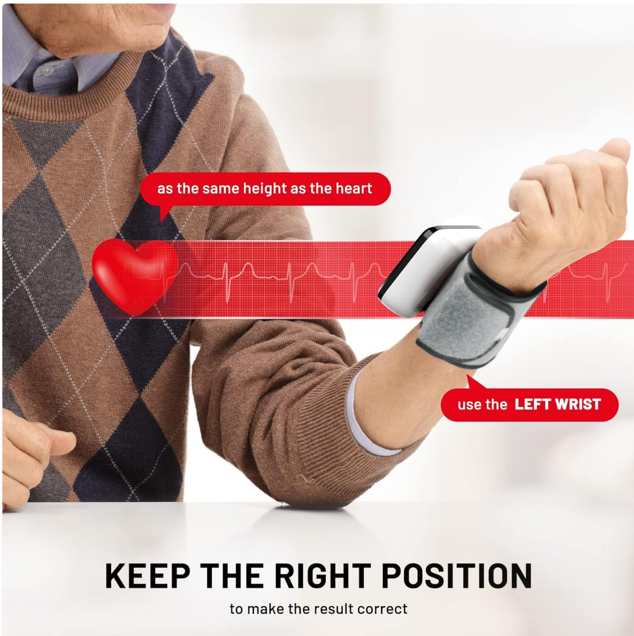
Image 5.1: Correct Wrist Position. This image demonstrates the proper way to position the wrist monitor on the left wrist, ensuring it is at the same height as the heart for accurate readings.