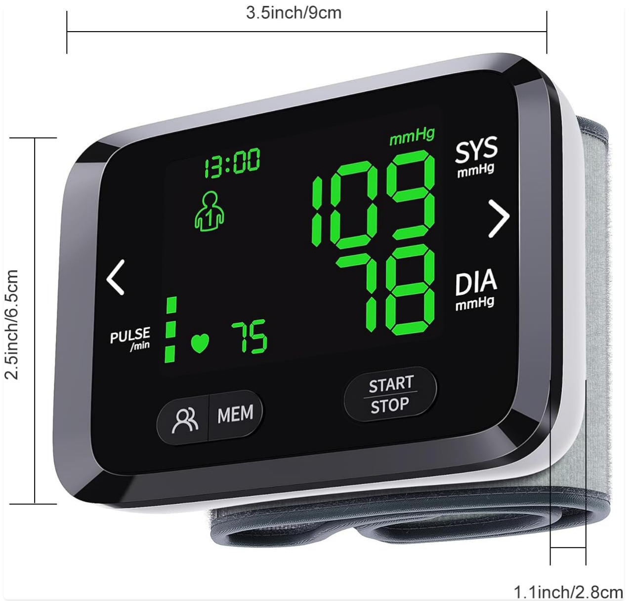
Image 9.1: Product Dimensions. This image provides a visual representation of the monitor's dimensions, indicating its compact size.