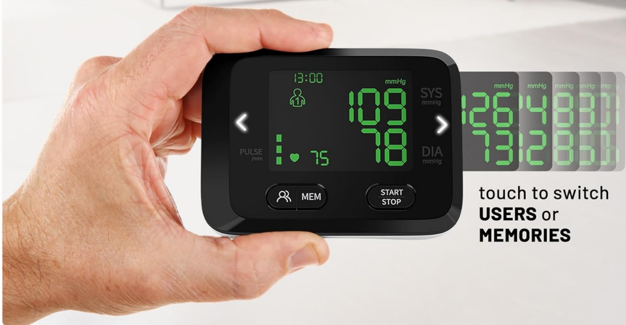
Image 6.1: Dual Users and Memory. This image highlights the monitor's capability to support two users and store 99 readings for each, with on-screen indicators for user selection and memory navigation.