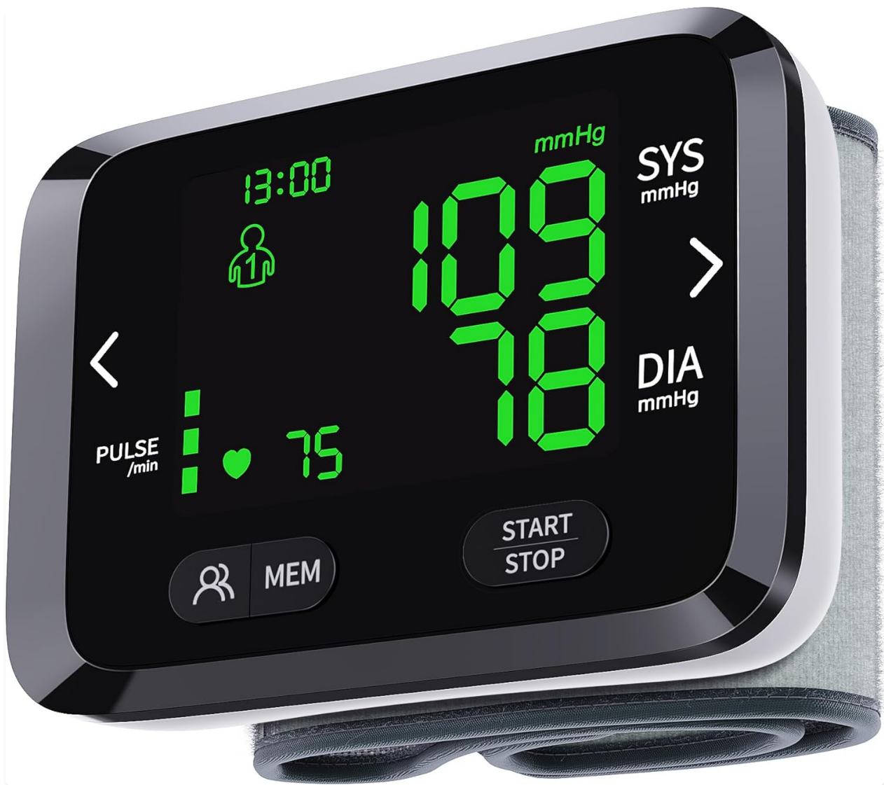
Image 1.1: NOUYAN Wrist Blood Pressure Monitor. This image displays the device's large, clear backlit LCD screen showing blood pressure (SYS 109, DIA 78 mmHg) and pulse (75 beats/min) readings, along with user and memory indicators.