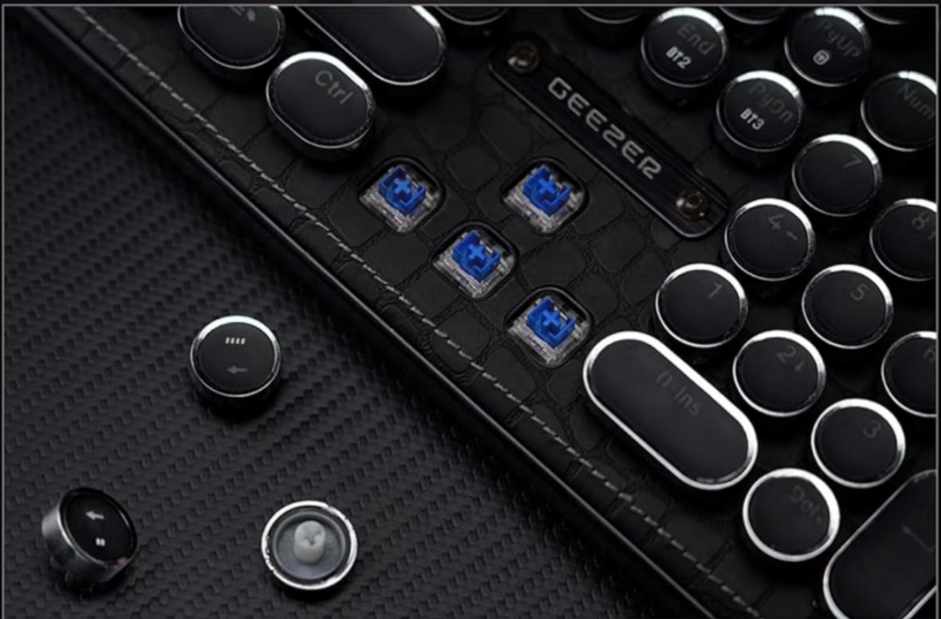
Image: Detailed view of the TISHLED G9 keyboard's blue mechanical switches beneath the round keycaps.