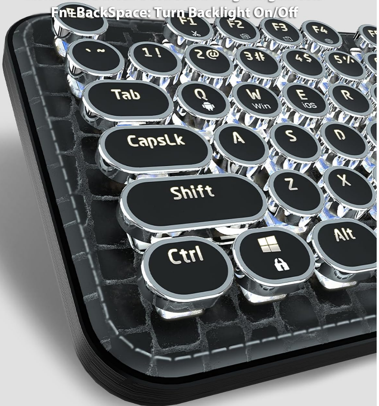
Image: The TISHLED G9 keyboard with its white LED backlight active, highlighting the round keycaps.