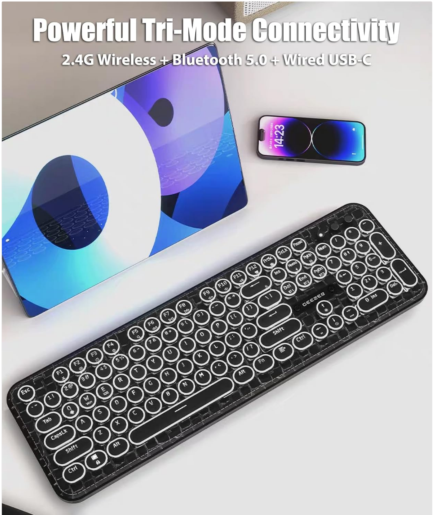
Image: The TISHLED G9 keyboard shown with a laptop and smartphone, illustrating its tri-mode connectivity options.