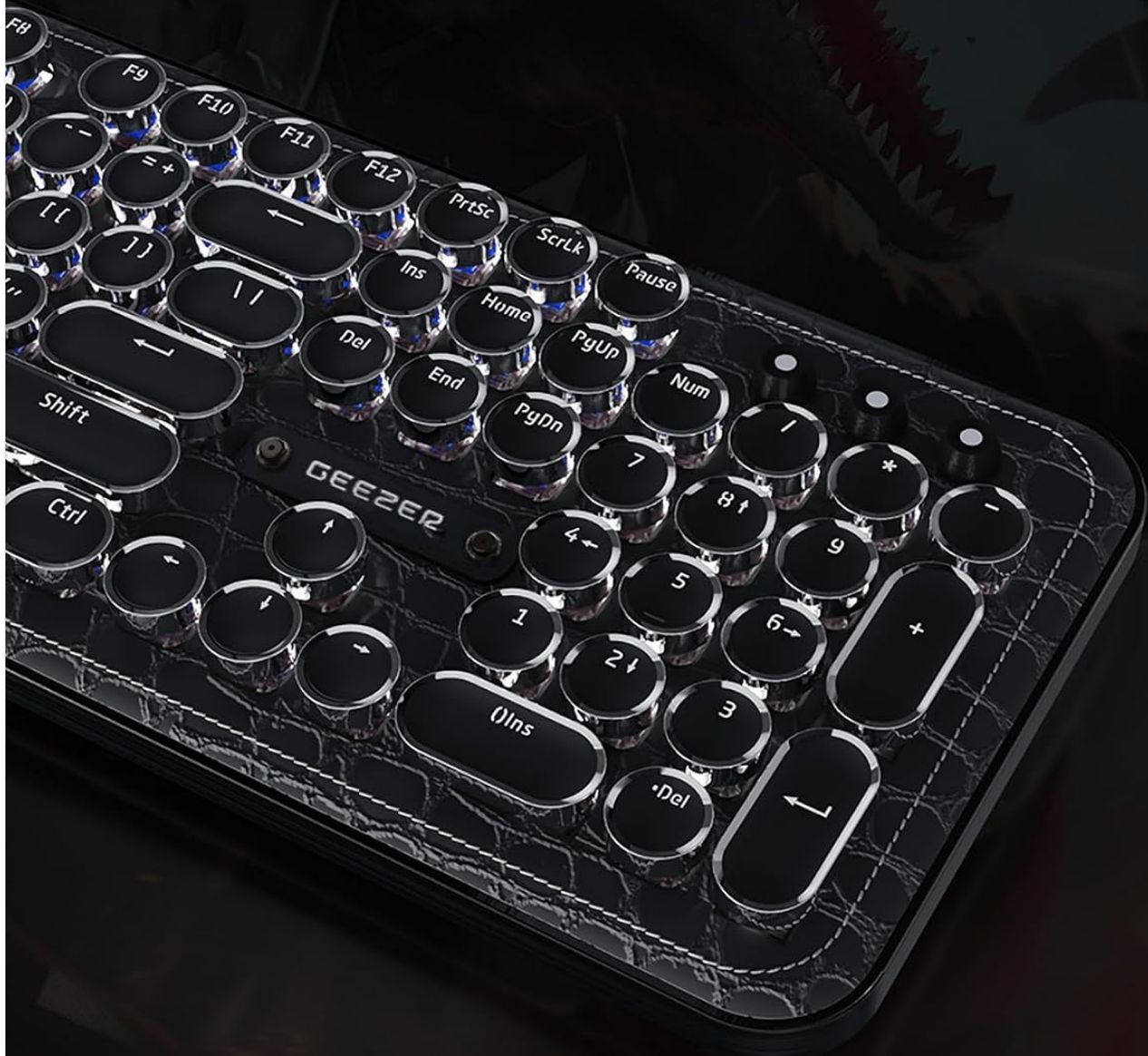
Image: Close-up of the TISHLED G9 keyboard showcasing its faux leather panel and round keycaps.

Aluminum Alloy Middle Frame + Artificial Leather Panel