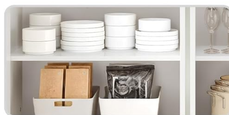
Cabinet Storage Shelves

Image: Interior storage of the YITAHOME Sideboard Buffet Cabinet, showcasing its capacity.