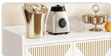
Top Open Storage