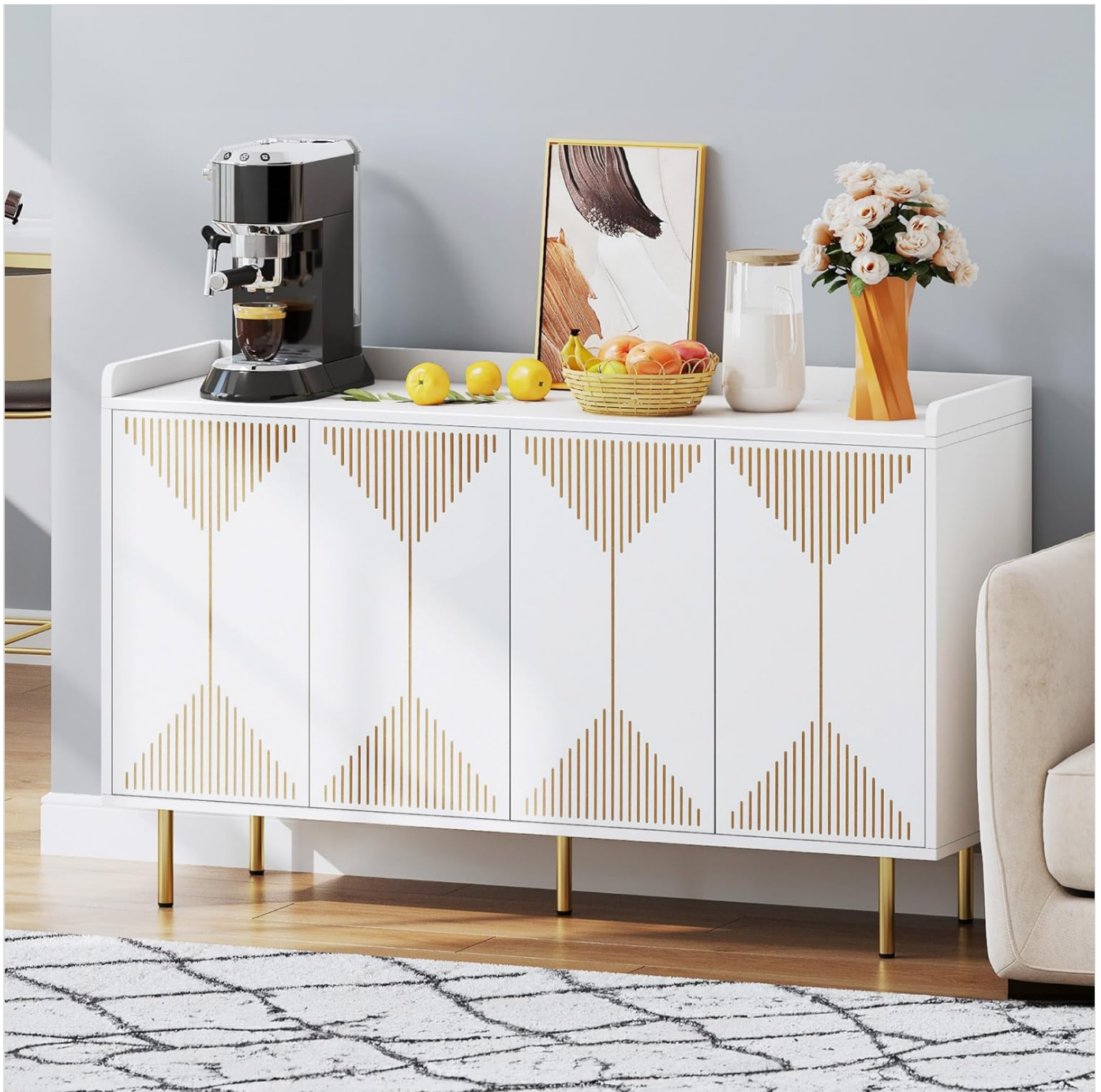
Image: The YITAHome Sideboard Buffet Cabinet in a home environment.