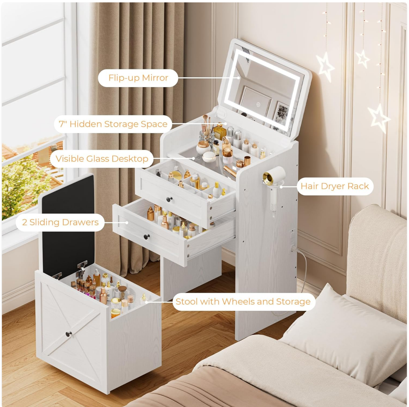
Image: An overhead view of the vanity desk with the mirror flipped up, showcasing the 7-inch hidden storage, visible glass desktop, two sliding drawers, and the stool with its own internal storage and wheels.