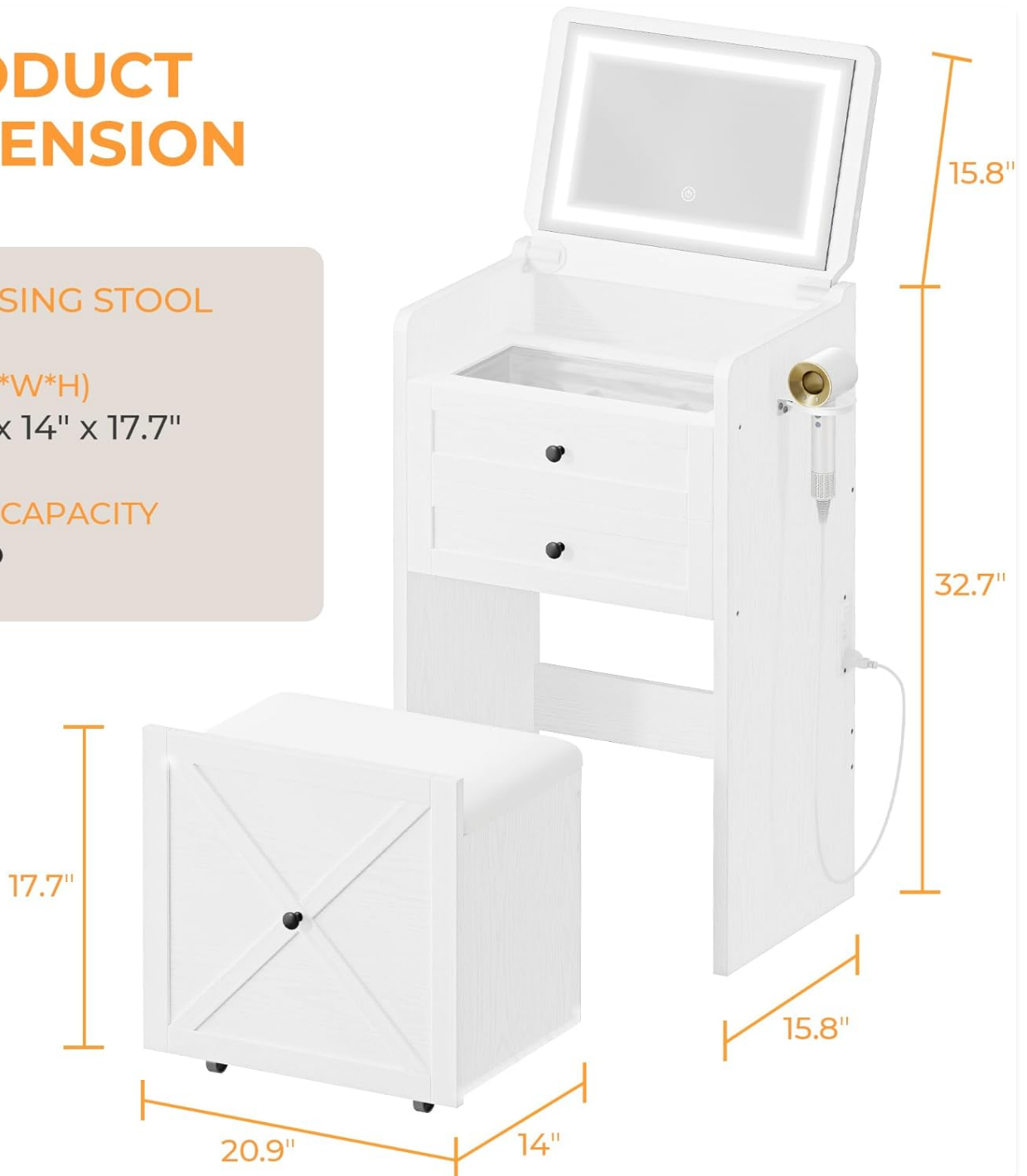
Image: Detailed product dimensions for the vanity desk and the dressing stool, including the stool's load capacity of 220 lbs.