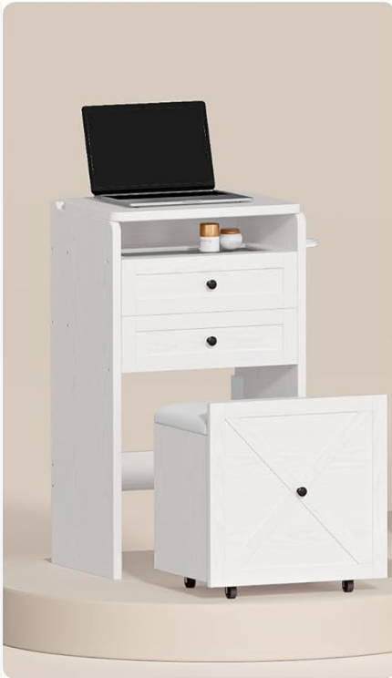
Small Office Desk

Compact Vanity Space-Saving Design Multi-Scenario Use