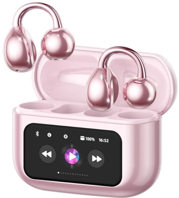
Image: The PAXA M100 Clip On Earbuds and their charging cases in purple and pink variations.