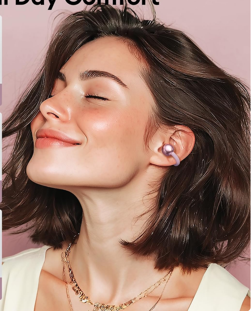
Image: Comparison of uncomfortable earbud designs versus the ergonomic, comfortable design of the PAXA M100.