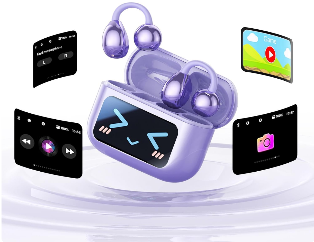
Image: The smart touchscreen charging case displaying its various control functions.