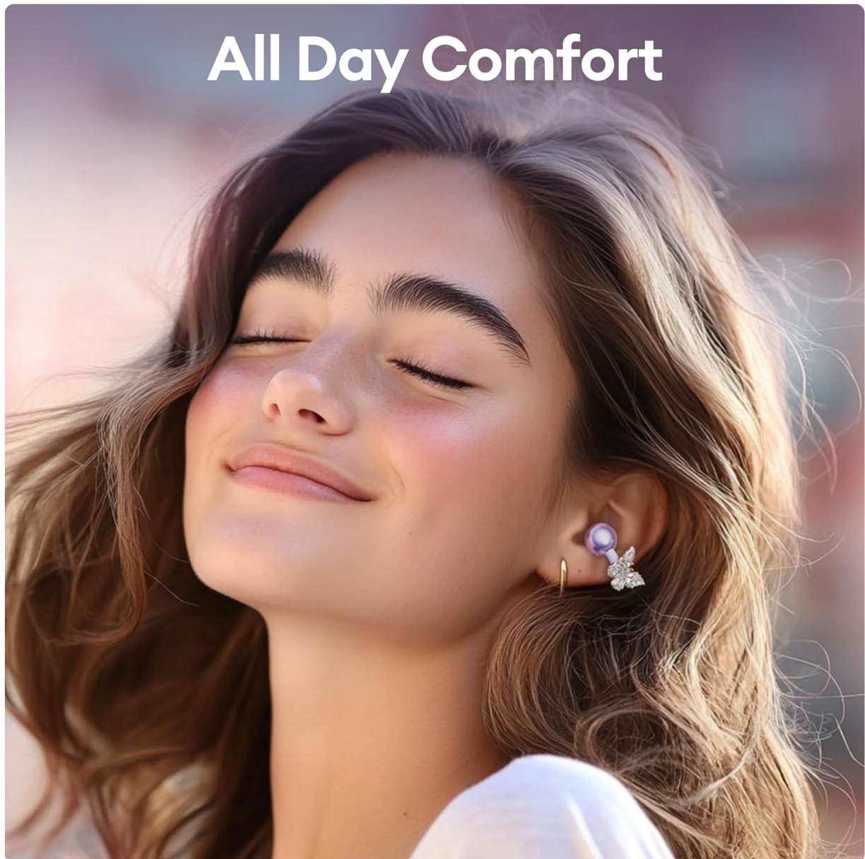
Image: A user demonstrating the comfortable fit of the PAXA M100 earbuds.