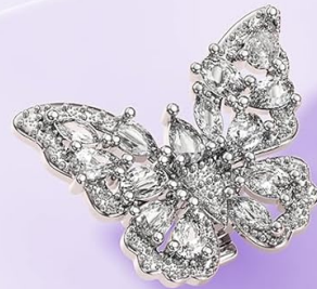
Image: Visual representation of the PAXA M100's jewelry-inspired design, open-fit comfort, and stylish earcuff.