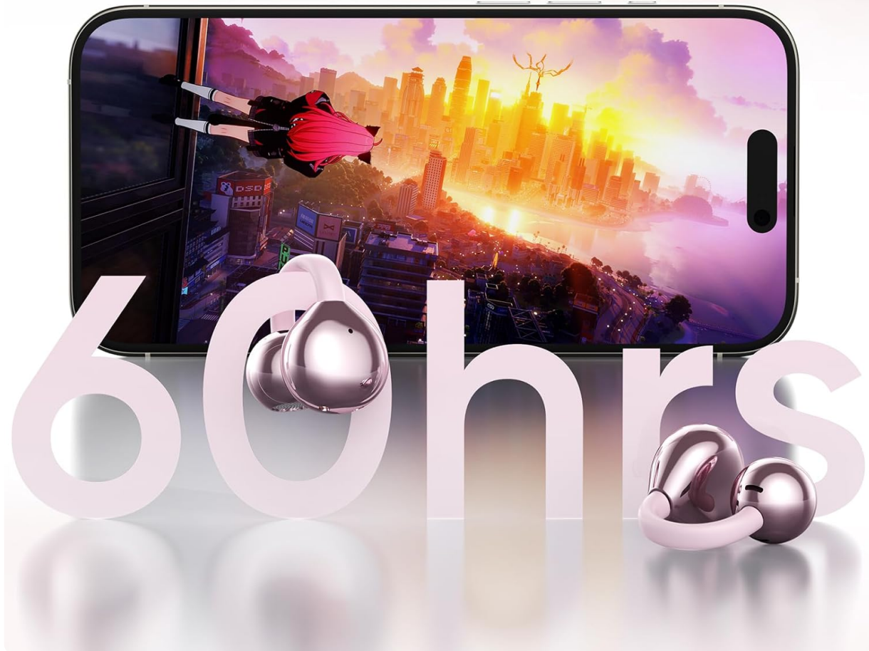
Image: Visual representation of the PAXA M100's extended 60-hour battery life.