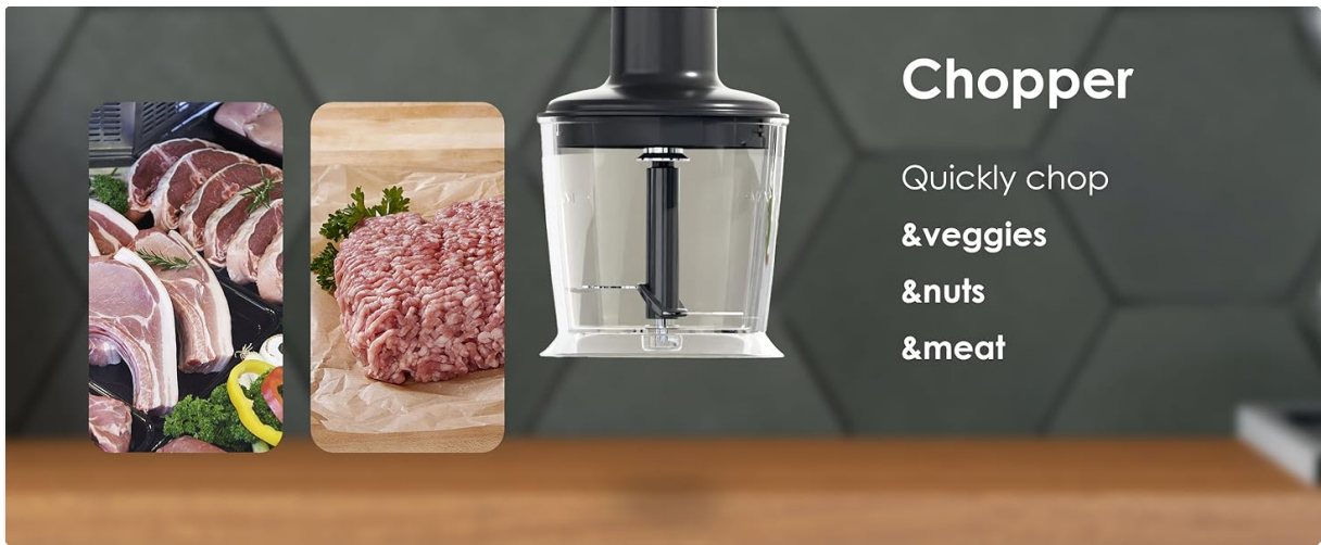
Image: The chopper attachment for processing various ingredients.

Your browser does not support the video tag.