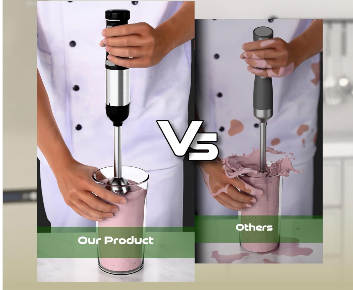
Image: The anti-splash design of the immersion blender attachment.

Unique bell shape blade guard helps ingredients flow easily through the blades, and prevents splashing to ensure a spotless kitchen.