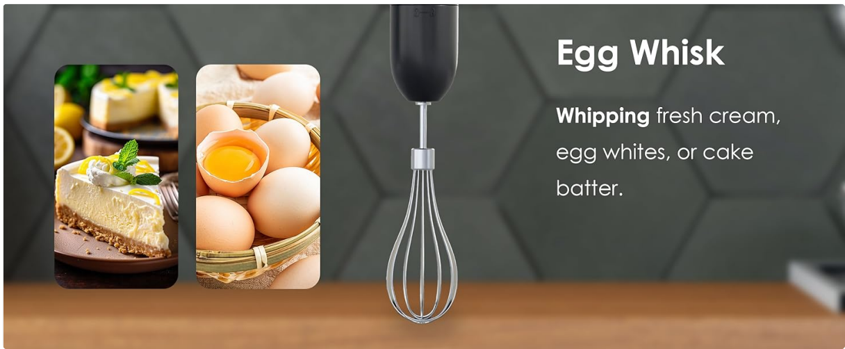
Image: The whisk attachment is ideal for whipping eggs or cream.