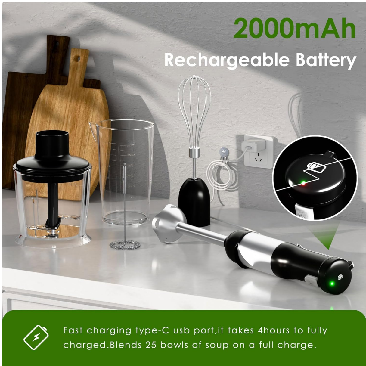
Image: The main unit charging via USB-C cable.