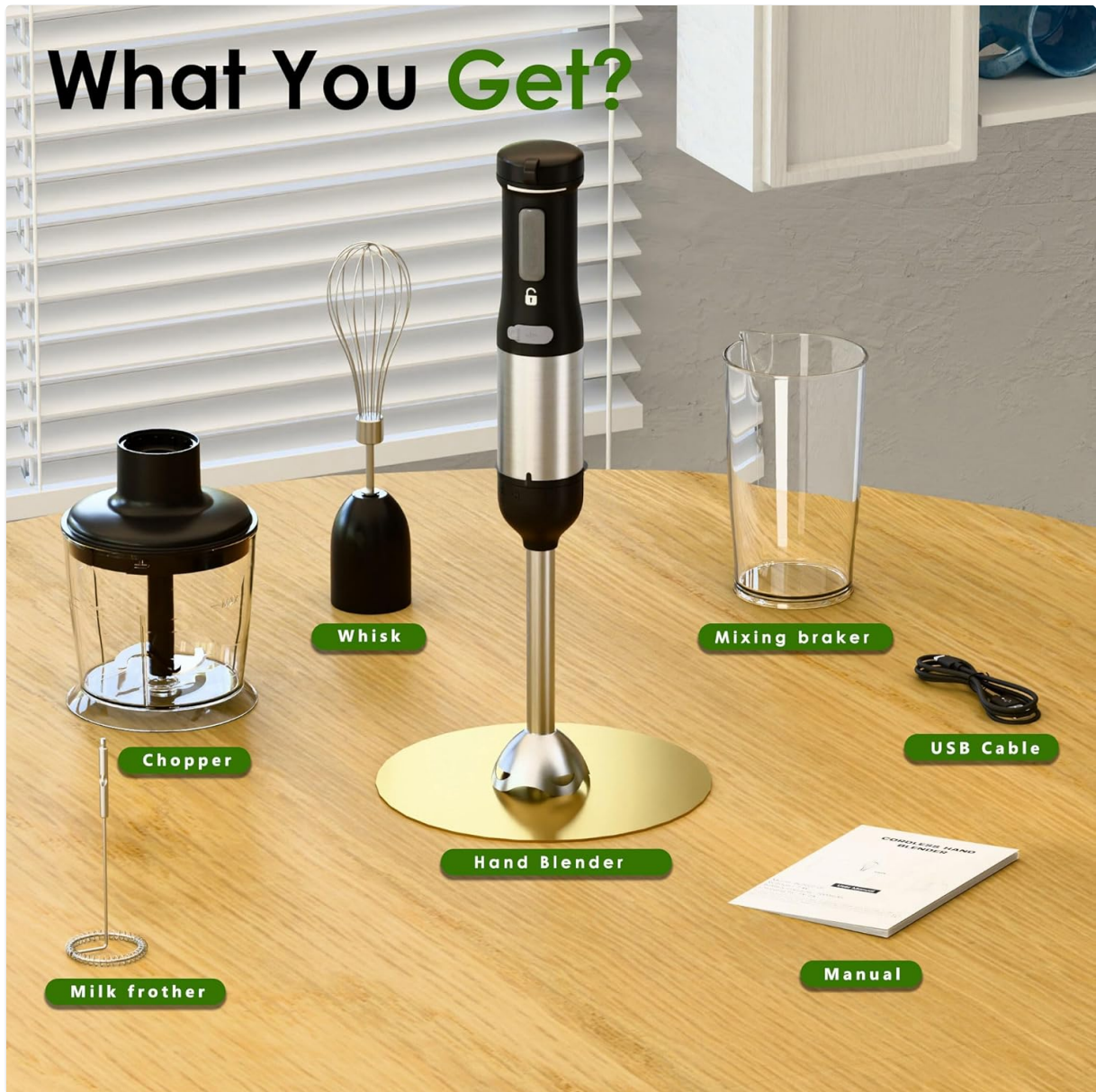
Image: All included components of the Whuto Cordless Immersion Hand Blender.