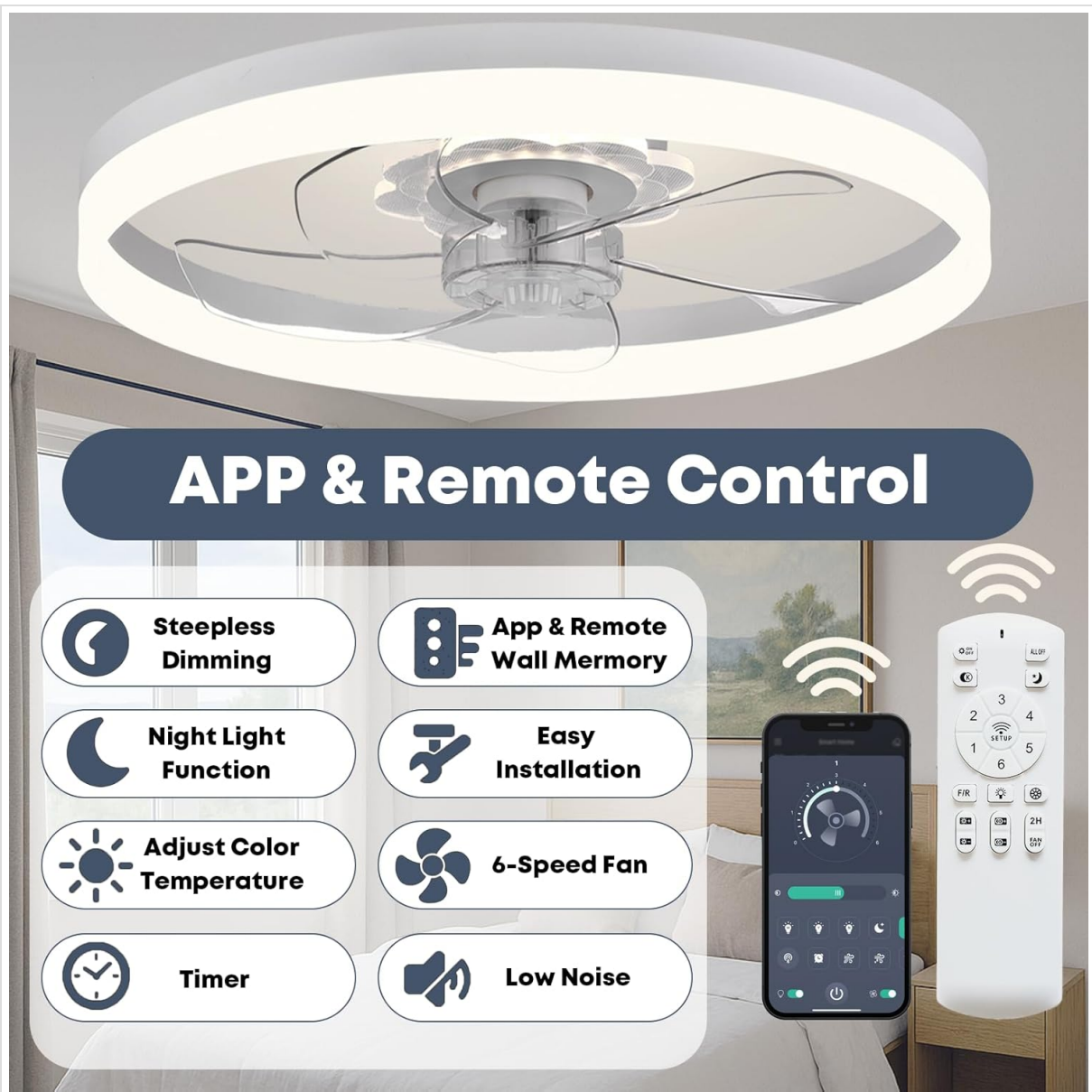
Image: Demonstrates the stepless dimming and adjustable color temperature (Warm, Natural, Bright) of the Fszdorj F115 ceiling fan.