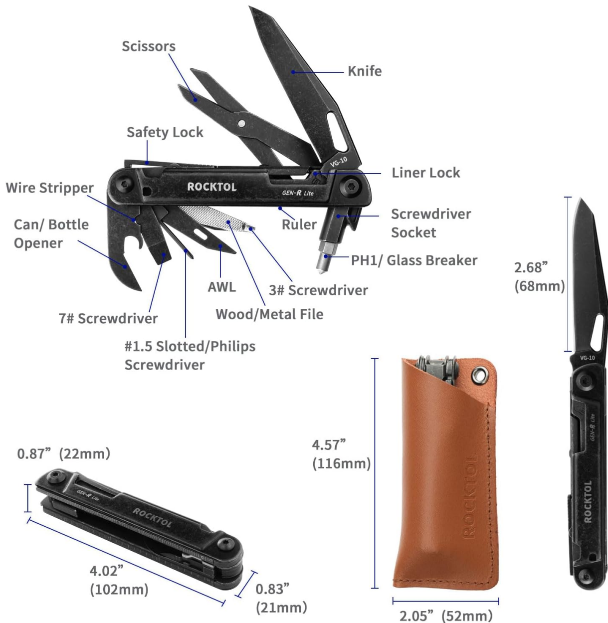
Image: Labeled diagram of all 15 tools on the ROCKTOL Gen-R Lite Multitool.