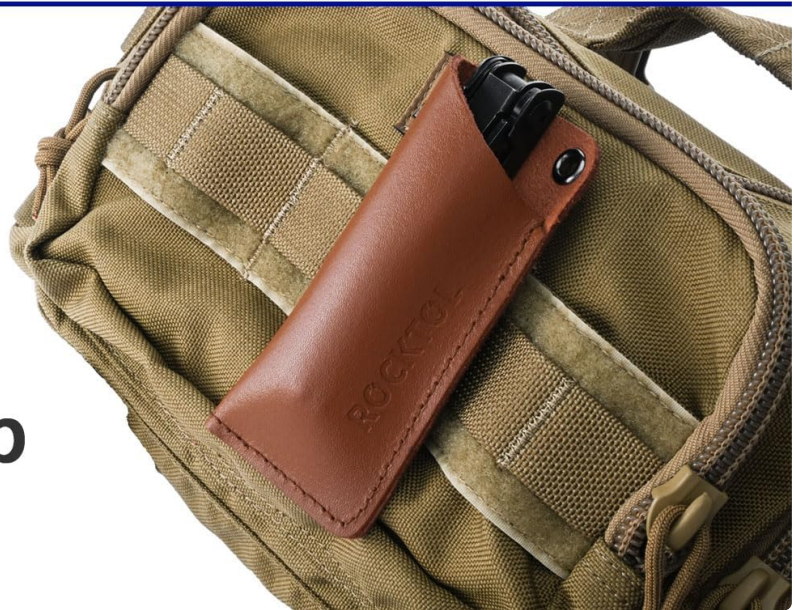
Image: The leather sheath for the multitool, showing options for key-ring and belt loop carry. For a visual guide on unboxing and initial tool overview, please refer to the video below:

Your browser does not support the video tag.