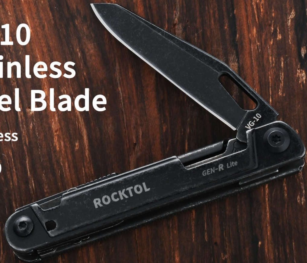
Image: The VG10 stainless steel blade of the multitool.