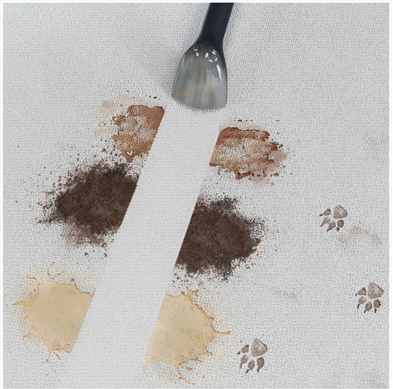
Illustration showing the effectiveness of the cleaner on various types of stains.