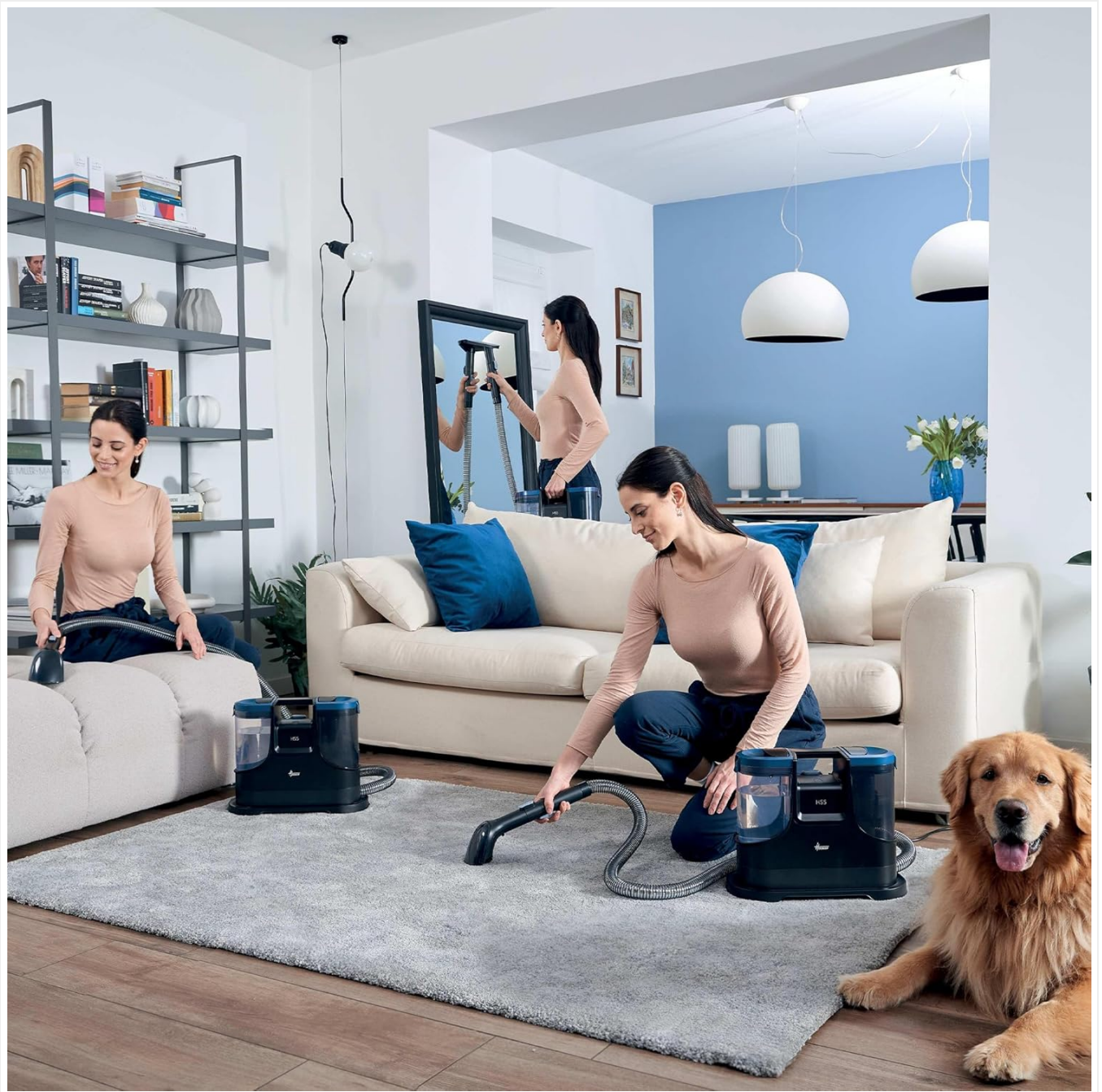
The Hoover HS500 is suitable for cleaning upholstery, such as sofa cushions.