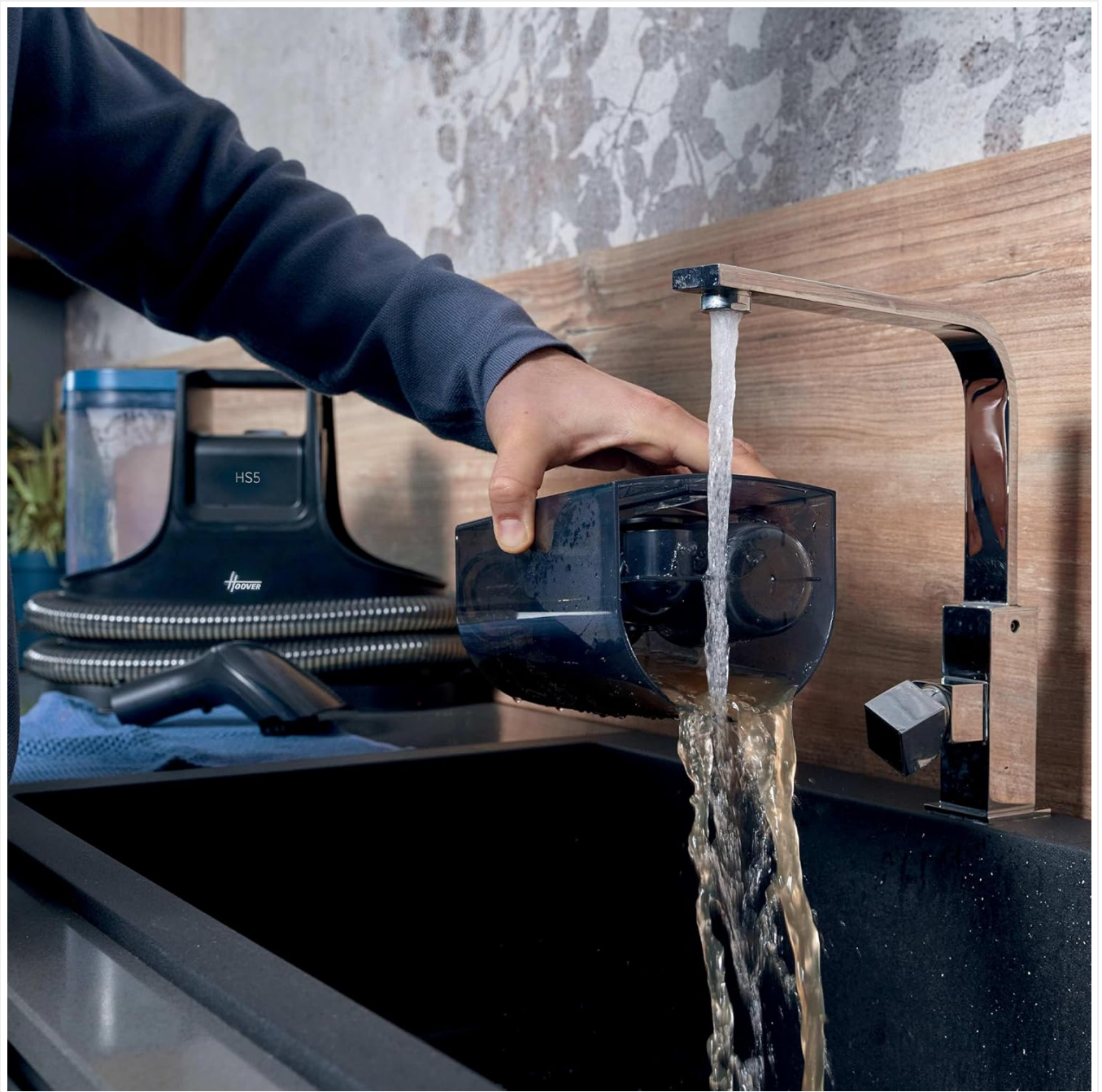
The dirty water tank is easily removed and emptied for cleaning.