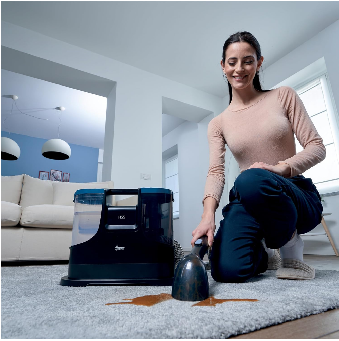
A user demonstrating the spot cleaning process on a carpet stain.

the tool over the wet area to suction up the dirty solution. Repeat as necessary until the stain is removed and the area is as dry as possible.