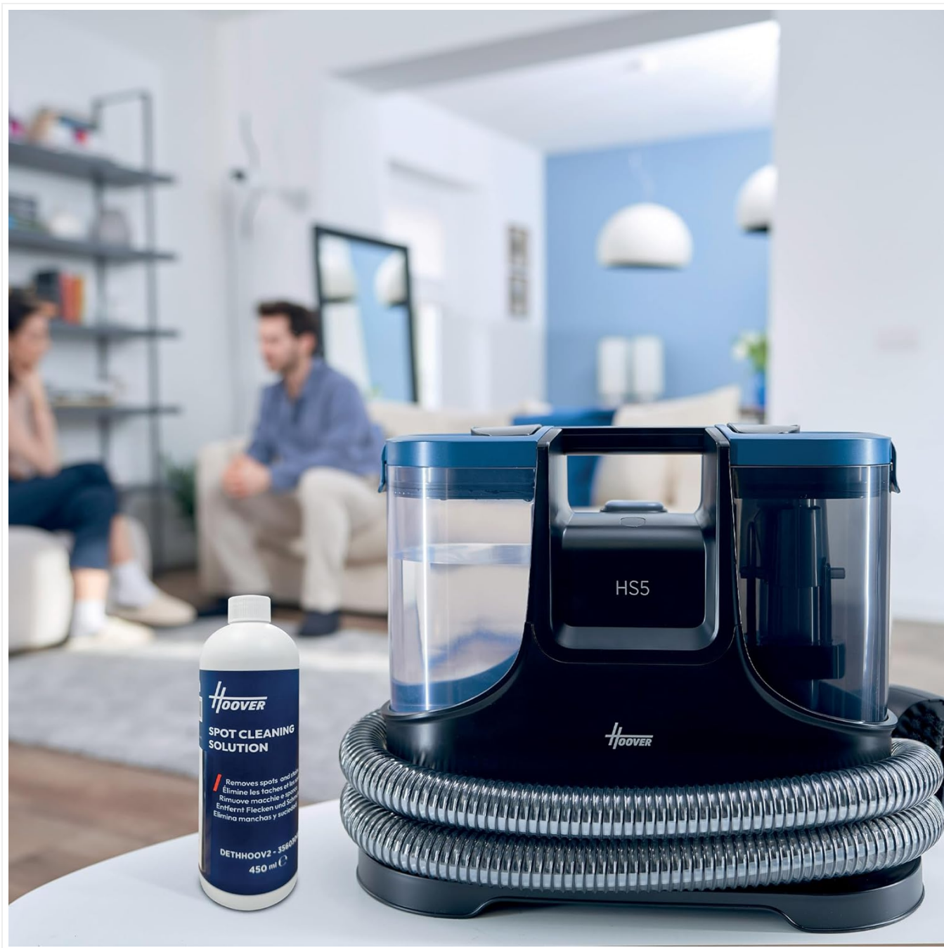
The Hoover HS500 unit with its clean water tank and a bottle of compatible cleaning solution.

recommended amount of Hoover cleaning solution as per the solution's instructions. Securely reattach the tank to the unit.