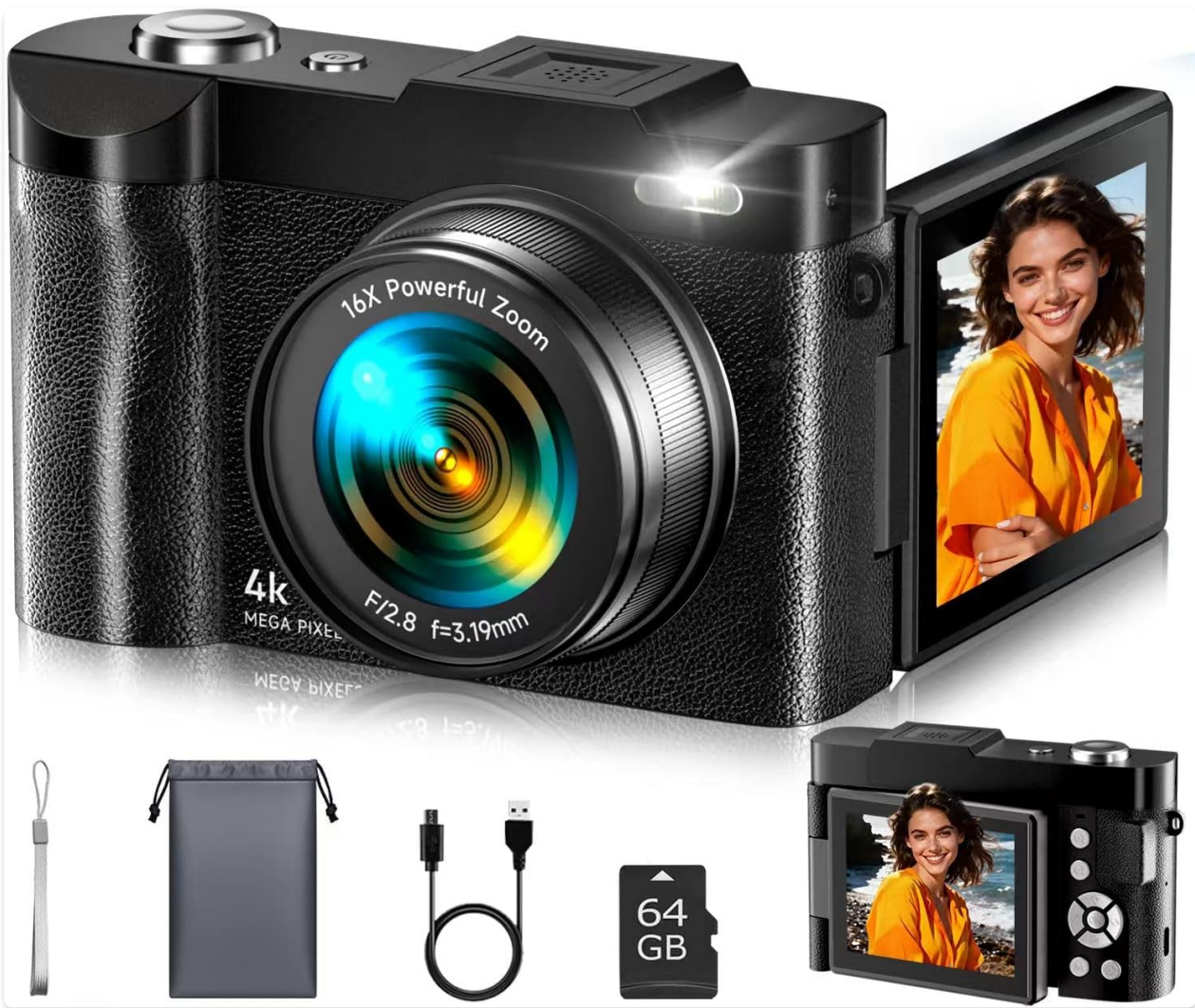
Image 1.1: The Ploomen 4K Digital Camera shown with its full accessory bundle, including a storage bag, USB charging cable, 64GB SD card, wrist strap, and cleaning cloth.