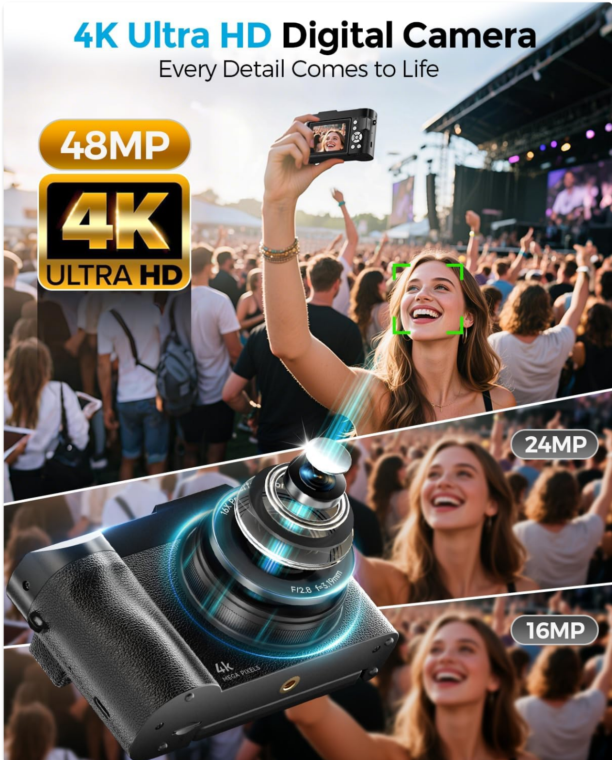
Image 3.2: Example of a high-resolution 48MP photo captured by the camera.

To take a photo, ensure the camera is in photo mode (indicated by an icon on the screen). Frame your shot using the flip screen. The camera's autofocus system will automatically adjust for clarity. Press the shutter button halfway to focus, then fully press to capture the 48MP image.