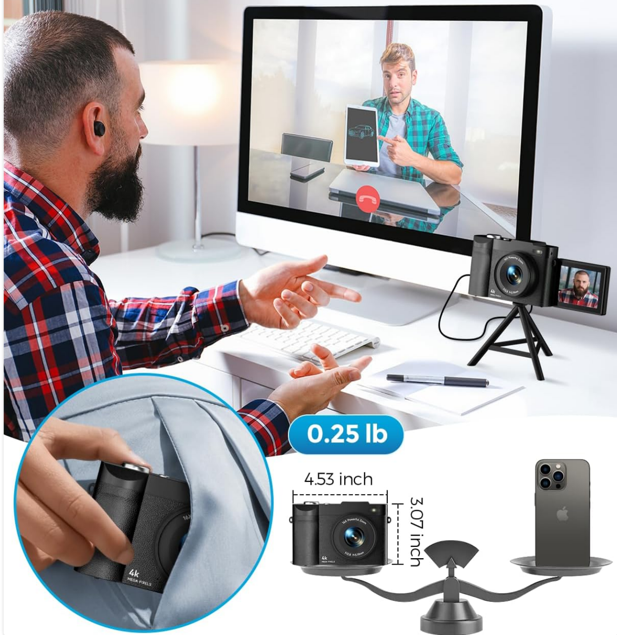
Image 4.1: The camera set up on a tripod, functioning as a webcam for a video call on a laptop.