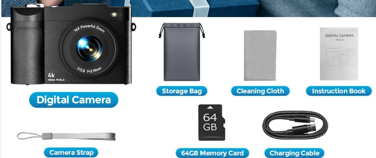
Image 2.1: All items included in the camera package, neatly arranged.