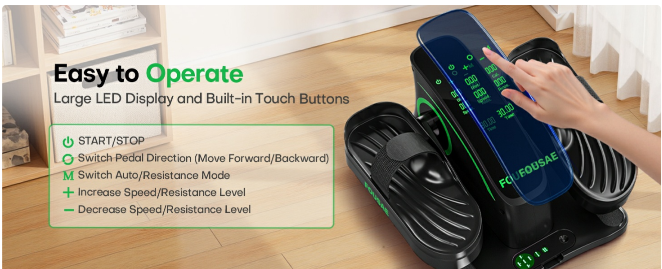
Image: Detailed view of the touch screen buttons and their functions.

The LED touch display allows direct control of the elliptical's functions.