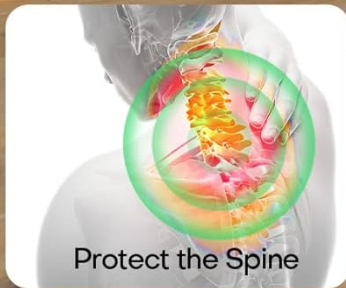
Protect the Spine