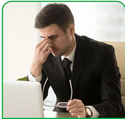
No Time for Exercise