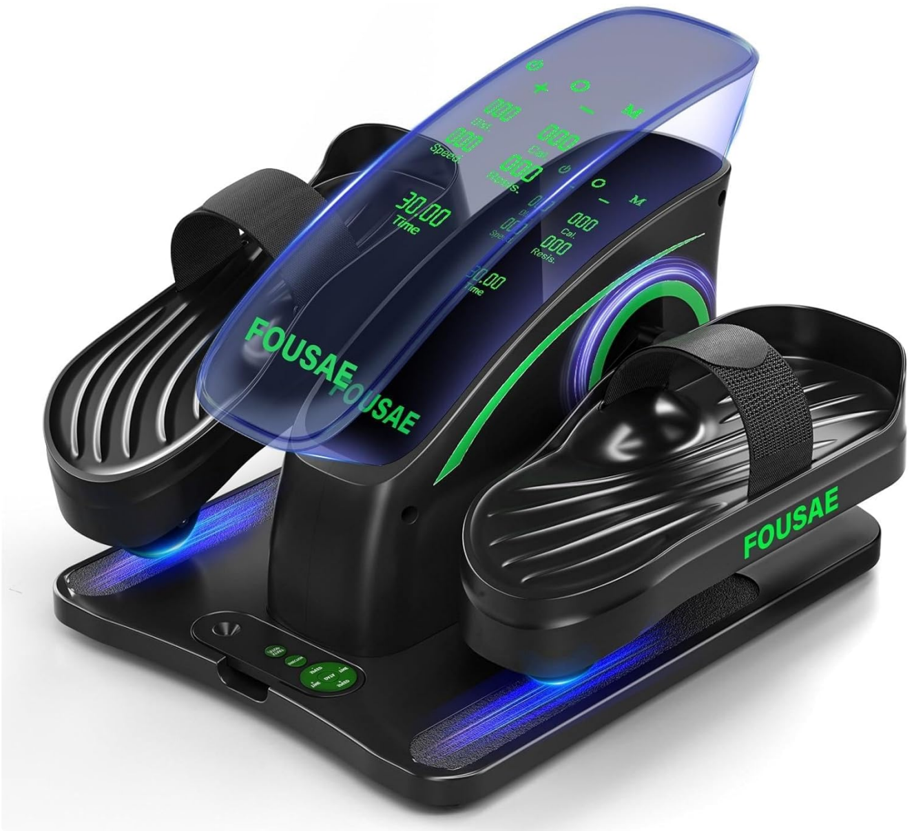
Image: Front view of the FOUSAE Under Desk Elliptical, showcasing its design and display.