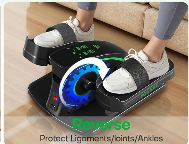
Image: Visual representation of the 6 resistance and 15 speed levels, along with forward and reverse motion.