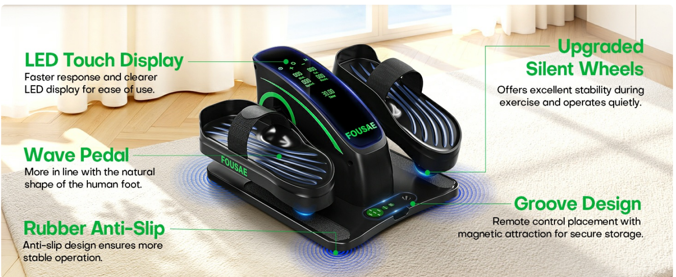
Image: Diagram highlighting key features such as the LED touch display, silent wheels, wave pedals, anti-slip rubber, and remote control storage groove.