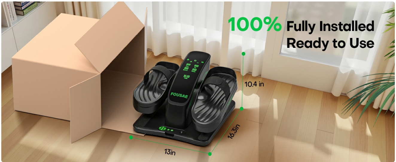
Image: The elliptical is ready for use directly out of the box, highlighting its pre-assembled state.