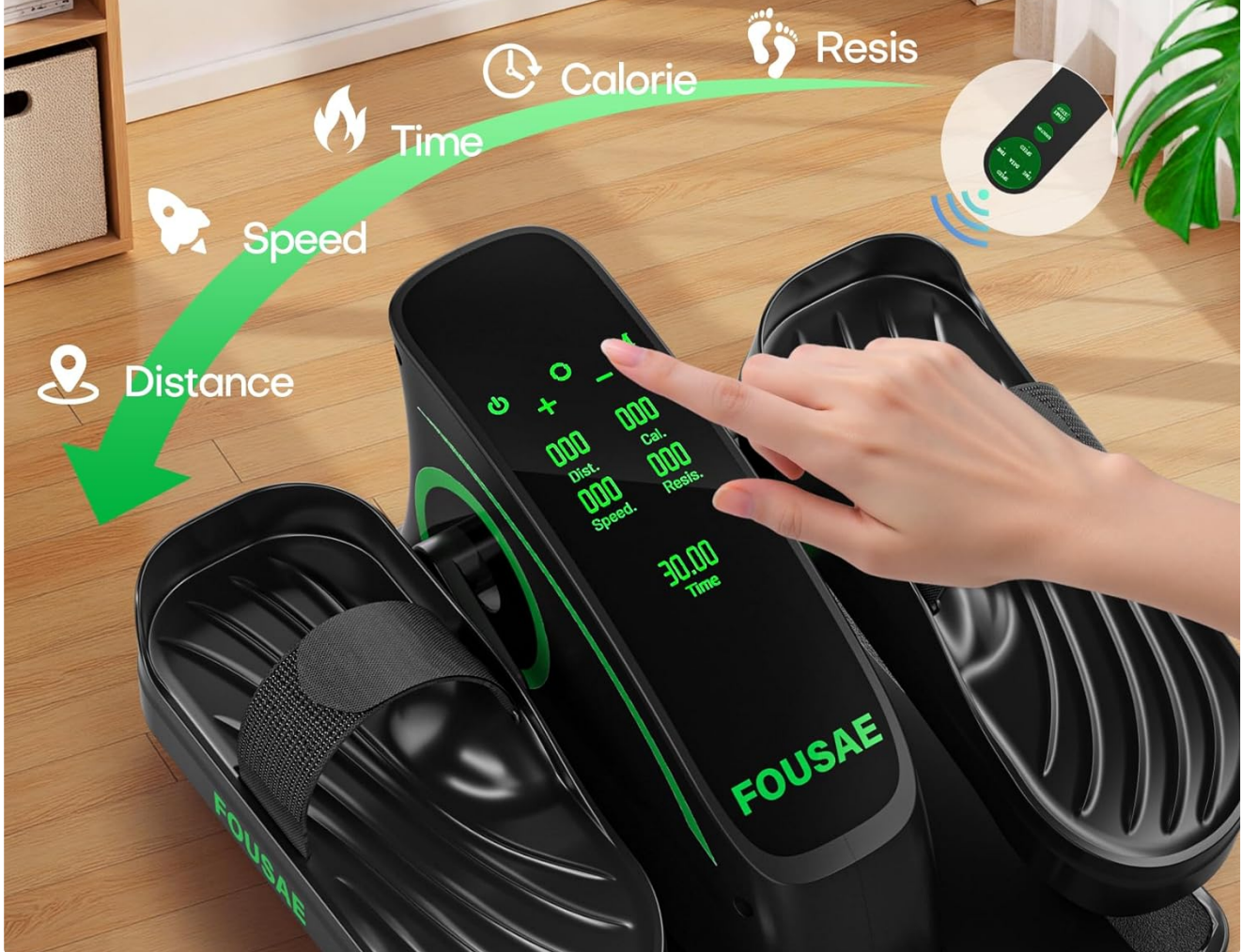
Image: The elliptical's touch screen and remote control, showing various display metrics.

Clear, Large LED display fitness tracker, simple and intuitive to use