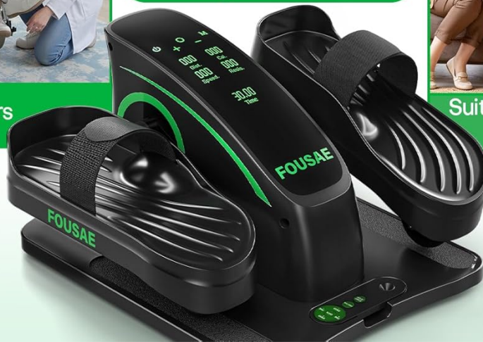
Image: Various individuals, including office workers, seniors, and those in rehabilitation, using the elliptical in different environments.