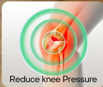
Reduce knee Pressure