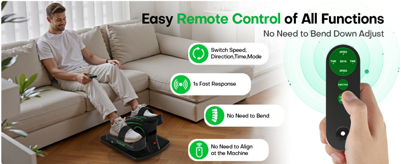
Image: A user operating the elliptical with the remote control, showing the remote's layout.

The remote control provides convenient access to all functions without needing to reach the main unit.