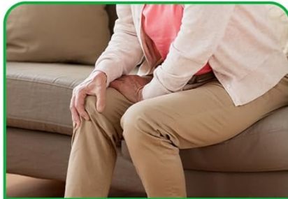
People with damaged knees