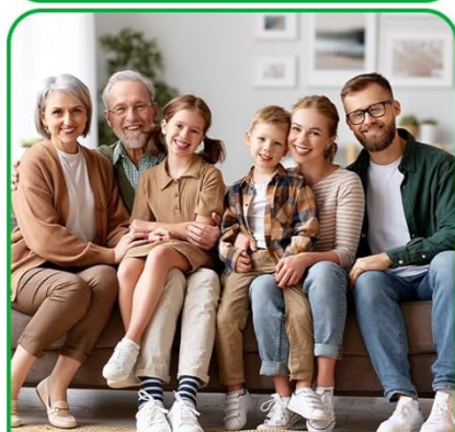
Suitable for 20-80 years old to exercise