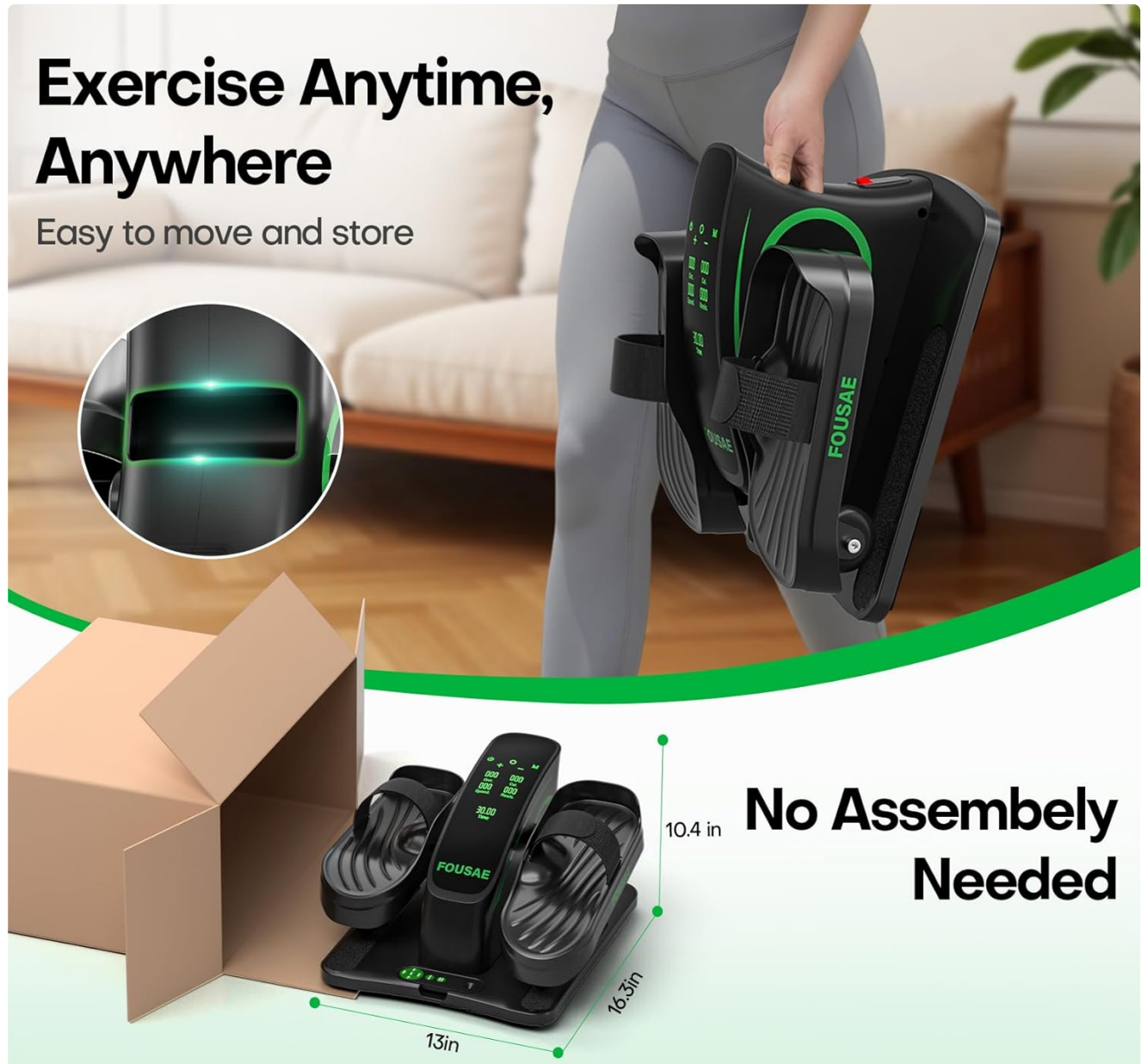
Image: The elliptical is shown being unboxed and carried, emphasizing its portability and no-assembly design.