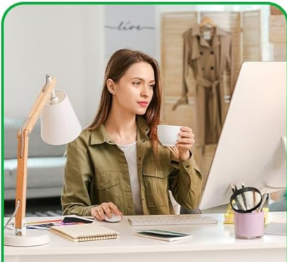
Sedentary office workers