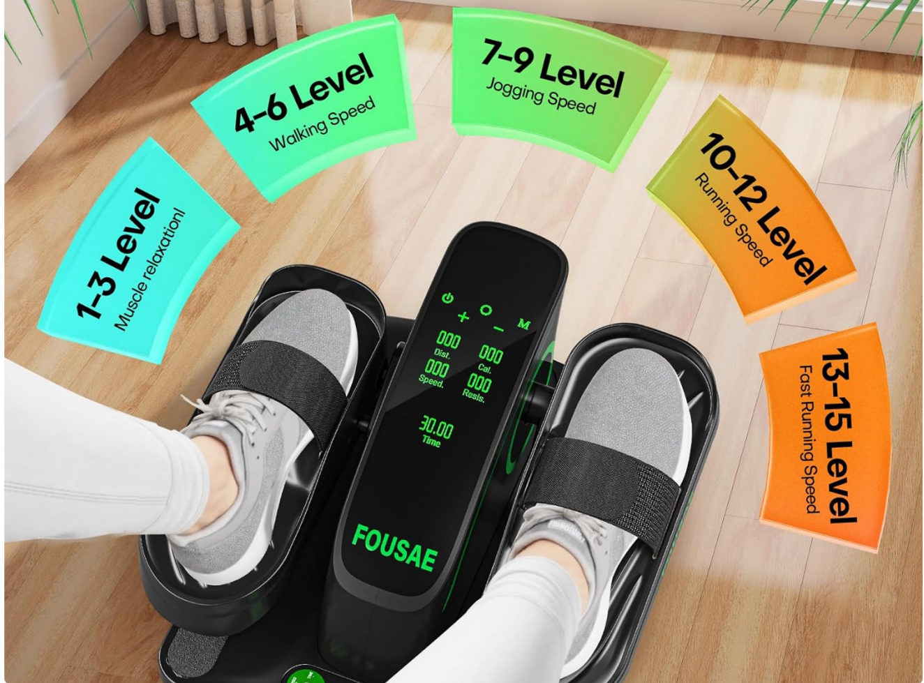
Image: Breakdown of the 15 speed levels and their corresponding exercise types.

More sports options than 12 speed levels