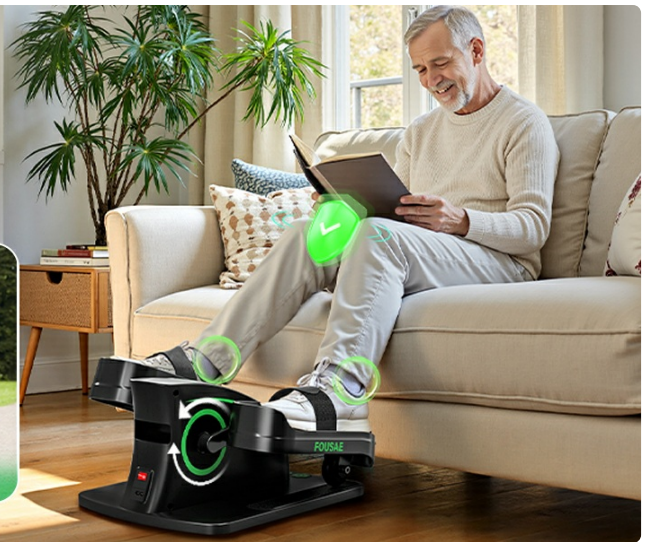
Image: Visual guide to the 15-speed auto mode, showing different exercise intensities.