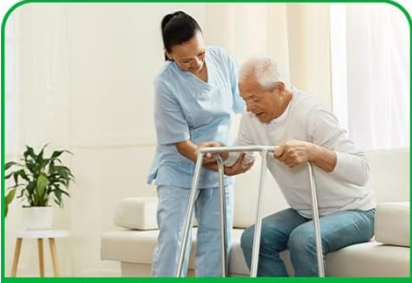
Professional rehabilitation after leg and knee injuries