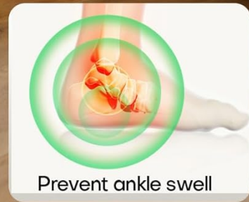
Prevent ankle swell

Image: An elderly man uses the elliptical while reading, illustrating its low-impact benefits for circulation and joint protection.