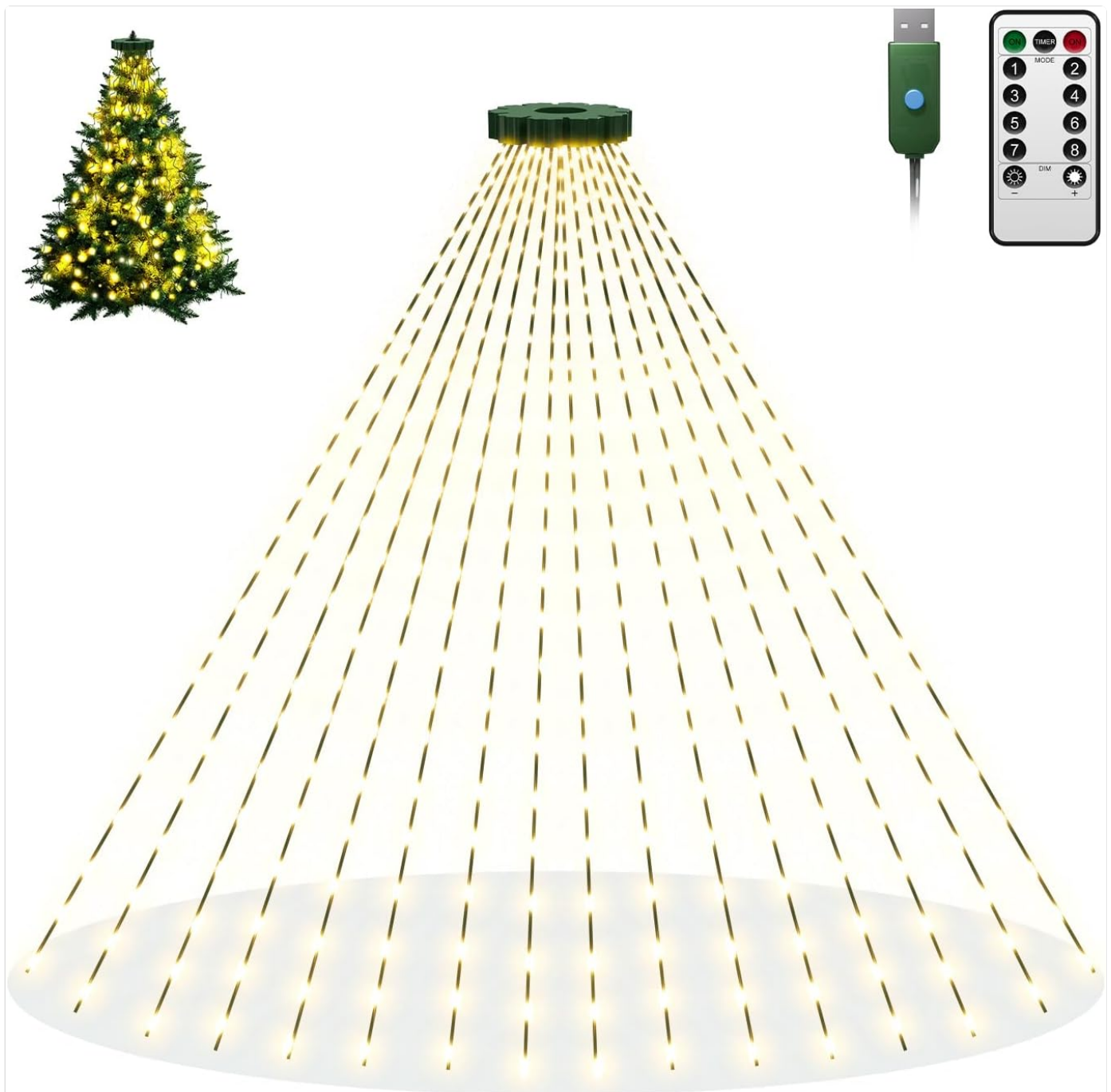
Image: Overview of the btfarm Christmas Tree Lights, showing the top ring, cascading light strands, USB plug, and remote control.