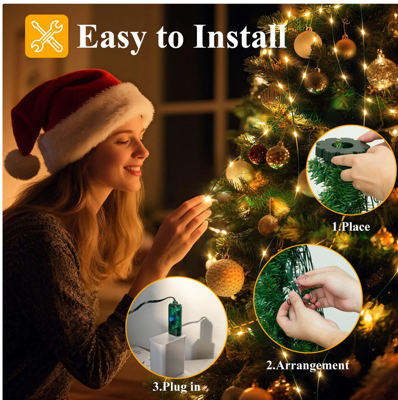
Image: Visual guide showing three steps for easy installation: 1. Placing the ring on top of the tree, 2. Arranging the light strands, and 3. Plugging in the USB connector.