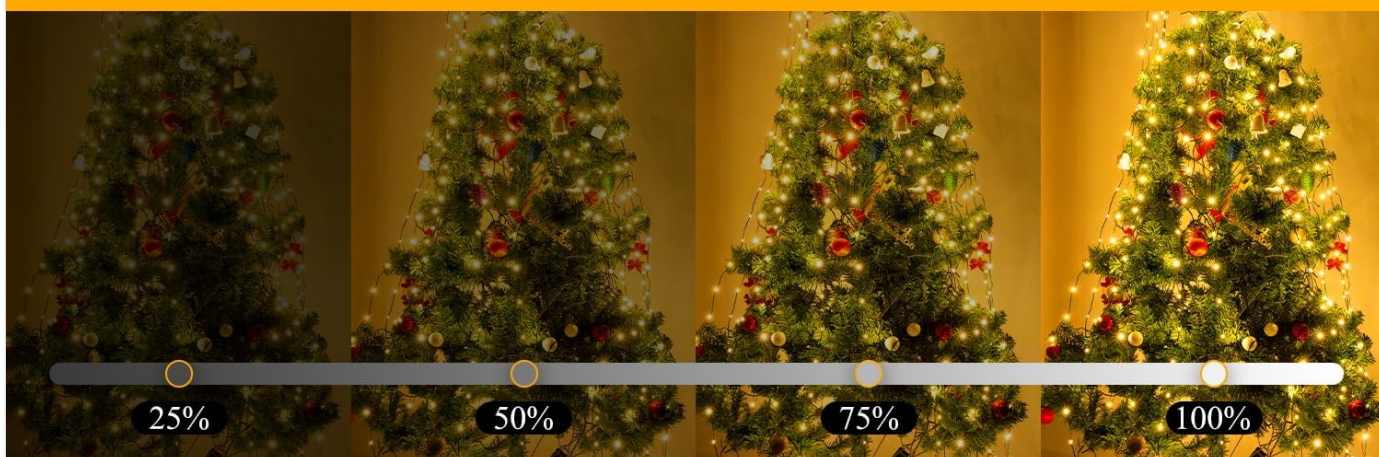
Image: Illustration of the timer function (6 hours on/18 hours off) and the four dimmable brightness levels (25%, 50%, 75%, 100%) on a lit Christmas tree.

Your browser does not support the video tag.