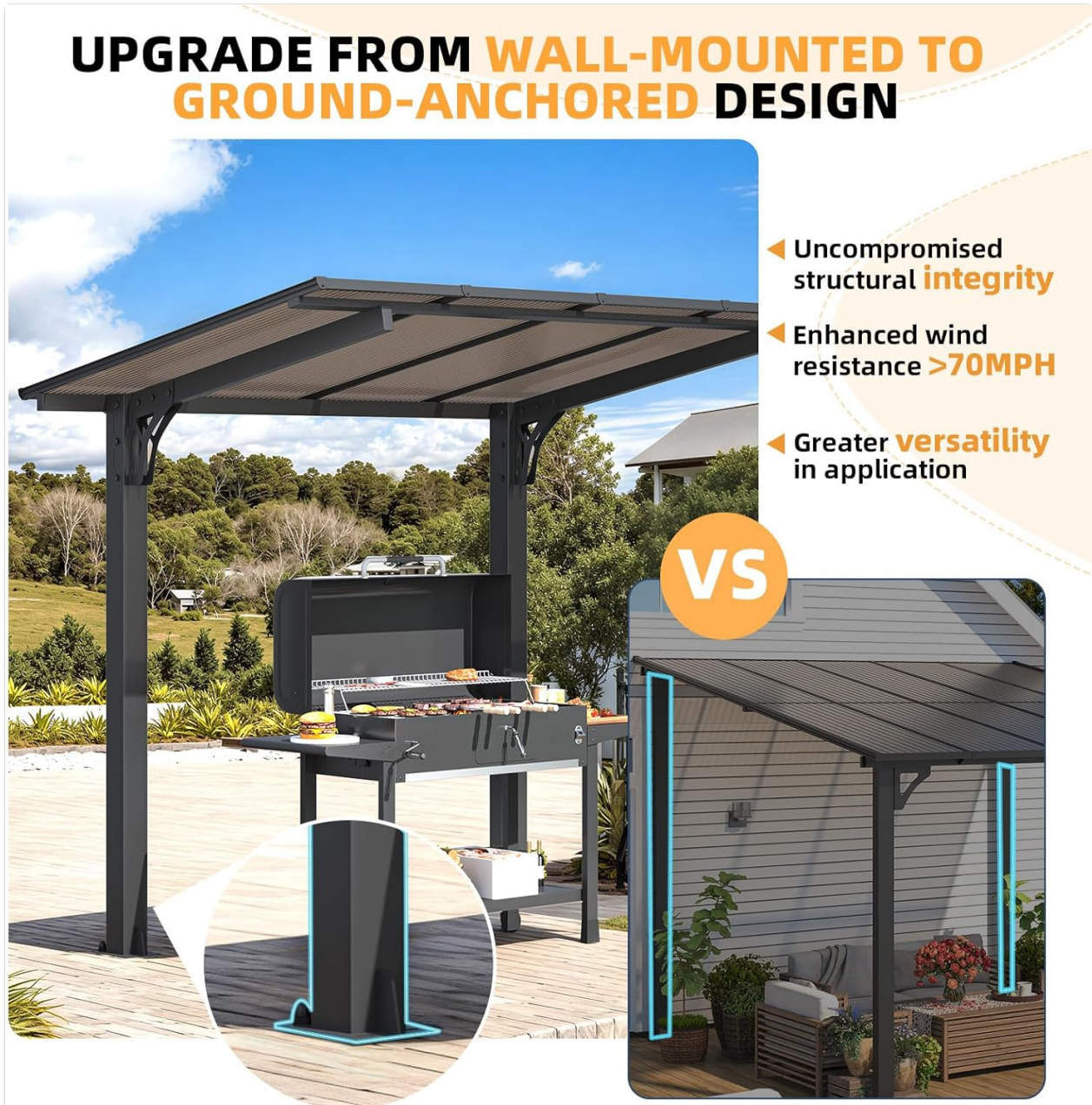
Figure 3.1.1: Freestanding vs. Wall-Mounted Design. This image highlights the ground-anchored design, emphasizing structural integrity, enhanced wind resistance, and greater versatility compared to a wall-mounted setup.