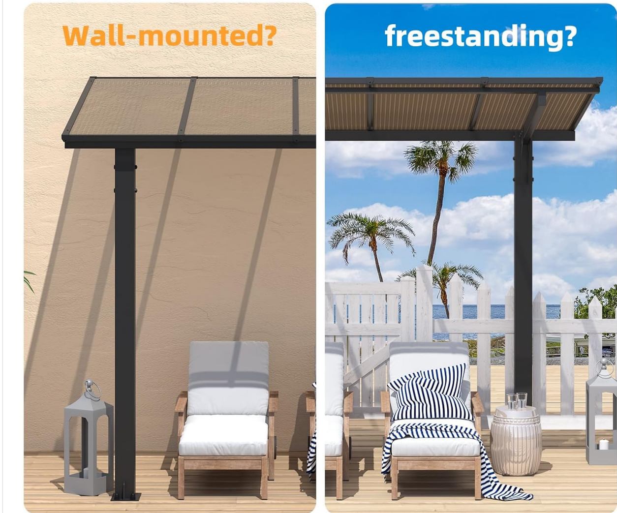
Figure 3.1.2: Customizable Installation Options. This image demonstrates how the gazebo can be installed as either a wall-mounted unit or a freestanding structure to suit various patio or porch configurations.

You can customize the installation to seamlessly complement your patio or porch configuration.