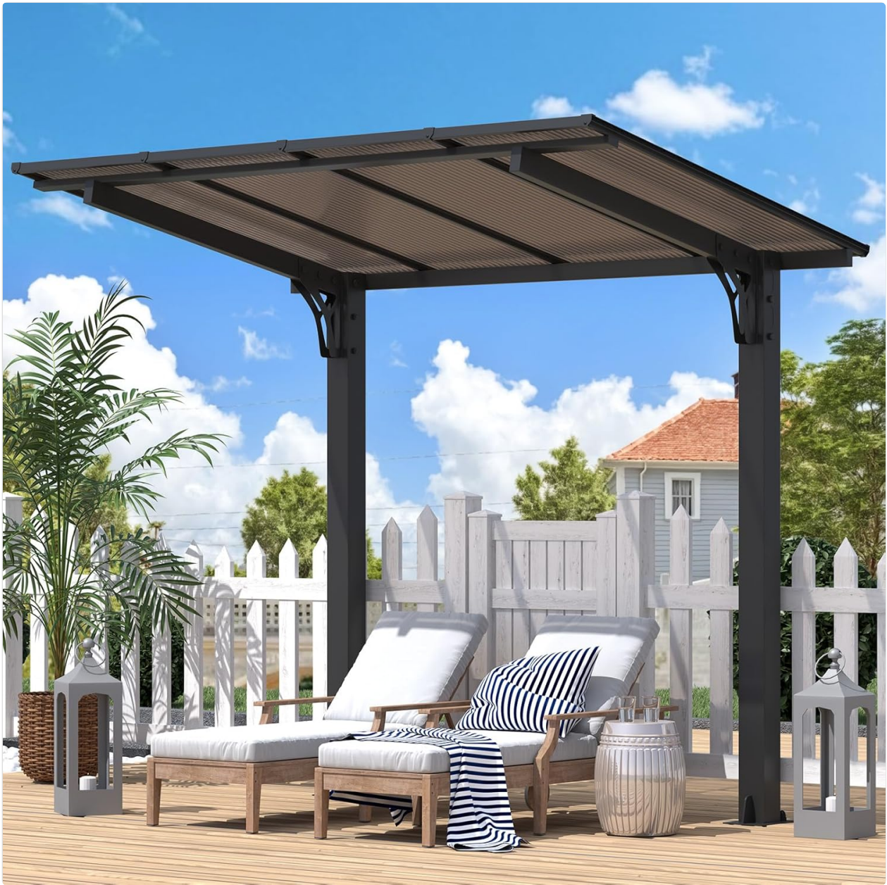
Figure 4.1.1: Gazebo used as a relaxation area. The gazebo provides shade for two lounge chairs on a wooden deck, demonstrating its use as an outdoor sanctuary.