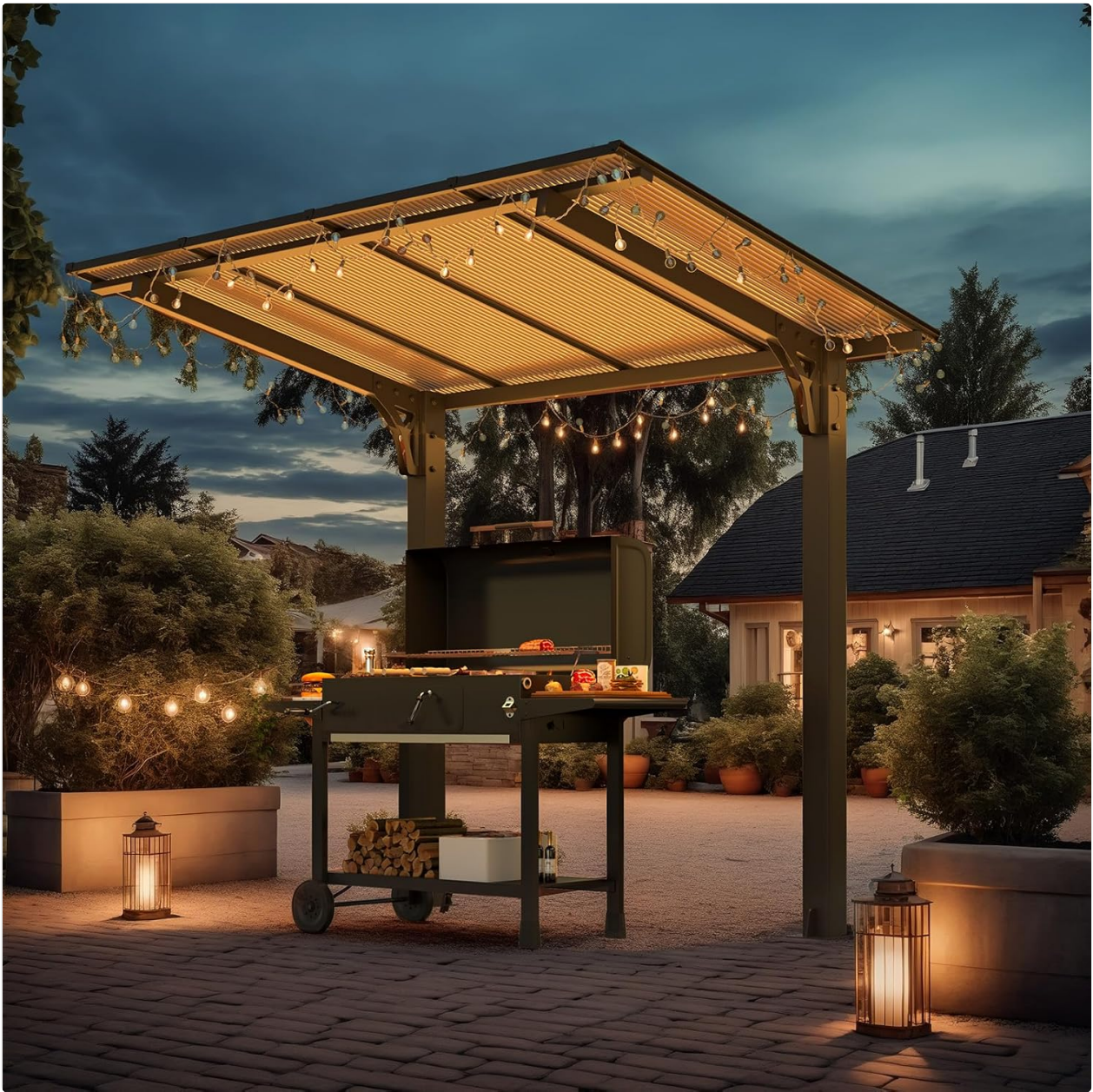
Figure 4.1.2: Gazebo used as a grill shelter. The gazebo covers a grill and preparation area, illuminated by string lights, showcasing its function as a dedicated grilling space.