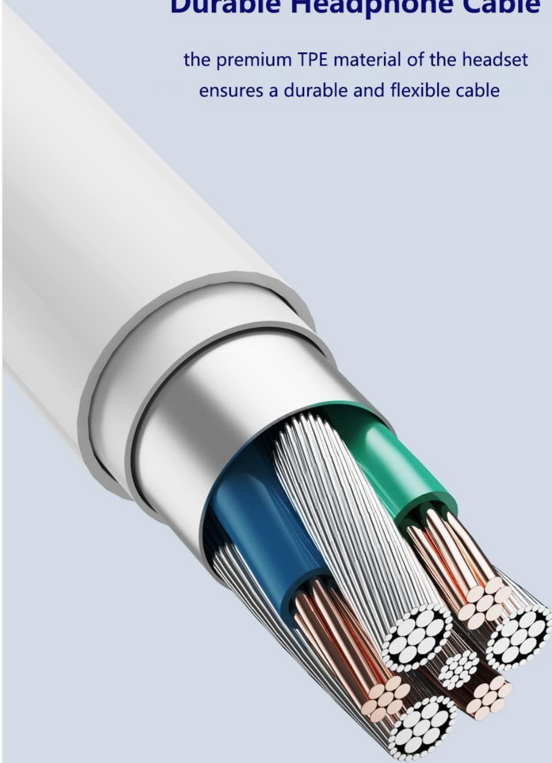
Image: The durable TPE material of the headphone cable ensures longevity and flexibility.

the premium TPE material of the headset ensures a durable and flexible cable