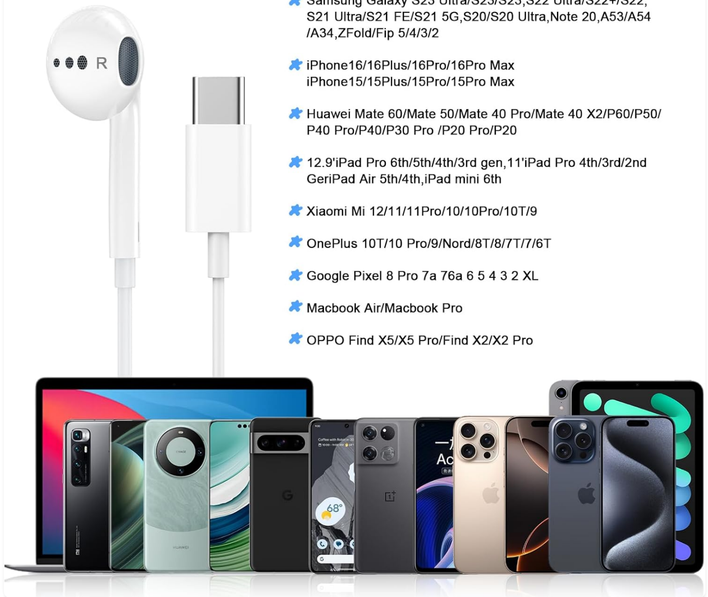
Image: The earbuds are compatible with a wide range of USB-C enabled devices.