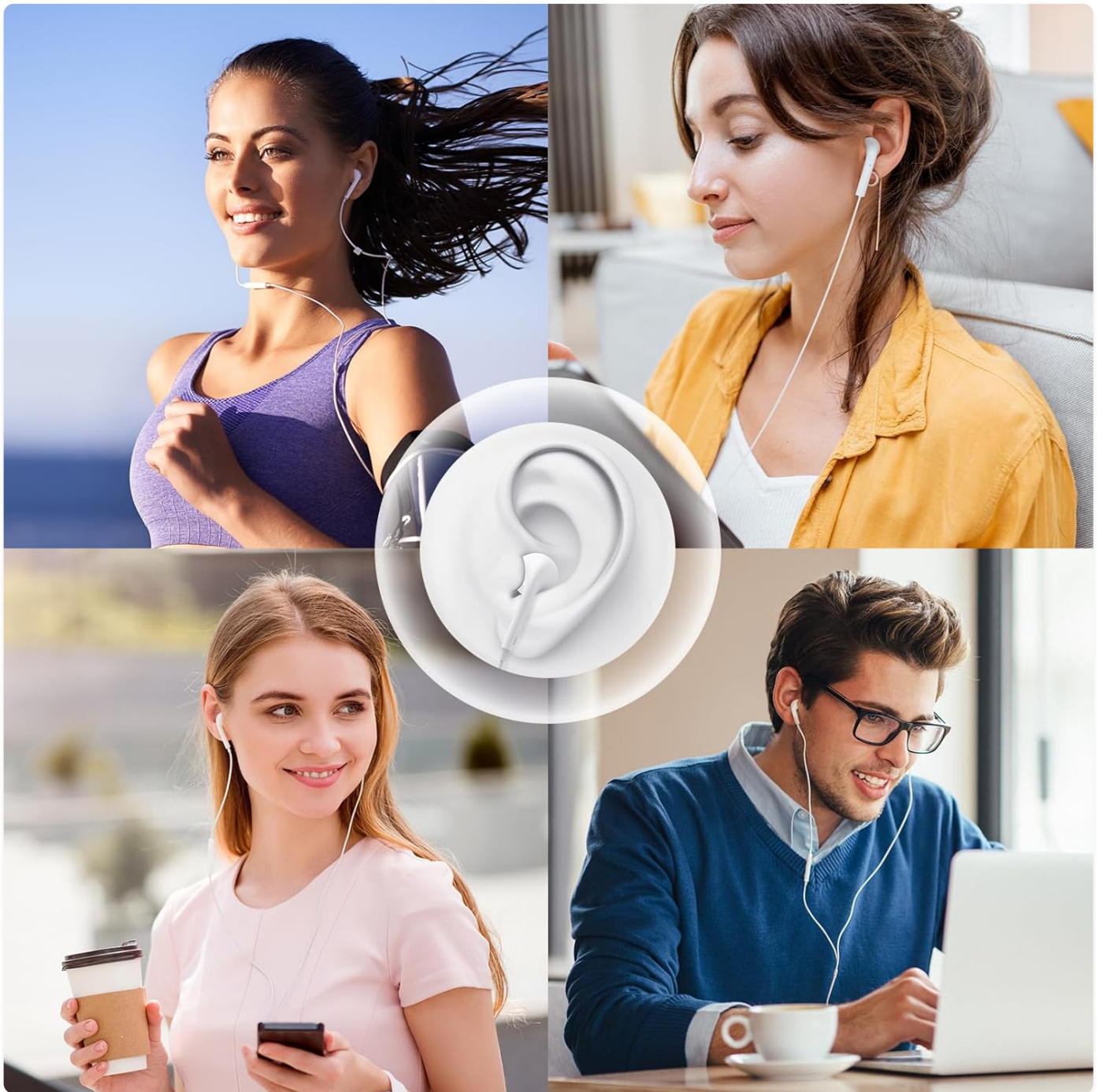
Image: Earbuds in use during various activities, demonstrating their versatility and comfortable fit.