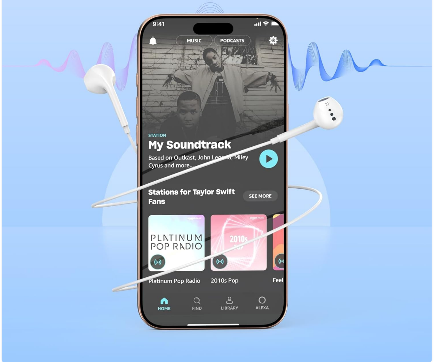
Image: Visual representation of the strong bass and 360-degree premium surround sound experience.

Reduct Noise, Enjoy High Quality Music World