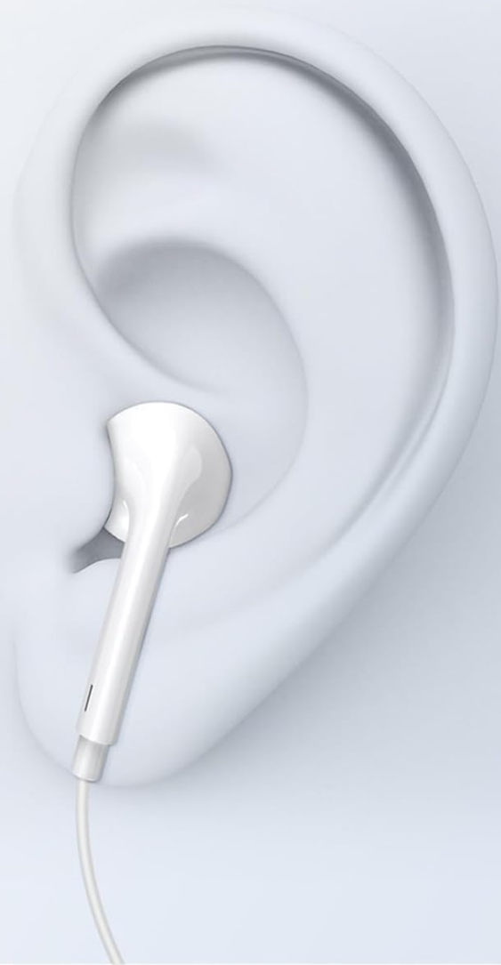
Image: Features highlighting the comfortable wearing experience of the earbuds.