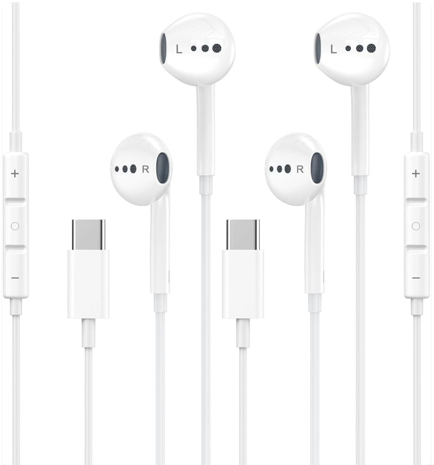
Image: Two pairs of esbeecables USB-C wired earbuds, showcasing their design and connectivity.