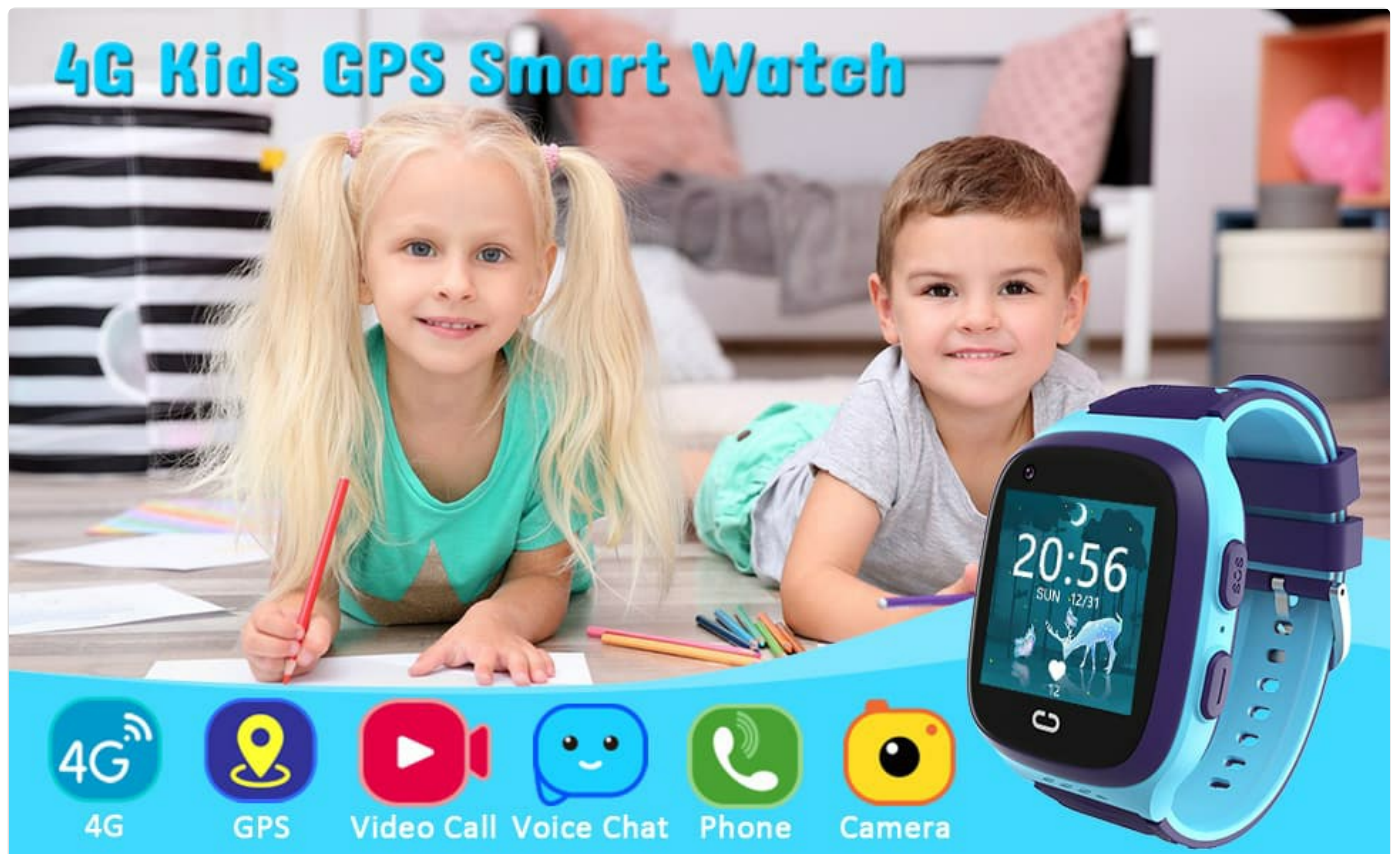
Image: Overview of the Veunti G31 Smart Watch's main features and practical functions.

Welcome to the user manual for your Veunti G31 4G Kids Smart Watch. This device is designed to provide communication, safety, and entertainment features for children aged 5-12. Key functions include 4G connectivity, GPS tracking, video calling, SOS emergency calls, voice chat, a camera, alarm clock, and educational games. Please read this manual carefully to ensure proper setup and operation of the watch.