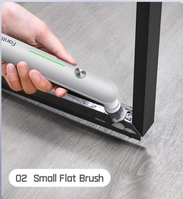
02 Small Flat Brush