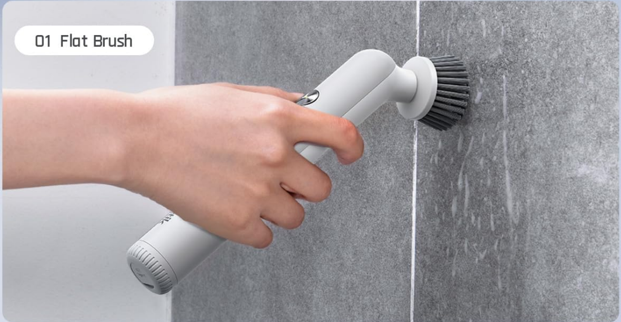
01 Flat Brush