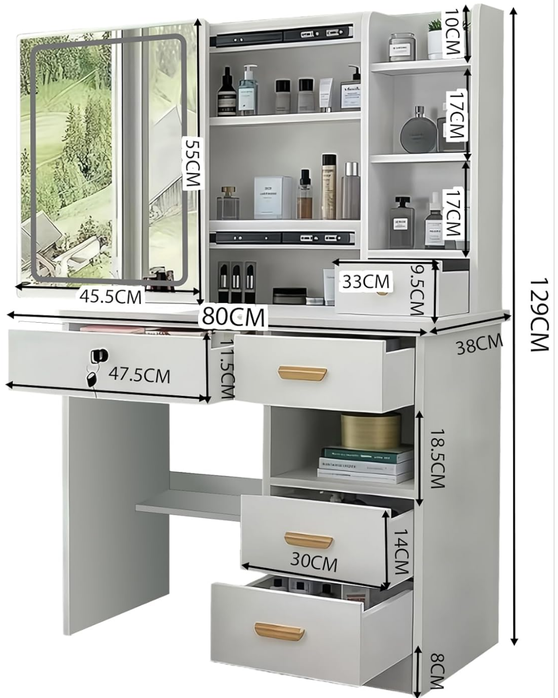
Figure 6: Detailed product dimensions for planning placement and space.