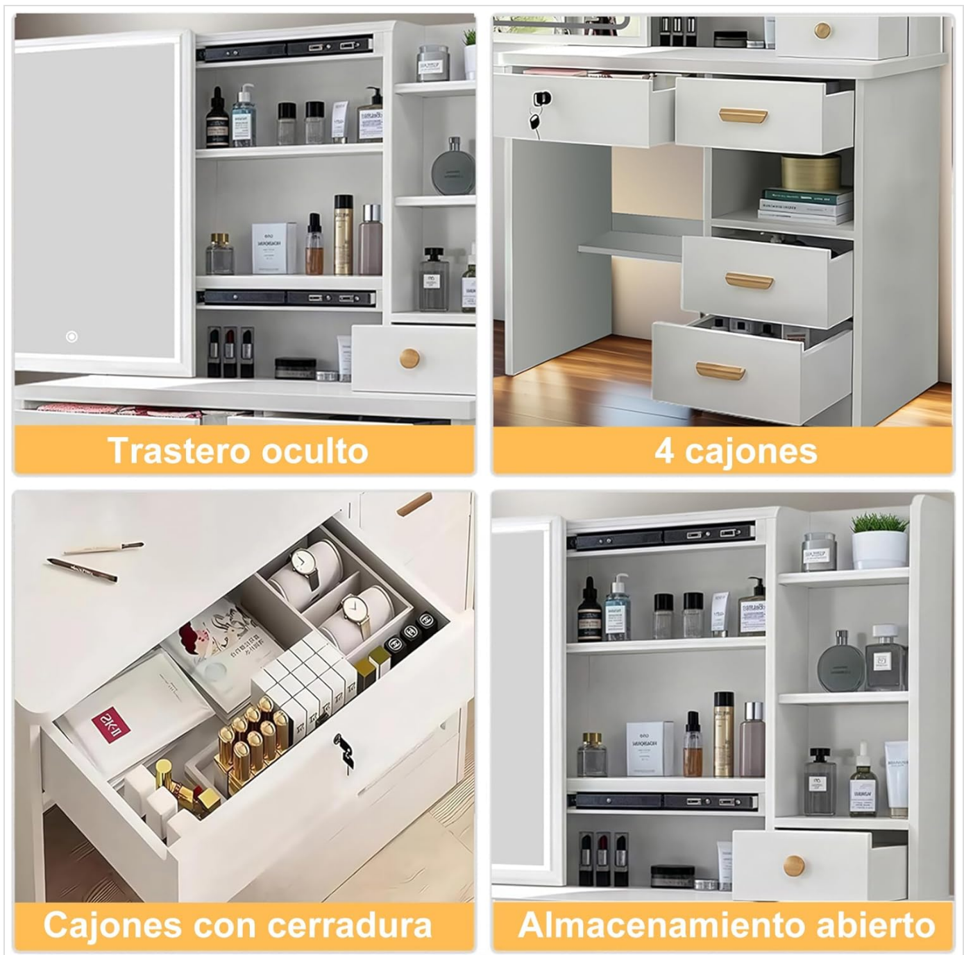
Figure 5: Detailed view of the vanity's storage options, including five drawers and open shelving.