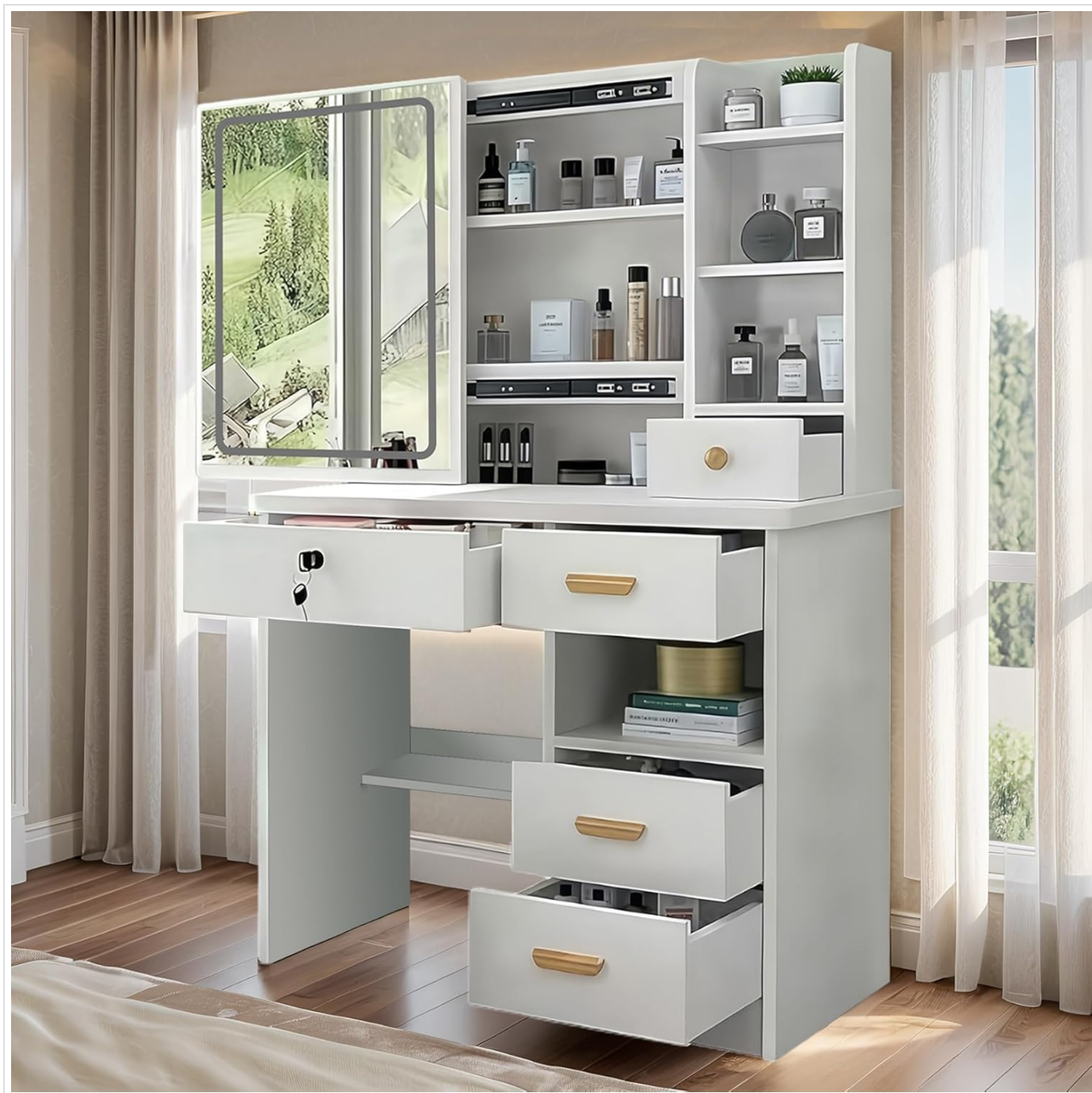
Figure 2: The TRIUMPHKEY Vanity fully assembled, showcasing its mirror, drawers, and storage shelves.