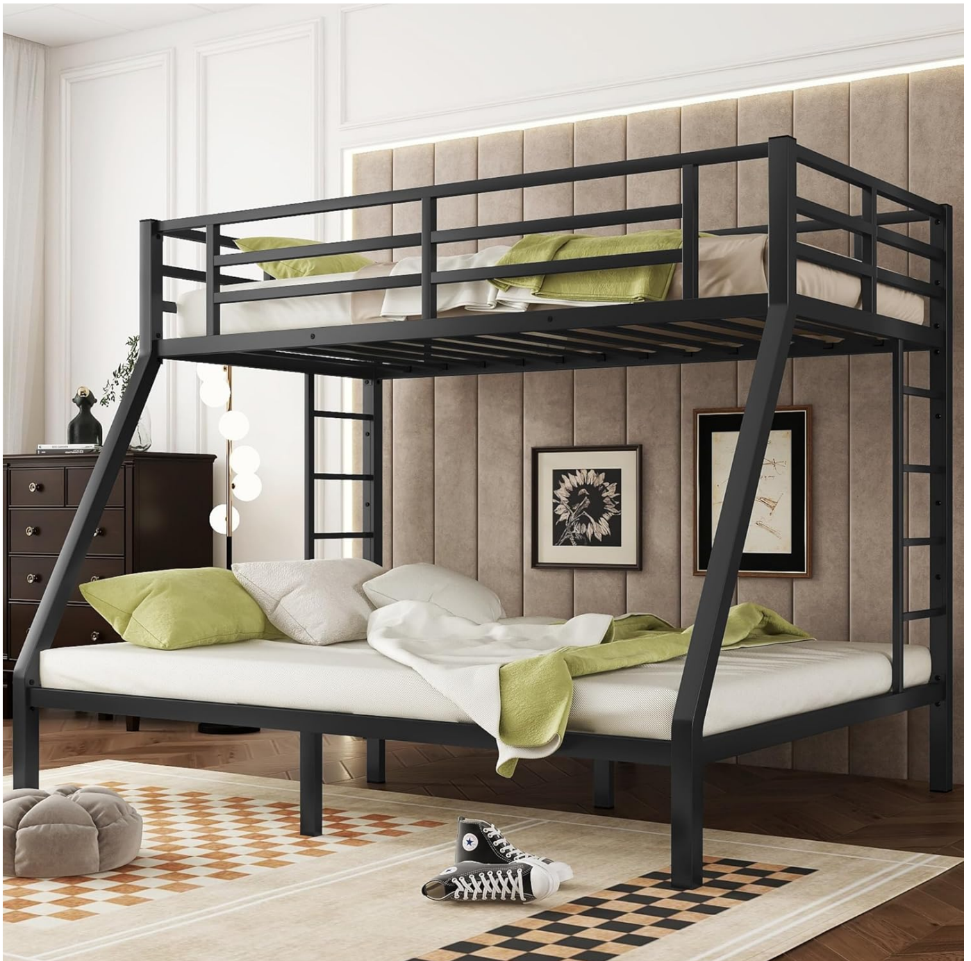
Image: The Bellemave Twin XL Over Queen Bunk Bed, black metal frame, with mattresses and bedding, in a bedroom setting.