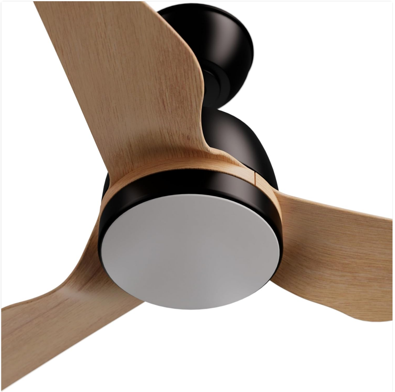
Image: A close-up view of the Sulion MARINA ceiling fan's black motor housing and light wood finish blades, highlighting the integrated LED light.