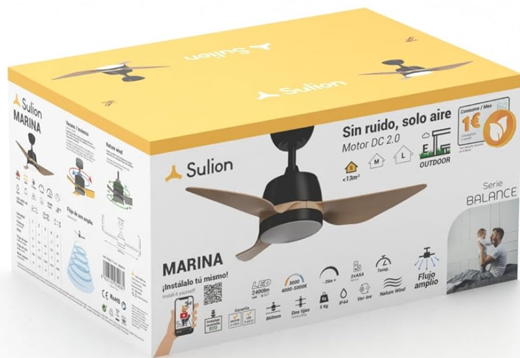
Image: The Sulion MARINA ceiling fan is packaged in a brown and white box, displaying key features and the fan itself.