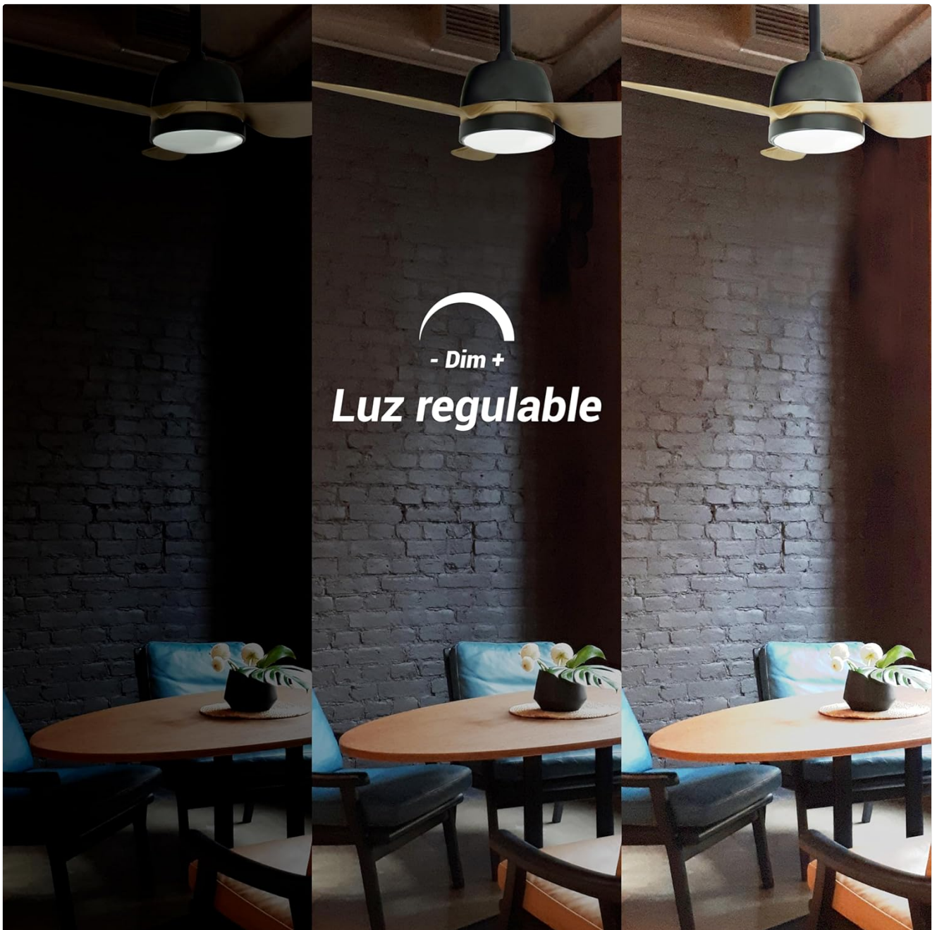
Image: A visual representation of the fan's dimmable LED light, showing varying light intensities in a room setting.