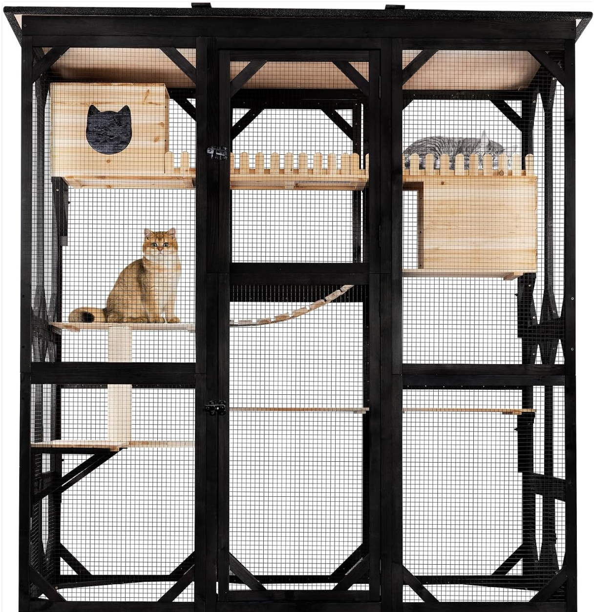
Image: Front view of the FunXplore 71.1\"L Large Outdoor Catio, showcasing its multi-level design and spacious interior for cats.