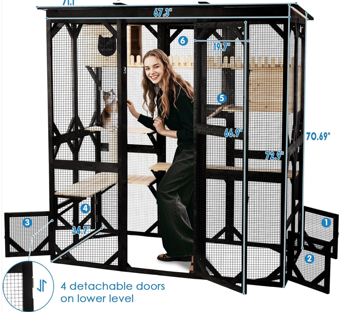
Image: A person standing inside the catio, illustrating the walk-in height and overall dimensions.

71.1" Enough for 2-6 cats · 6 Access Doors