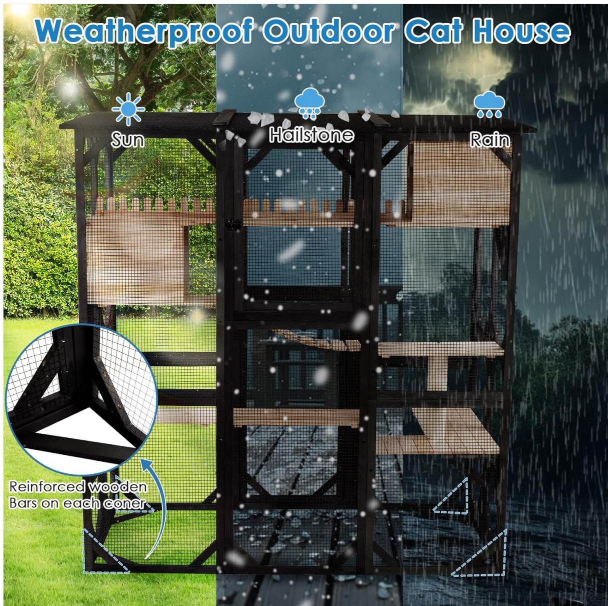
Image: Illustration of the weatherproof asphalt roof and reinforced wooden bars at each corner, highlighting structural durability.