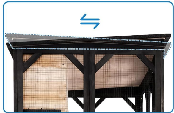
Image: Interior view of the multi-level cat enclosure, showing platforms, hideaways, and the aerial crossing bridge for cat activity.

Dual-direction sloping roof for easy installation