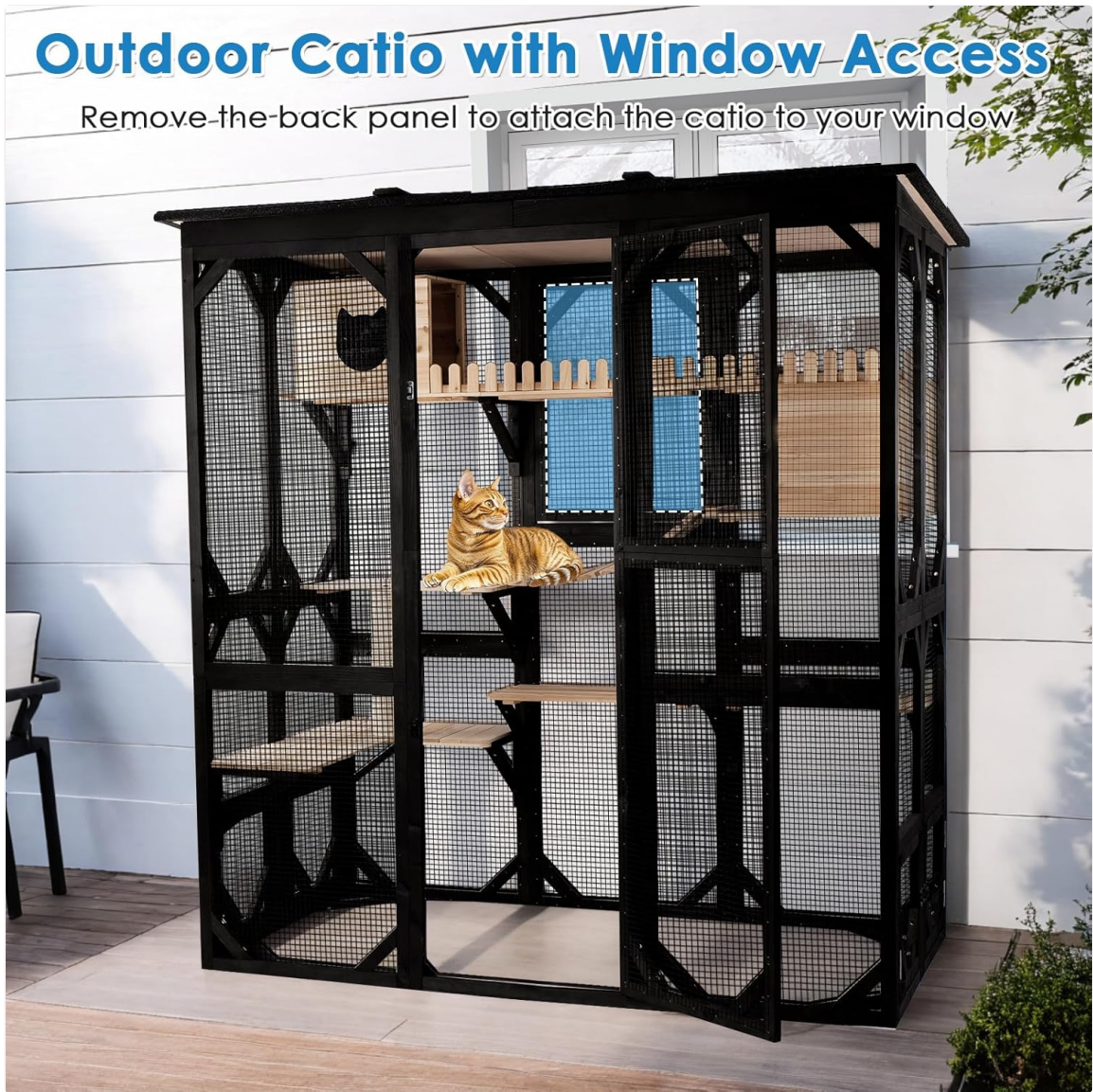
Image: The catio positioned against a house, demonstrating how the back panel can be removed for window access.

Remove the back panel to attach the catio to your window