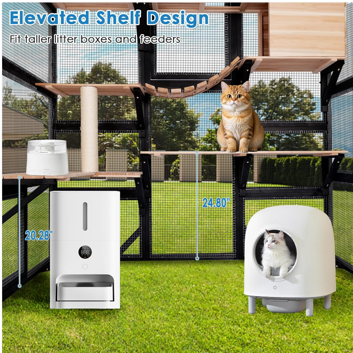
Image: An elevated shelf within the catio, demonstrating its capacity to hold a litter box and feeder.