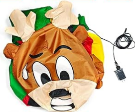
8.5 FT Inflatable Decoration with Power Adaptor *1