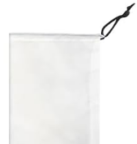
Sand Bags *1