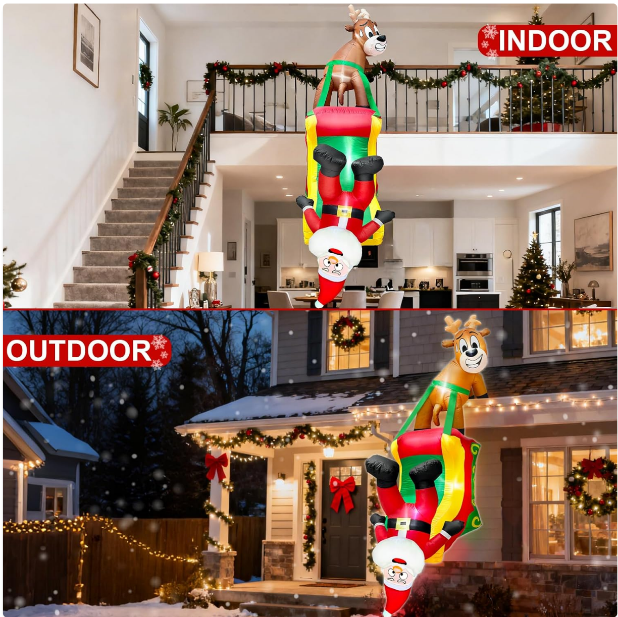
Image 5.1: The inflatable can be used in various indoor and outdoor settings.