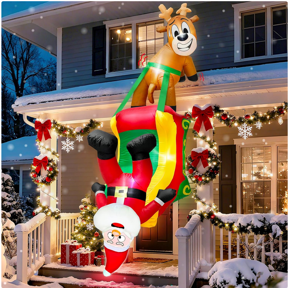
Image 1.1: The 8.5 Ft Hanging Christmas Inflatable installed on a house porch.