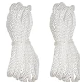
10.5 Ft Ropes *2