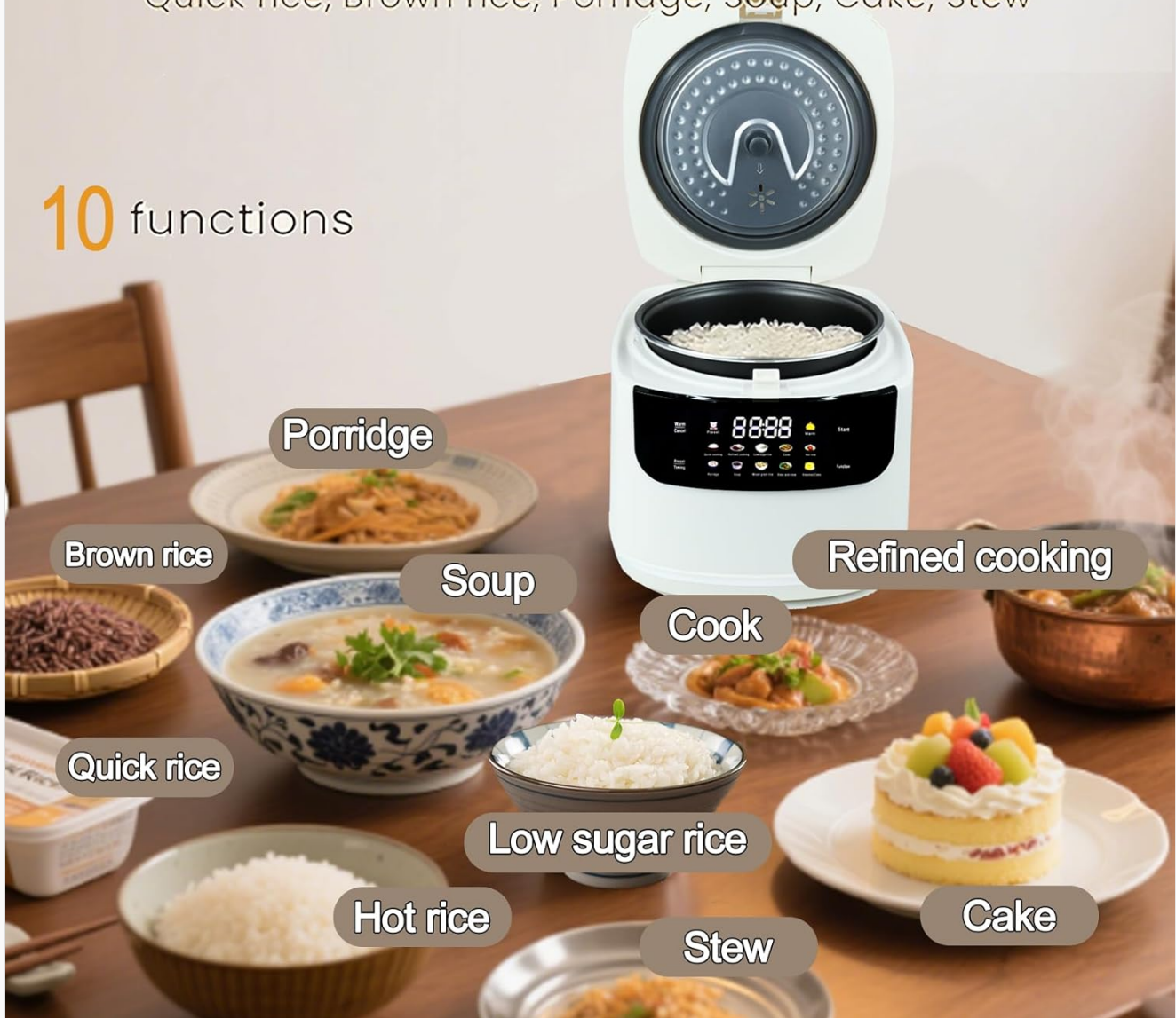
Image: The rice cooker's control panel highlighting its 10 functions, accompanied by images of various dishes that can be prepared, such as porridge, soup, mixed grain rice, stew, and cake.