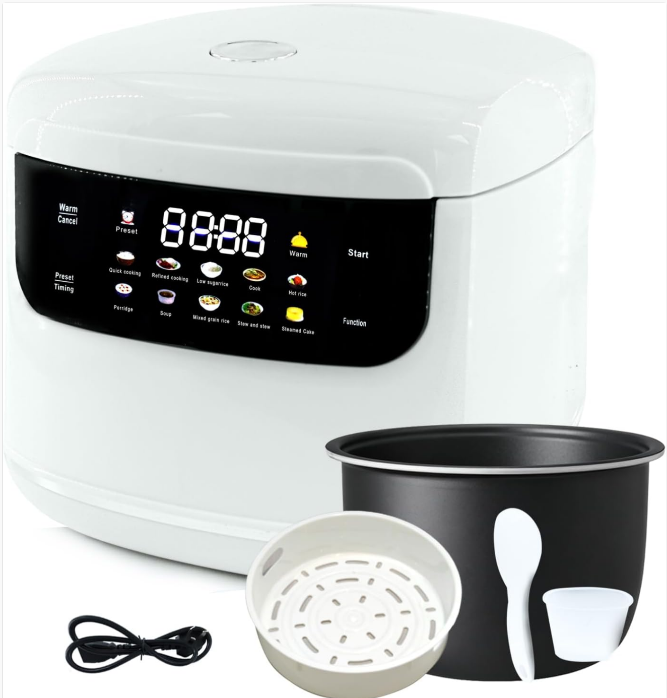
Image: The LMFUEN Mini Portable Rice Cooker shown with its non-stick inner pot, measuring cup, rice spoon, and power cord.