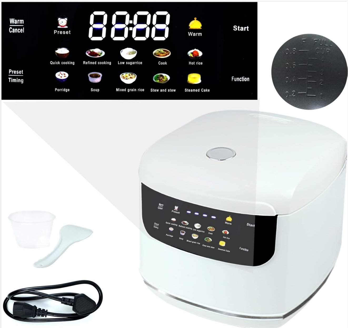
Image: A detailed view of the rice cooker's control panel, displaying various cooking functions, and the inner pot with clear measurement lines.