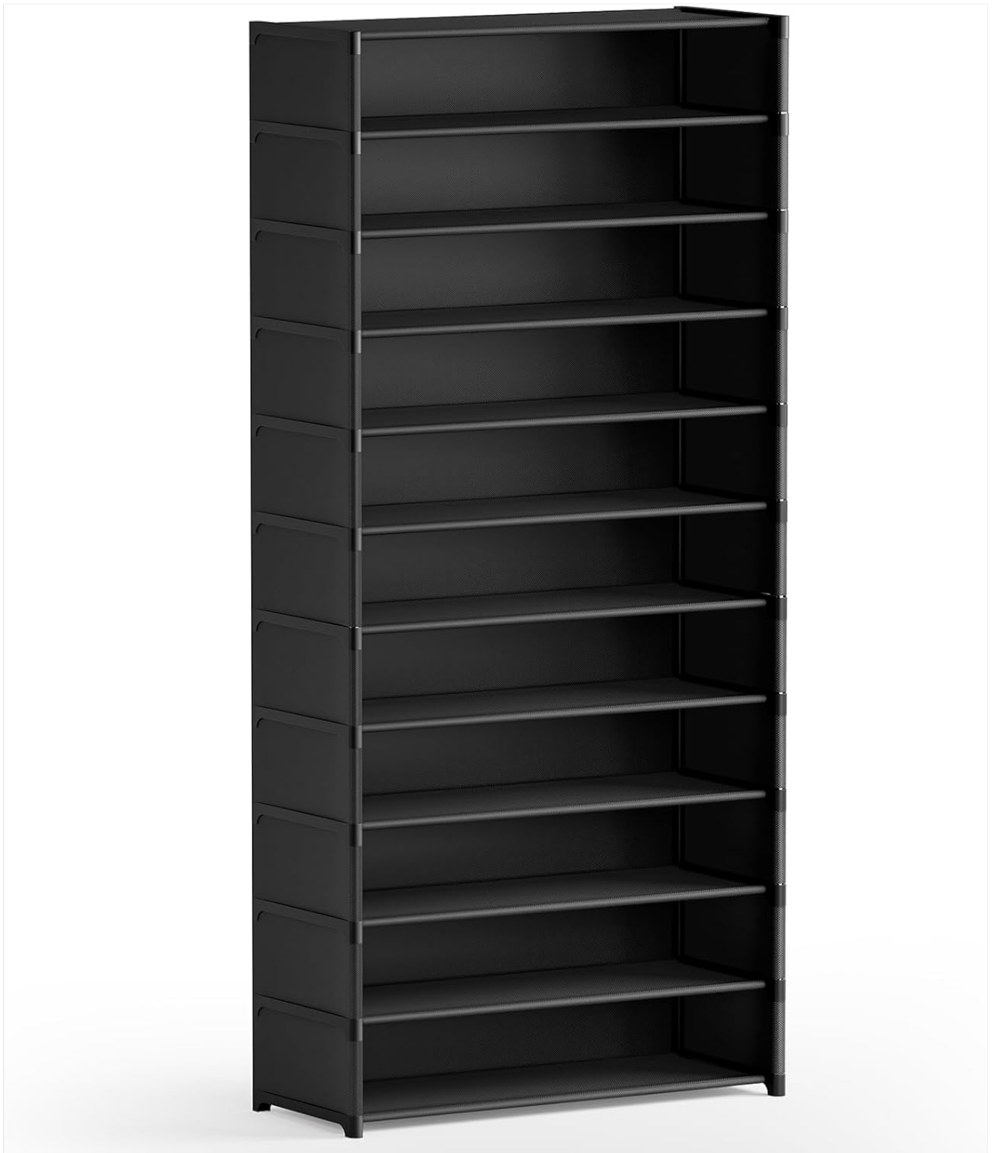
Image: The UNITSTAGE 12-Tier Shoe Rack, fully assembled and ready for use.

This image shows the complete 12-tier shoe rack, highlighting its tall, narrow design suitable for various spaces. It is depicted empty, ready to be filled with footwear.