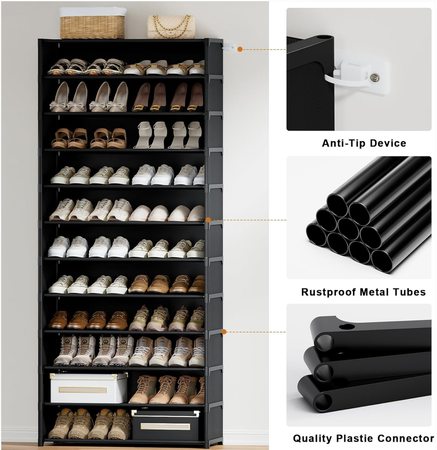
Image: Close-up of key components including the anti-tip device, rustproof metal tubes, and plastic connectors.

This image highlights the robust construction materials: the anti-tip device for stability, the rustproof metal tubes forming the frame, and the durable plastic connectors that join the structure.