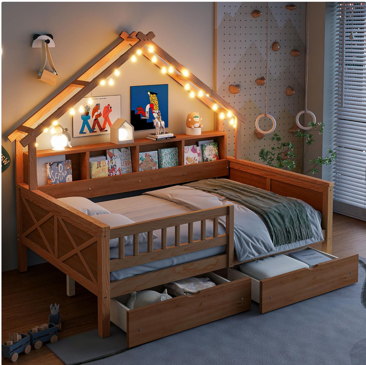
Figure 3: Storage drawers and shelves in use