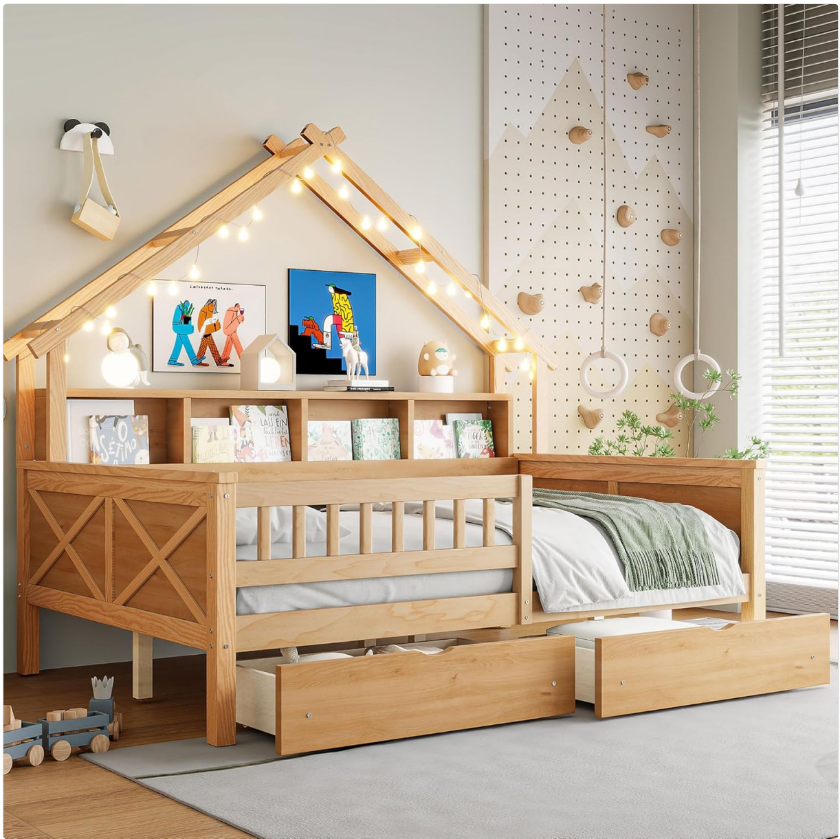
Figure 1: Loissall Full Size House Platform Bed (Natural Finish)