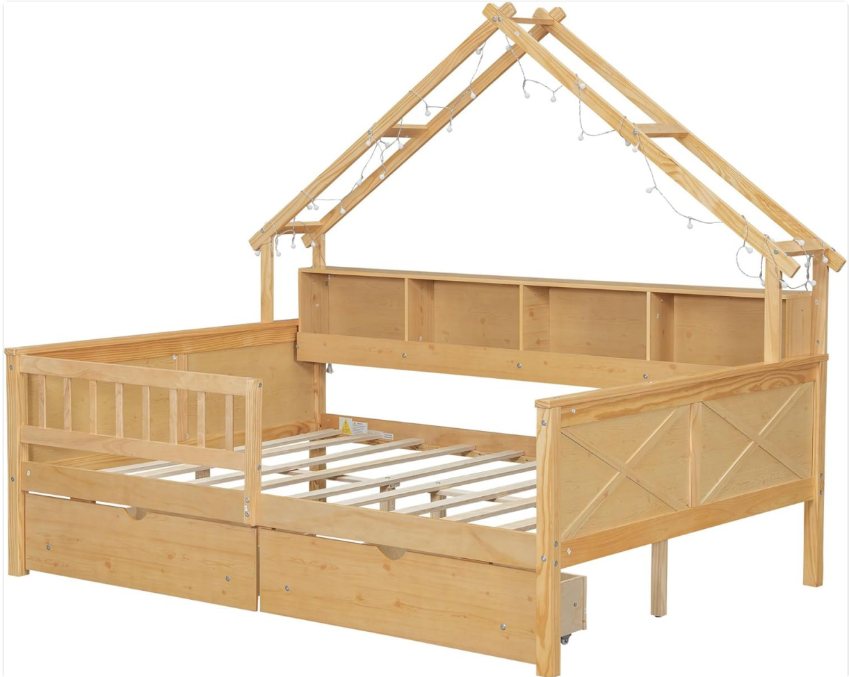
Figure 2: Main bed frame components and slats