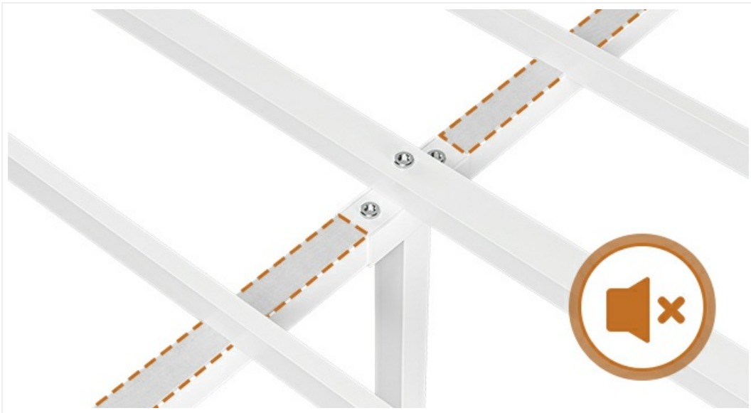
Figure 3.1: Detail showing the silence foam strips on the bed frame slats, designed to reduce noise.

Note: Two people are recommended for assembly to ensure stability and ease of construction.