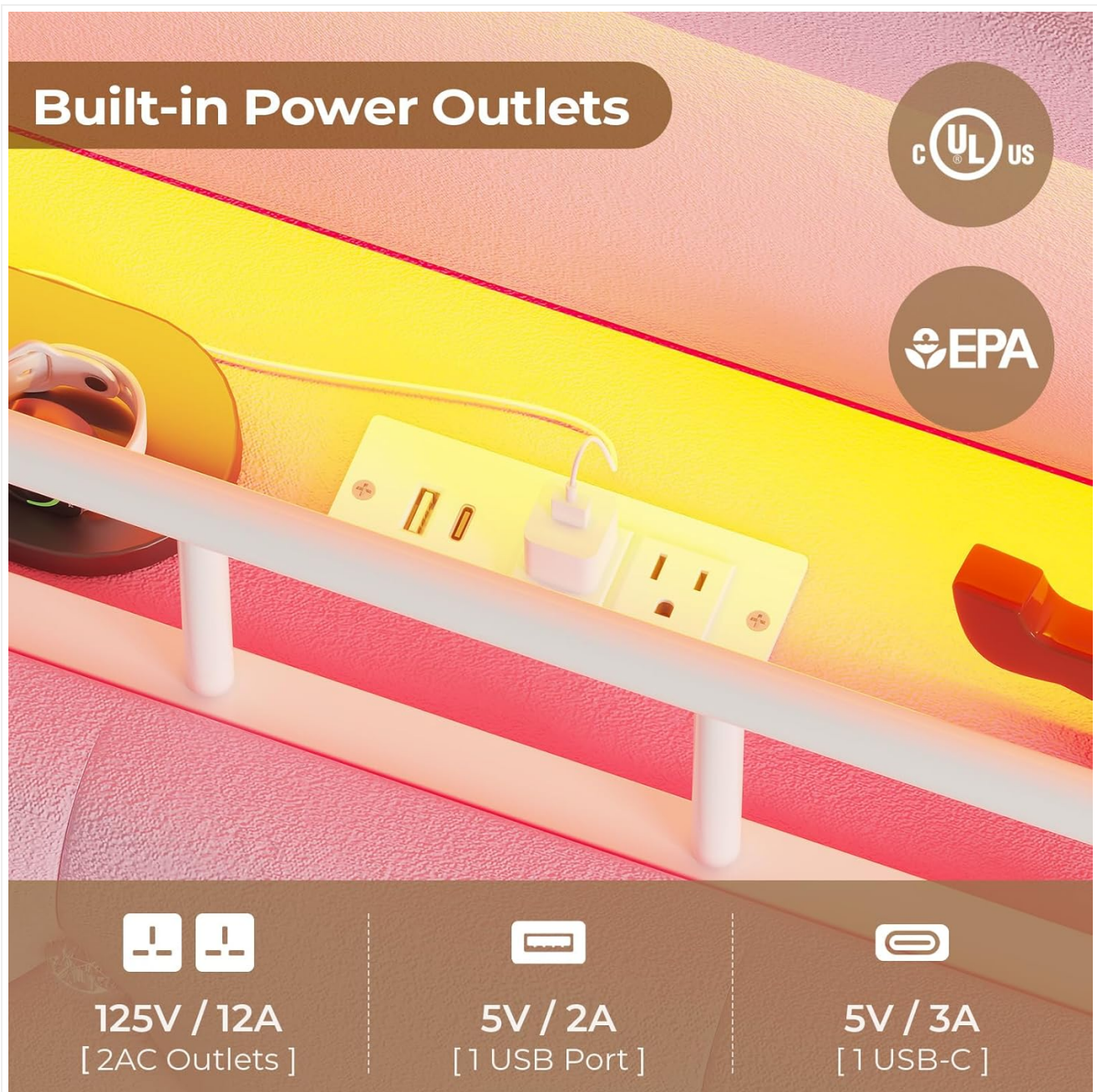
Figure 4.2: Close-up of the built-in power outlets and USB ports on the headboard for charging electronic devices.