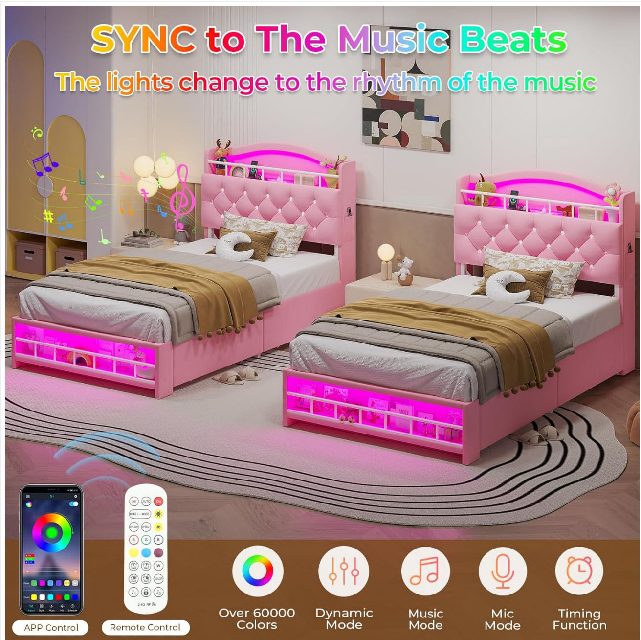
Figure 4.1: The RGB LED lights can synchronize with music beats, offering various dynamic lighting effects.