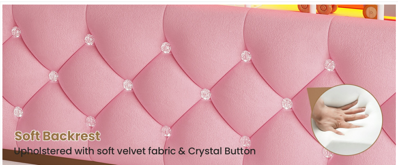
Figure 2.2: Close-up view of the soft velvet fabric upholstery with crystal button tufting on the headboard.