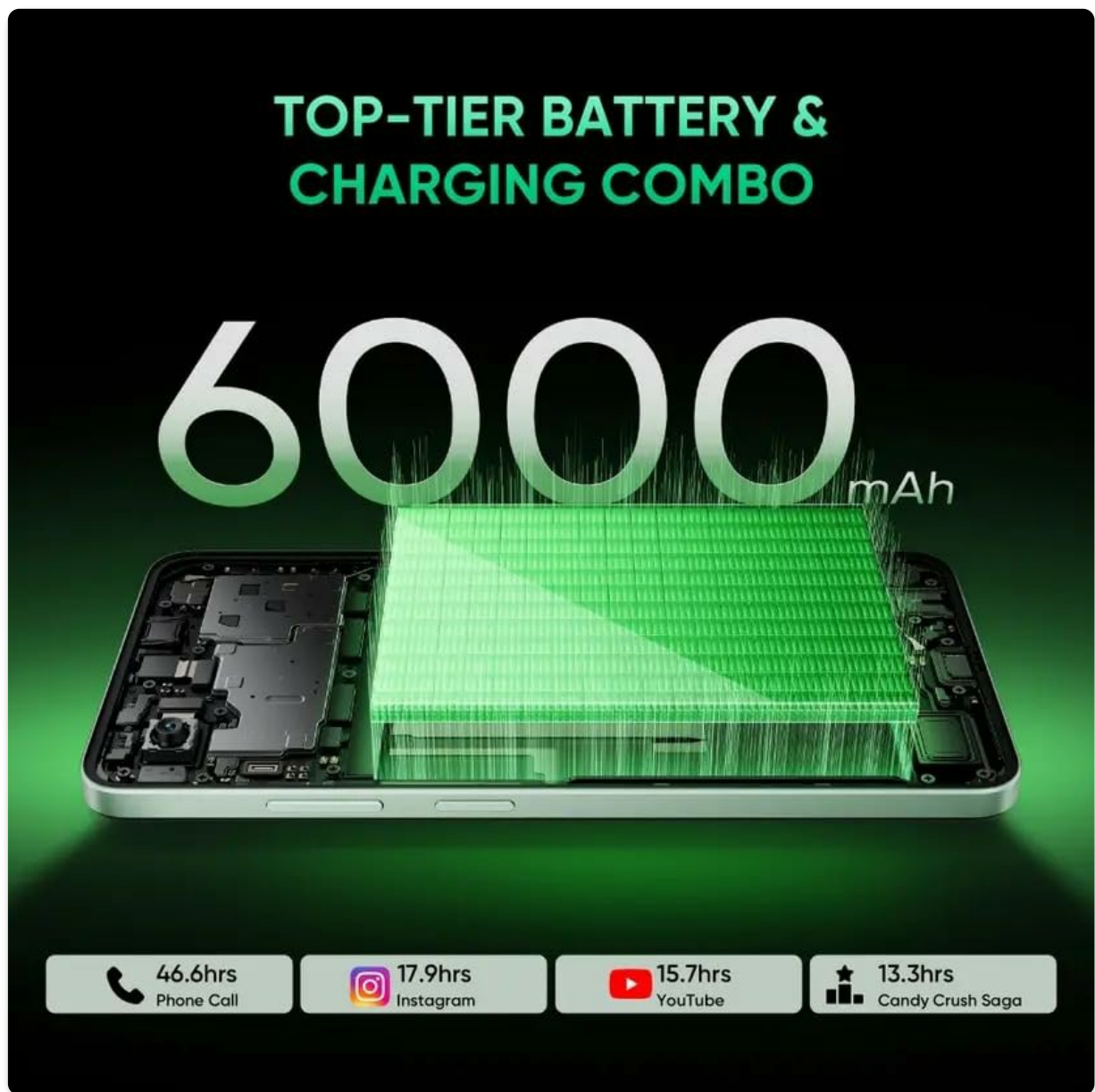
Image 4.1: Infographic detailing the 6000mAh top-tier battery and its estimated usage times for various activities on the realme C73 5G.