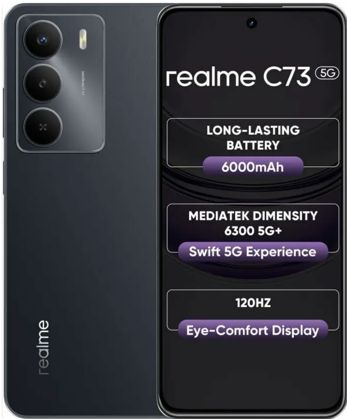
Image 1.1: Front and back view of the realme C73 5G smartphone, showcasing its design and camera module.