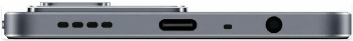
Image 2.2: Bottom view of the realme C73 5G, highlighting the USB Type-C charging port, speaker grille, and 3.5mm headphone jack.