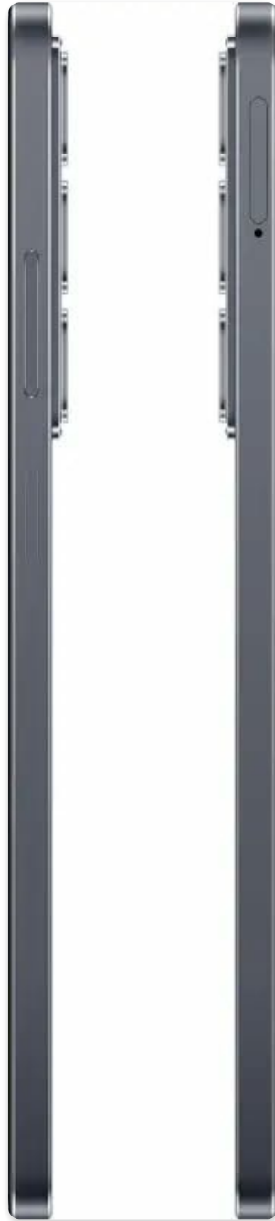
Image 2.1: Side view of the realme C73 5G, illustrating the location of the SIM card tray and physical buttons.