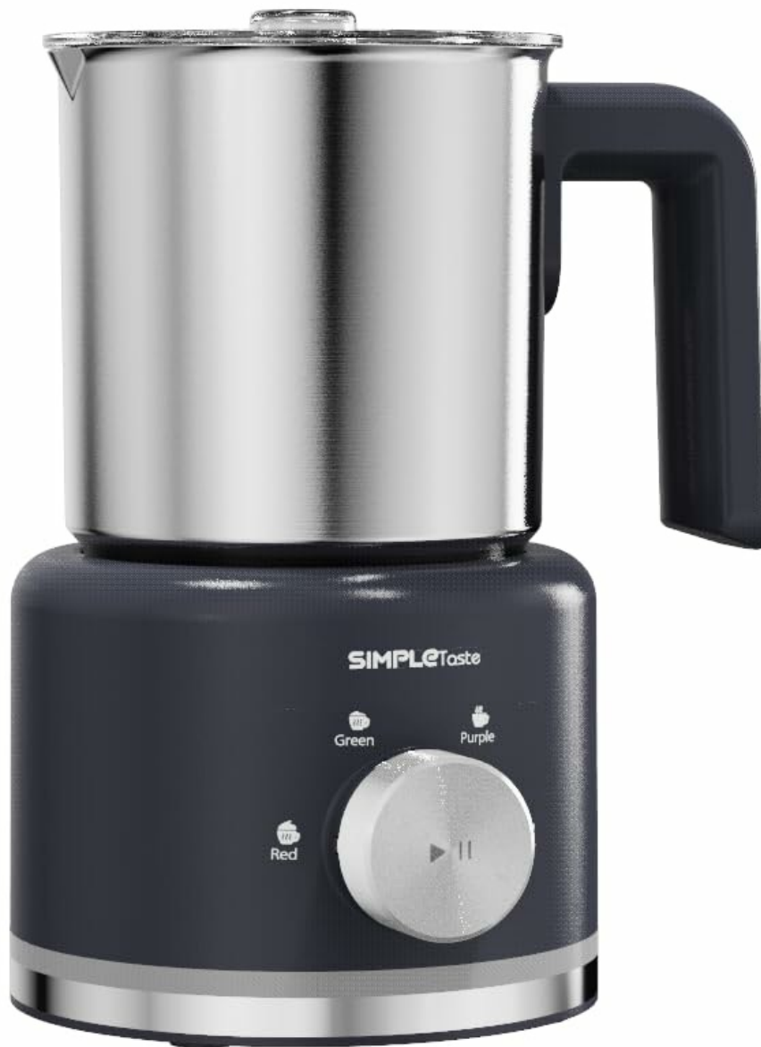
Image: The main unit of the SIMPLETASTE 4-in-1 Electric Milk Frother, showcasing its sleek design.