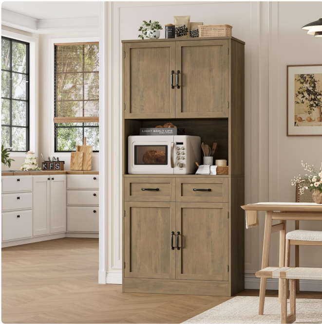
Figure 3: Open compartment suitable for a microwave or coffee station.