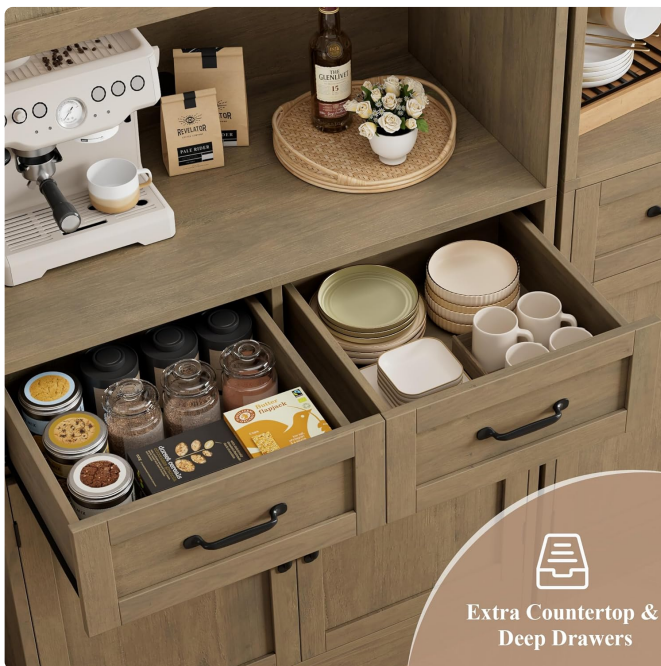
Figure 4: Deep drawers and internal shelving for organized storage.