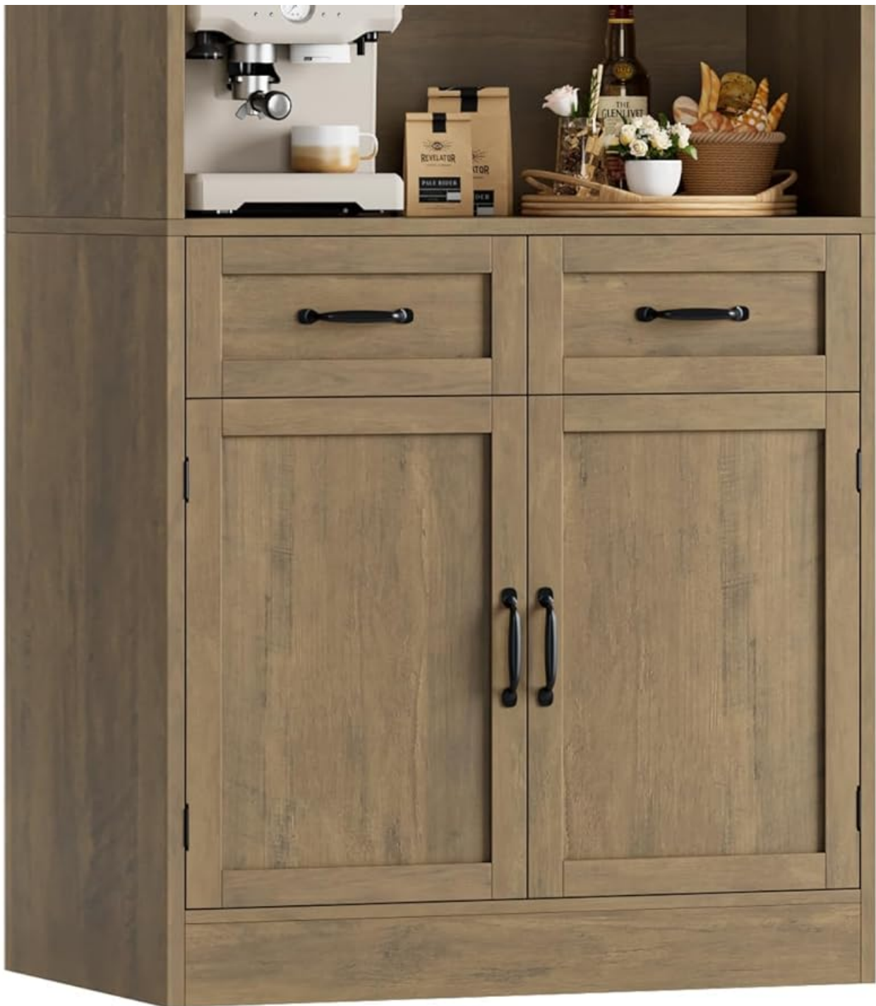
Figure 1: Assembled HOSTACK 71-inch Tall Kitchen Pantry Storage Cabinet.