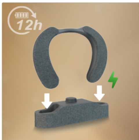
Image: The neck speaker being charged on the base station, indicating 12 hours of battery life.

To charge the neck speaker, simply place it onto the charging base station. Ensure the charging contacts align. An indicator light on the base station or neck speaker will show the charging status. A full charge provides up to 12 hours of listening time.