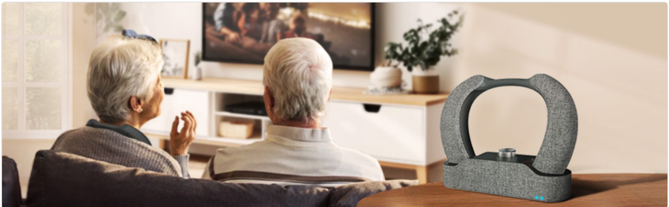
Image: The LEICKE EP95142 system in use, providing clear audio for TV viewing.

The LEICKE EP95142 Wireless TV Headphones are designed to enhance the TV listening experience, especially for seniors or individuals with hearing difficulties. This device functions as both a personal neck speaker and a family speaker, offering clear, delay-free audio via 2.4GHz wireless technology and Bluetooth 5.3 connectivity. It features multiple input options including HDMI ARC, Optical, and AUX, ensuring broad compatibility with various television sets and audio sources.