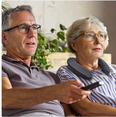
Image: An individual enjoying personalized TV audio with the LEICKE neck speaker.