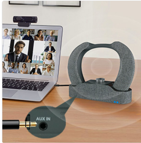
Image: The base station can also be connected to a laptop or other devices using the AUX IN port.