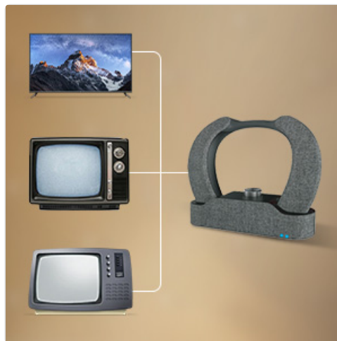
Image: The base station can connect to different TV models using various audio inputs.