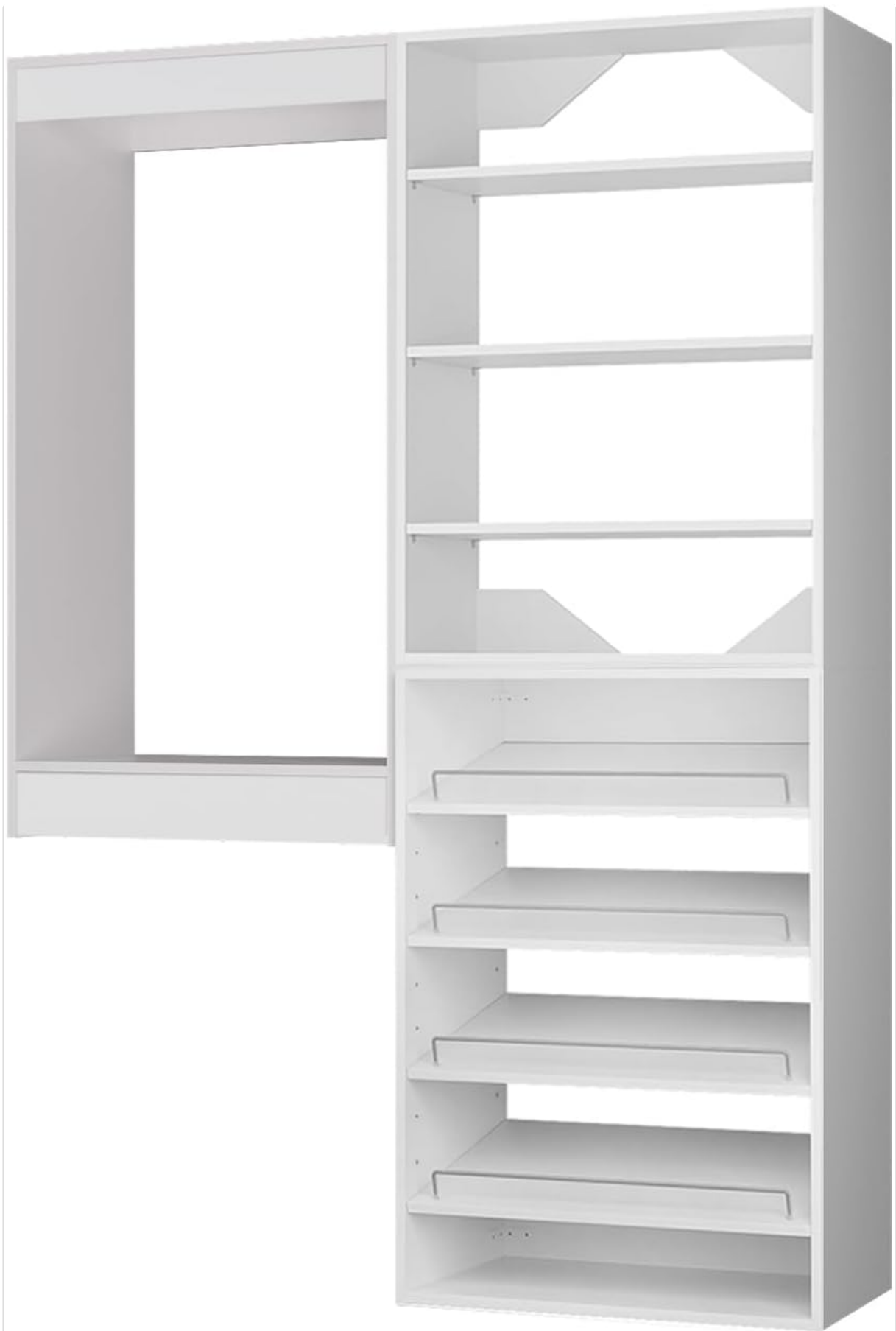
Image: Overview of the individual components included in the package, showing the double hanging section and the shoe shelf tower before assembly.