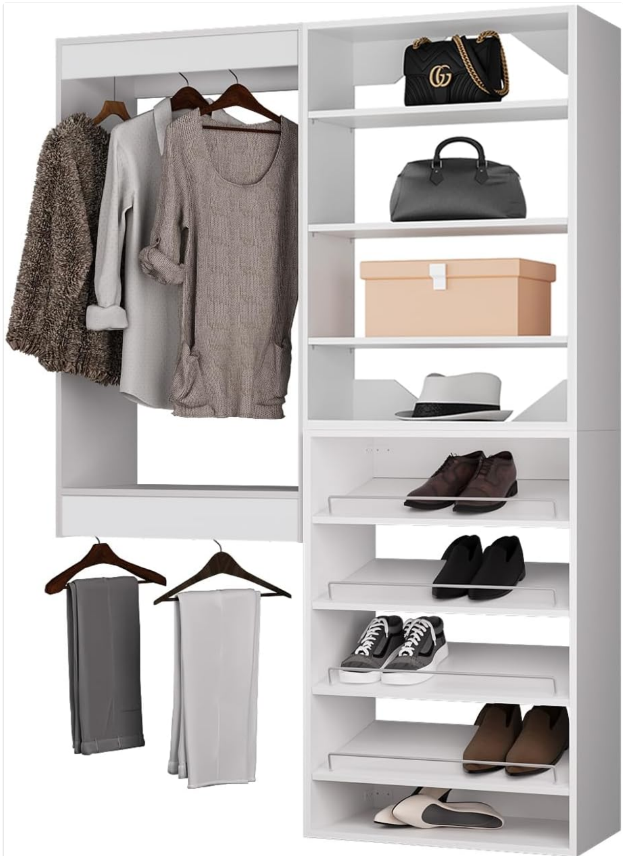
Image: The fully assembled 46" wide ROOMTEC Modular Closet System, showcasing the double hanging section and the shoe shelf tower with various items stored.