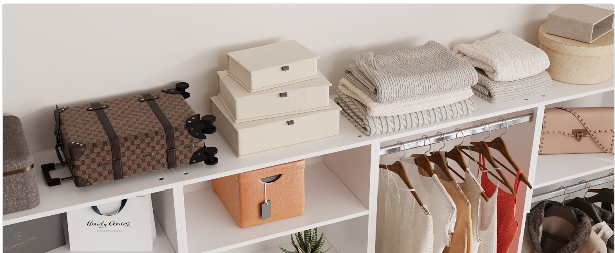
Image: A close-up view demonstrating the adjustable shelf feature within the closet tower, highlighting the flexibility for storage.