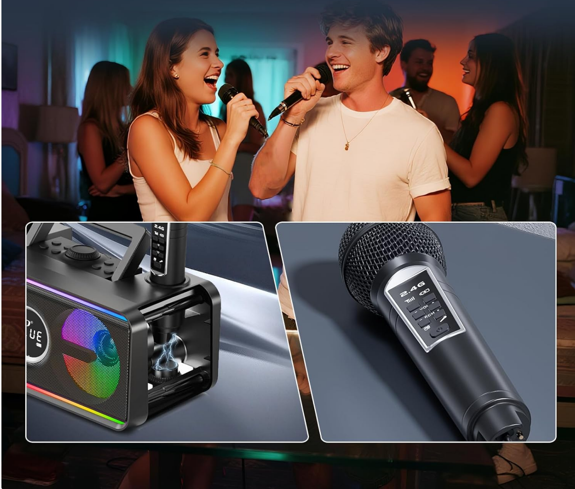
Image: The integrated design allows for convenient storage and charging of the microphones directly within the main unit.

Power On the Move, Charge Without Limits