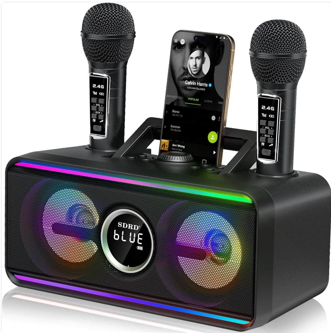
Image: The SDRD SD-216 Karaoke Machine, showcasing its compact design, dual microphone docks, and vibrant LED lights.