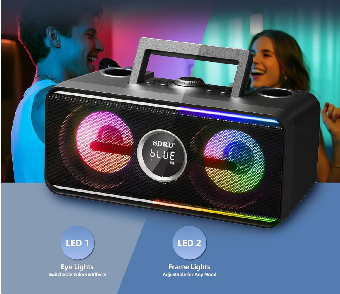
Image: The karaoke machine's dual LED zones provide customizable lighting effects to match any mood or occasion.

Customize Your Party Vibe with Dual LED Zones