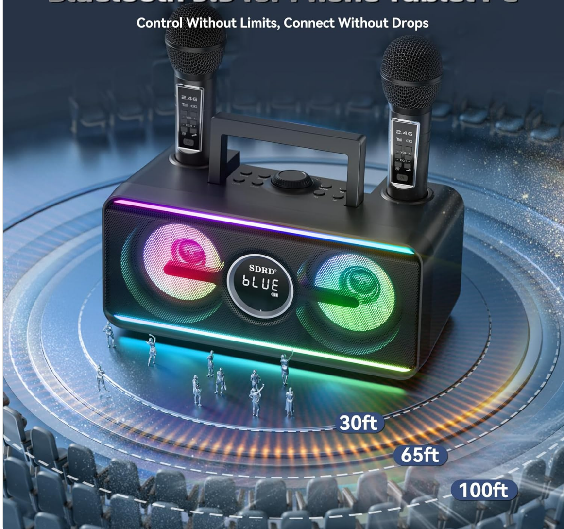
Image: The Bluetooth 5.3 connectivity allows for stable wireless connection to various devices over a significant range.

Control Without Limits, Connect Without Drops