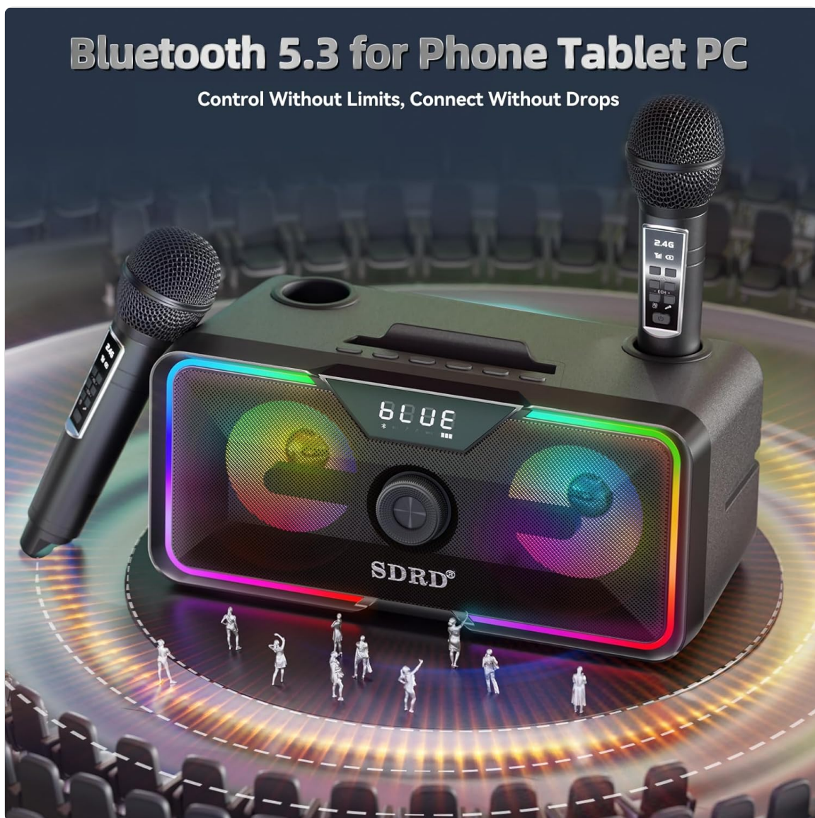
Image: The karaoke machine with a smartphone, illustrating its Bluetooth 5.3 connectivity for phones, tablets, and PCs.