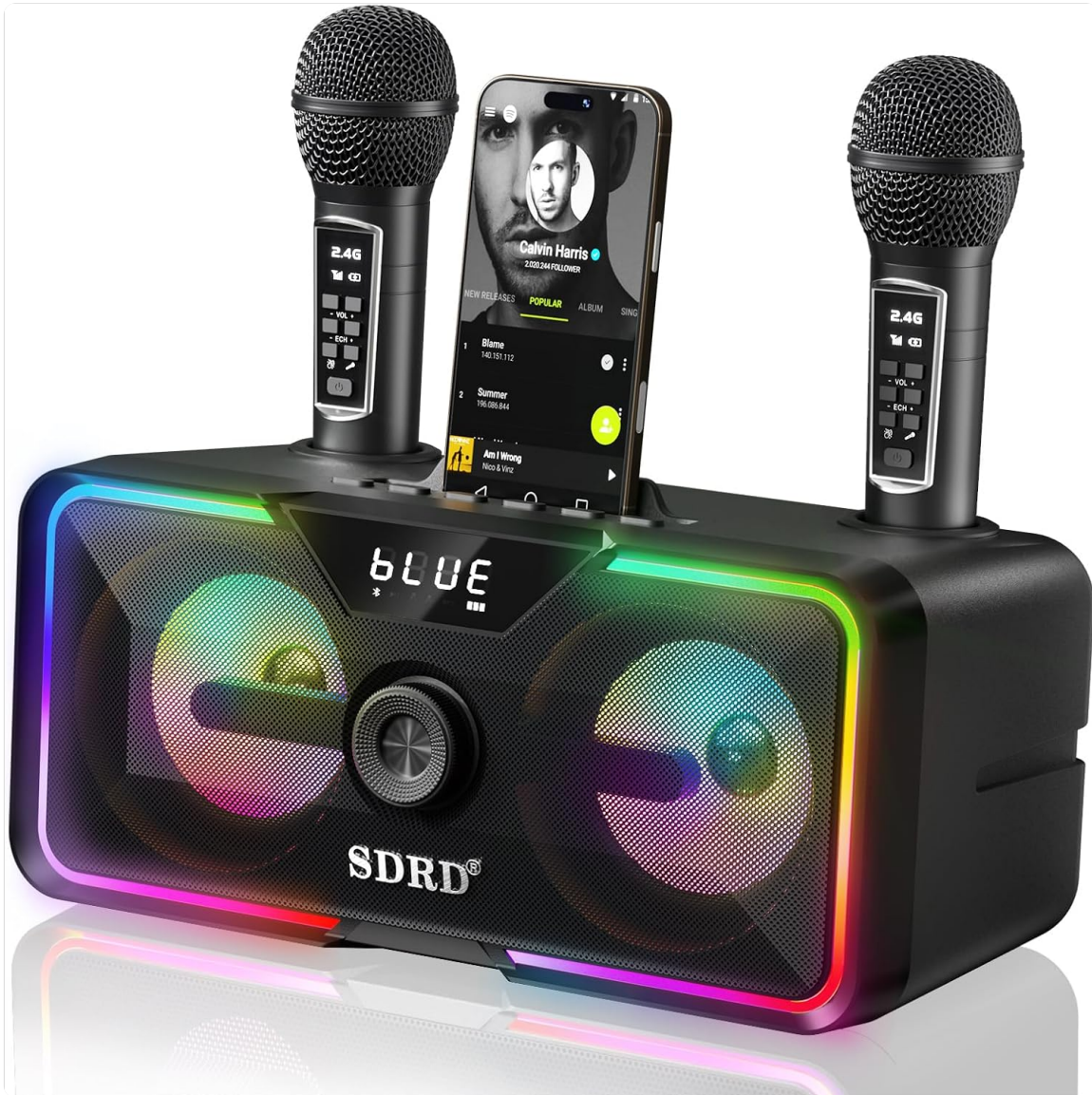
Image: The SDRD SD-215 Karaoke Machine, showcasing the main unit with its integrated phone holder and two wireless microphones docked in their charging slots.