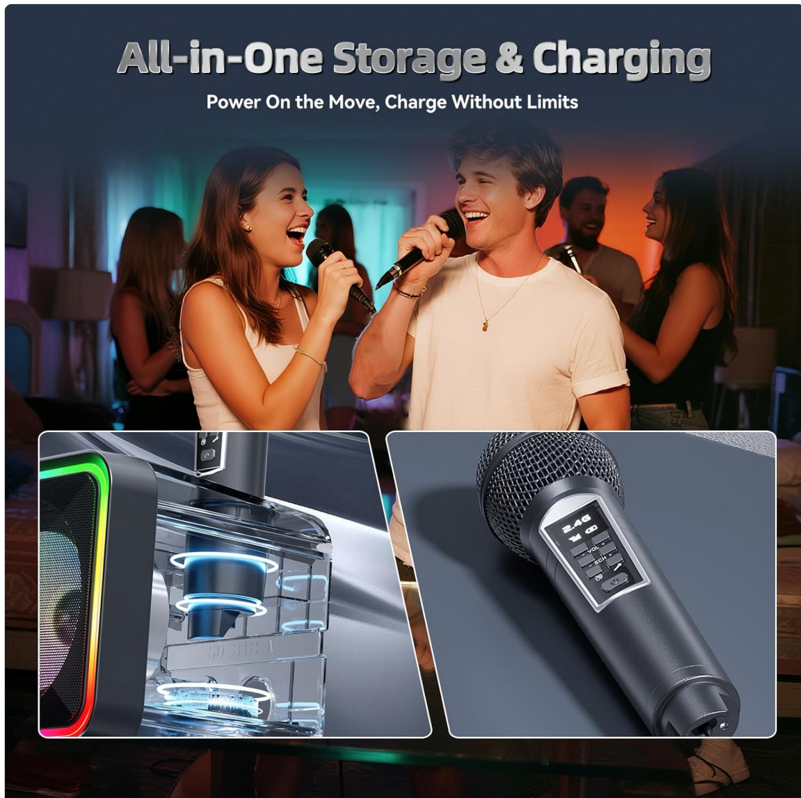
Image: The karaoke machine in use, highlighting its all-in-one storage and charging capabilities for the microphones.