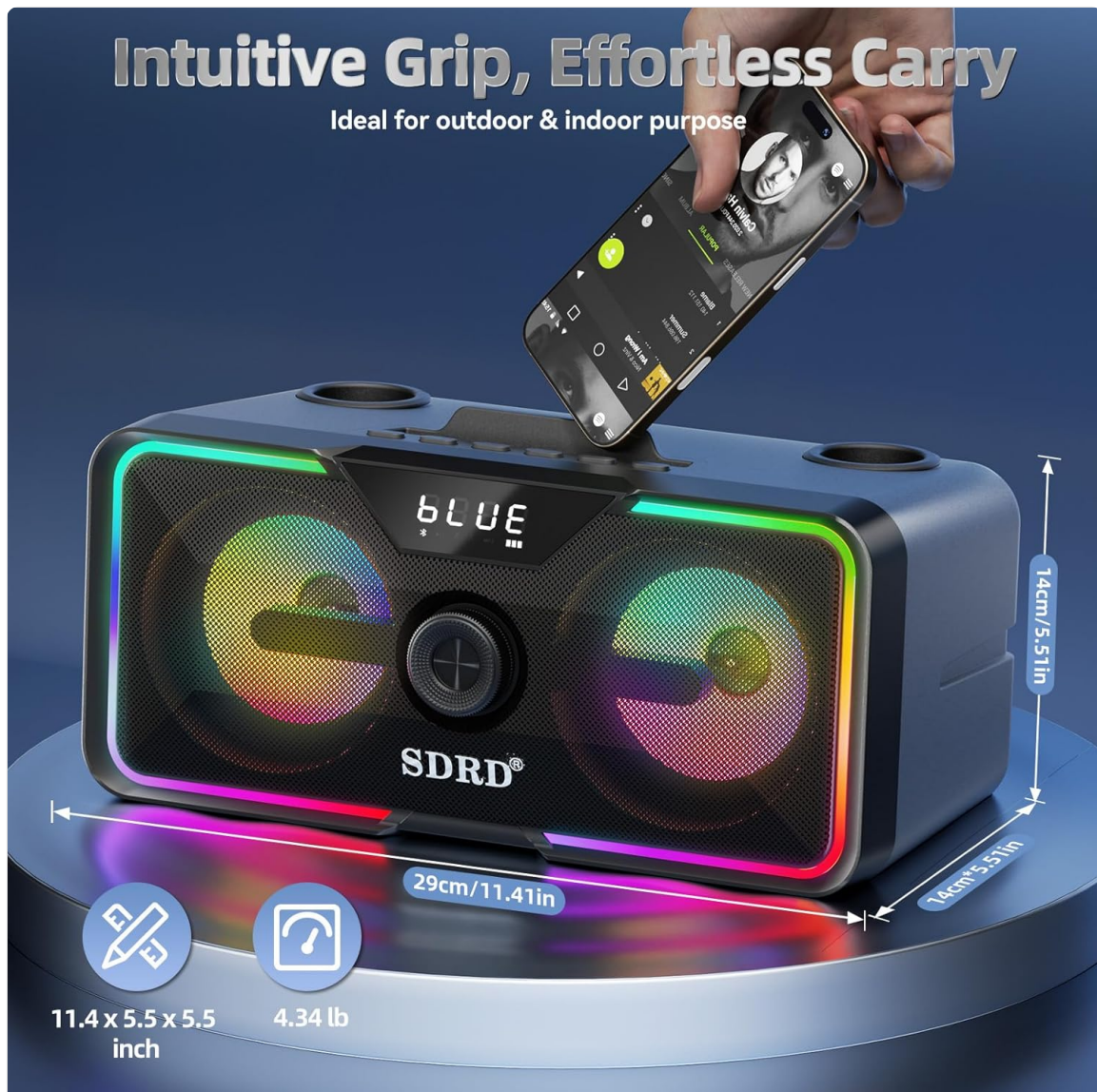
Image: A detailed diagram of the karaoke machine's top panel, illustrating the integrated command interface with