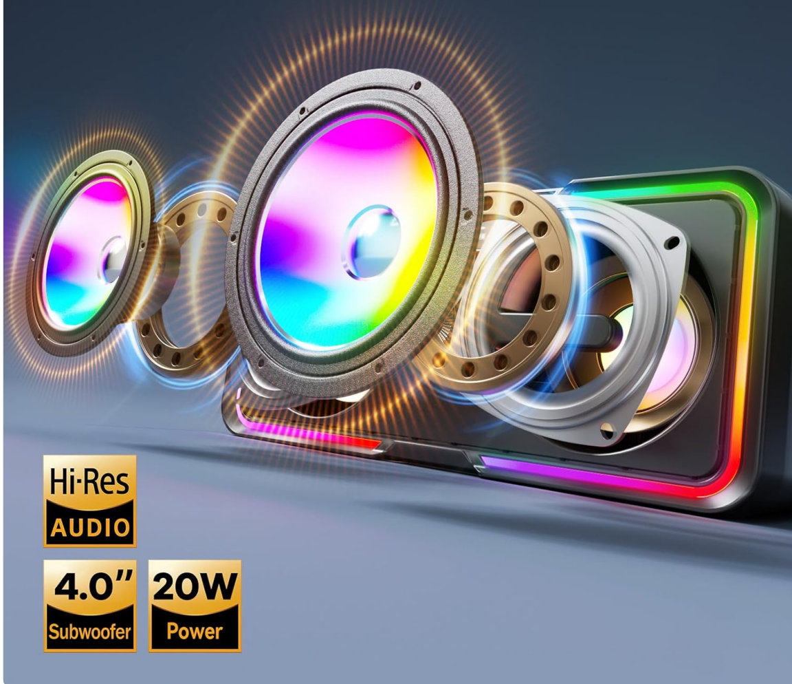
Image: A detailed view of the karaoke machine's front, illustrating the dual dynamic LED zones that provide customizable lighting effects.