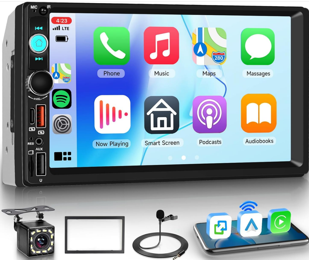
Image: Front view of the Driauto Double Din Car Stereo displaying the Apple CarPlay interface, along with a backup camera, external microphone, and smartphone icons representing connectivity features.