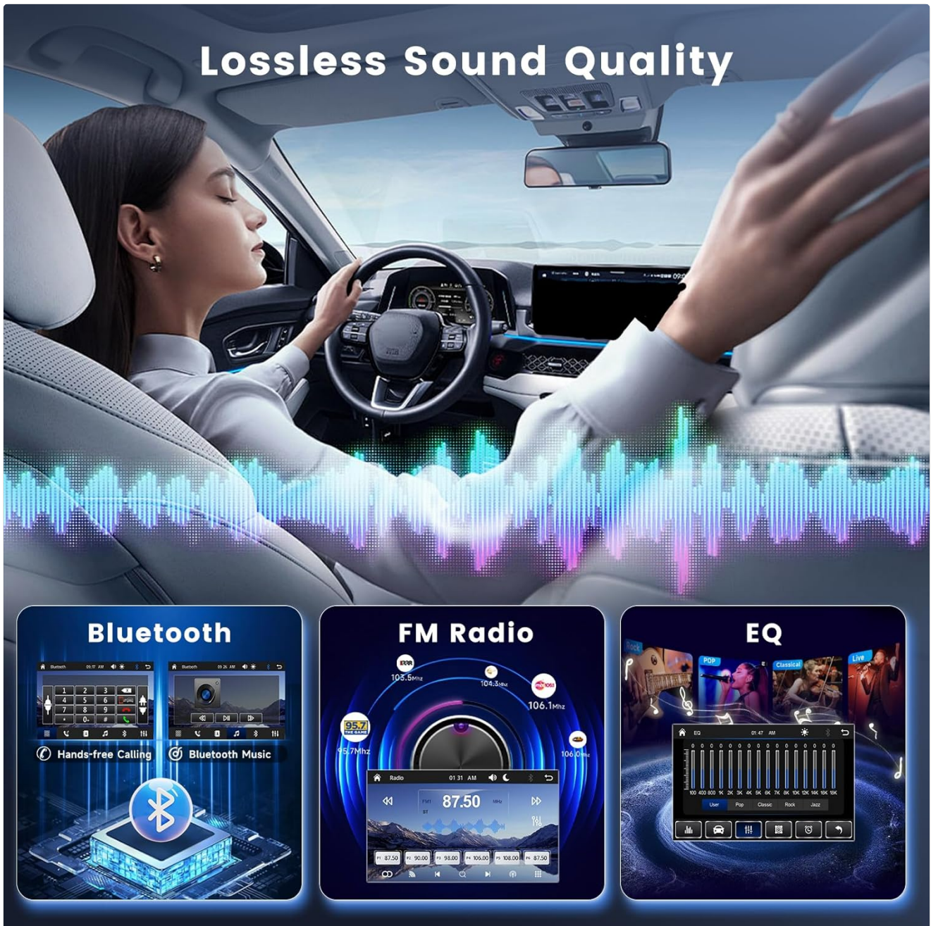
Image: Displays the features of lossless sound quality, Bluetooth for hands-free calling and music, FM radio interface, and a graphic equalizer (EQ) for audio customization.