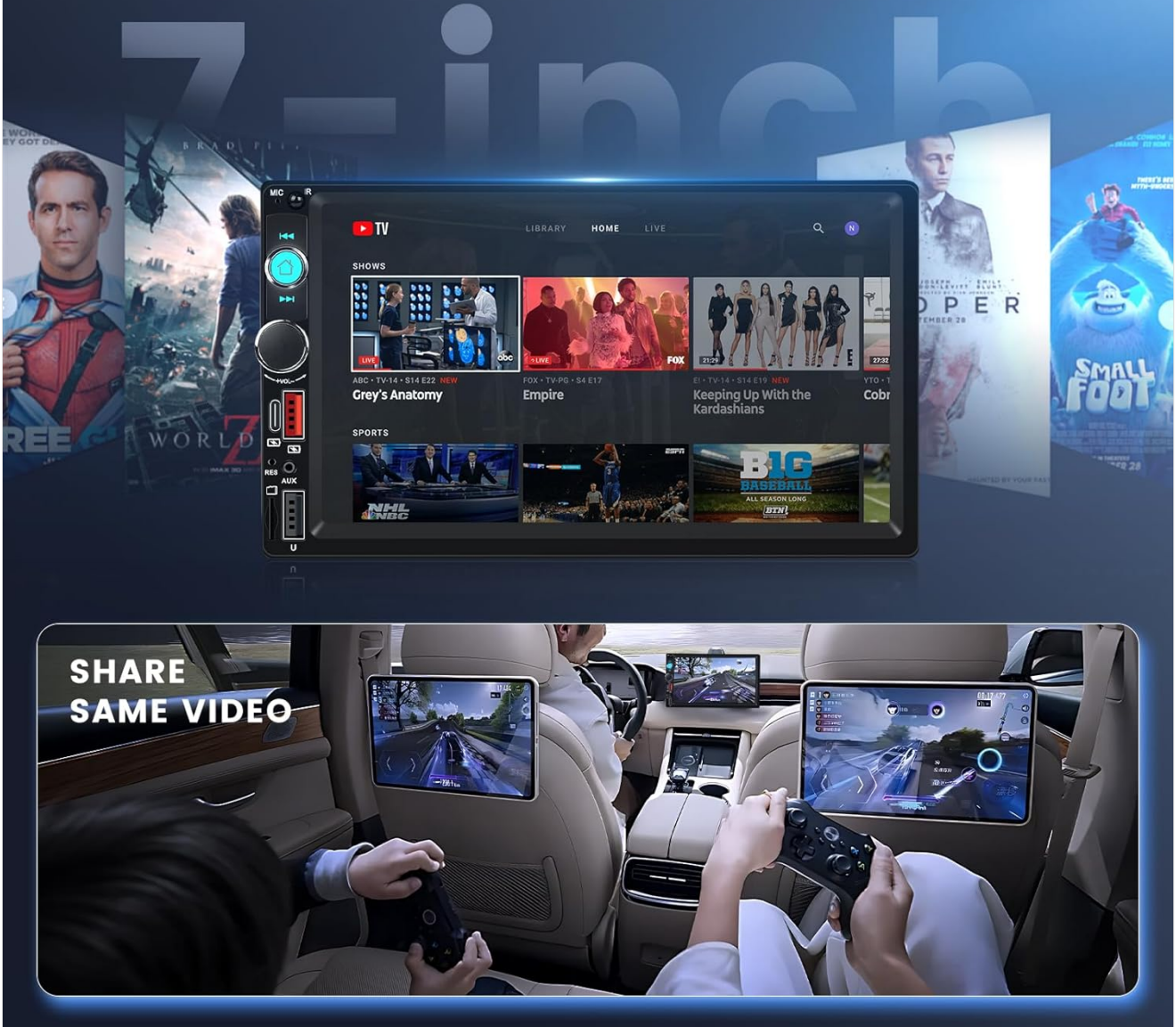
Image: Shows the 7-inch screen displaying YouTube content and an illustration of video being shared to rear headrest screens for passenger entertainment.