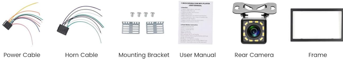
Image: A visual representation of the package contents, including the 7-inch stereo unit, power and horn cables, mounting brackets, user manual, rear camera, and frame. A detailed wiring diagram is also shown.