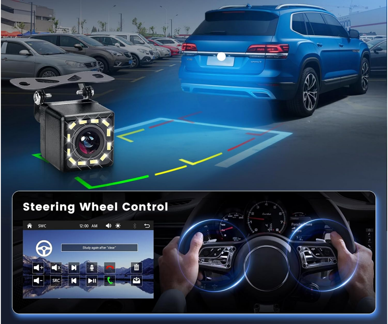
Image: Depicts the backup camera providing a clear view with parking assist lines, and a separate inset showing the steering wheel control interface on the stereo screen.