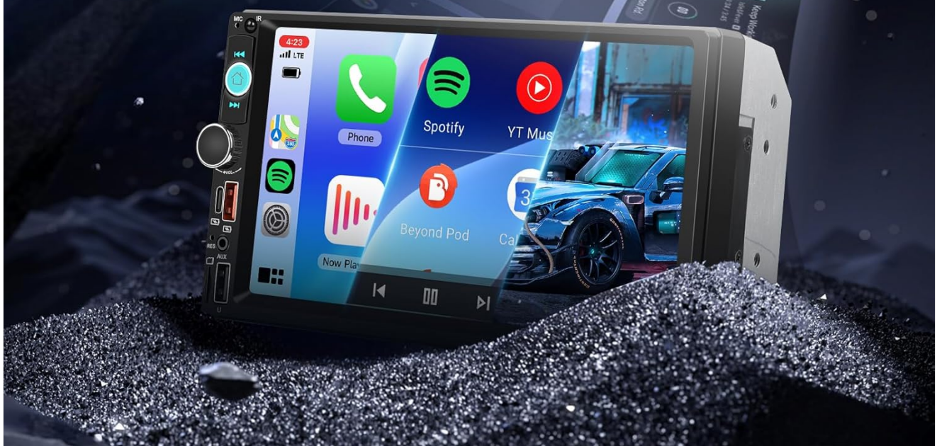
Image: Illustrates the wireless connectivity features including CarPlay, Android Auto, and MirrorLink, showing how a smartphone's interface is mirrored on the car stereo screen.