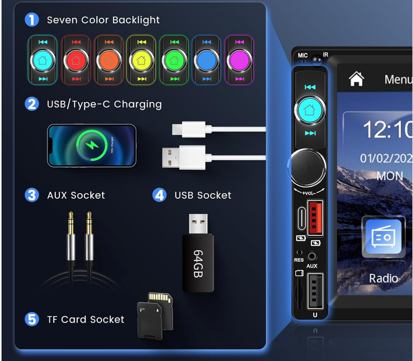
Image: Close-up view of the car stereo's front panel, highlighting the various multimedia input options including USB, Type-C charging, AUX socket, USB socket, and TF card slot. It also shows the seven-color backlight options.