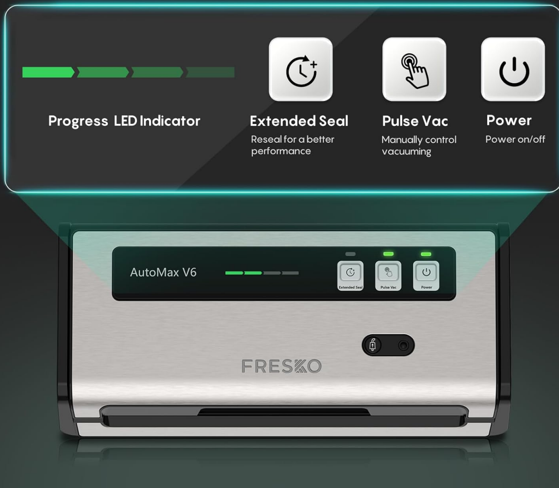
Image 1: Top view of the FRESKO V6 control panel, highlighting the Progress LED Indicator, Extended Seal, Pulse Vac, and Power buttons.