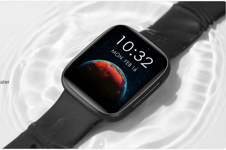
Image: The smartwatch submerged in water, illustrating its 3ATM waterproof rating for various water-related activities.

Can work at depths of up to 3 metres underwater 10,000+ Water Pressure Cycles