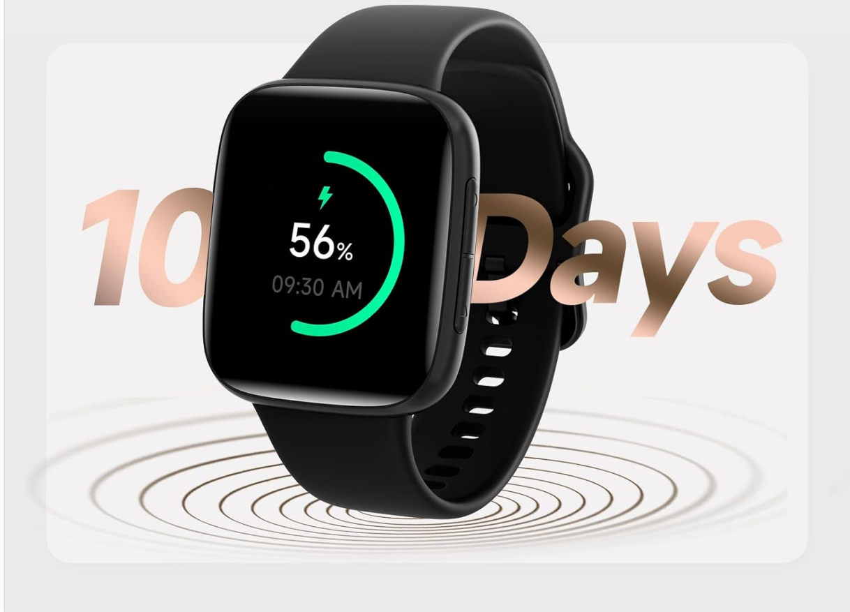
Image: The smartwatch displaying its battery life, indicating it is powered on and ready for use.