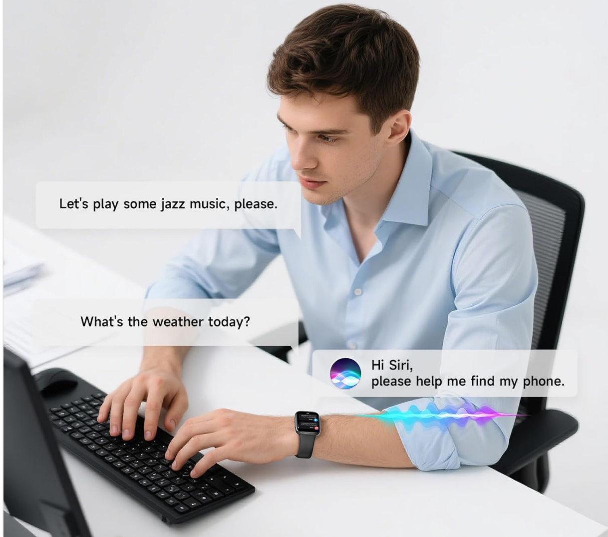
Image: The smartwatch's AI Voice Assistant feature, demonstrating voice command capabilities for various functions.