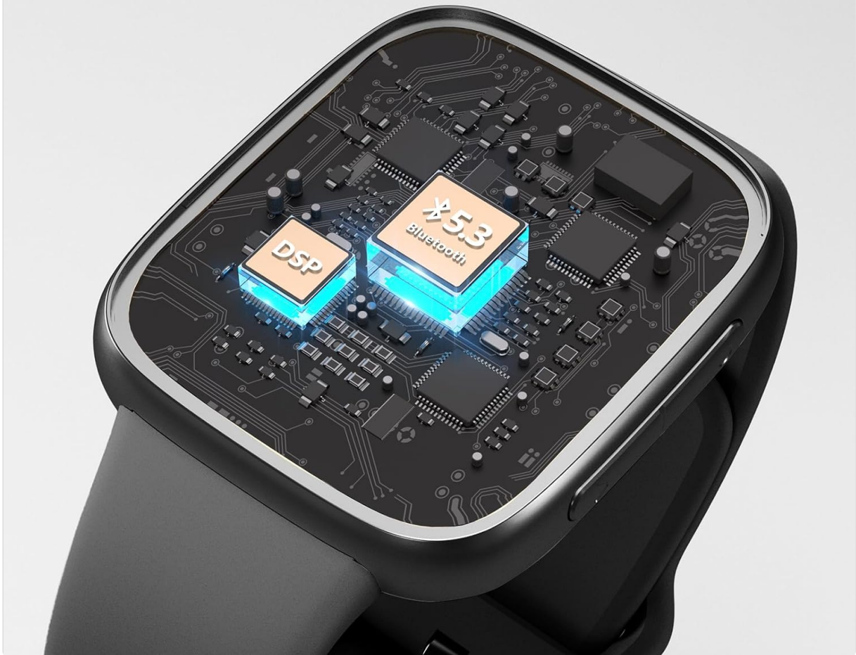
Image: An internal view of the smartwatch's advanced Bluetooth 5.3 and DSP chip, enabling stable and fast data transfer.

Powered by Advanced DSP Chip, Bluetooth 5.3 DualSync Tech, Crystal-Clear Audio, Ultra-Low Latency, 30% Faster Data Transfer | 2x More Stable