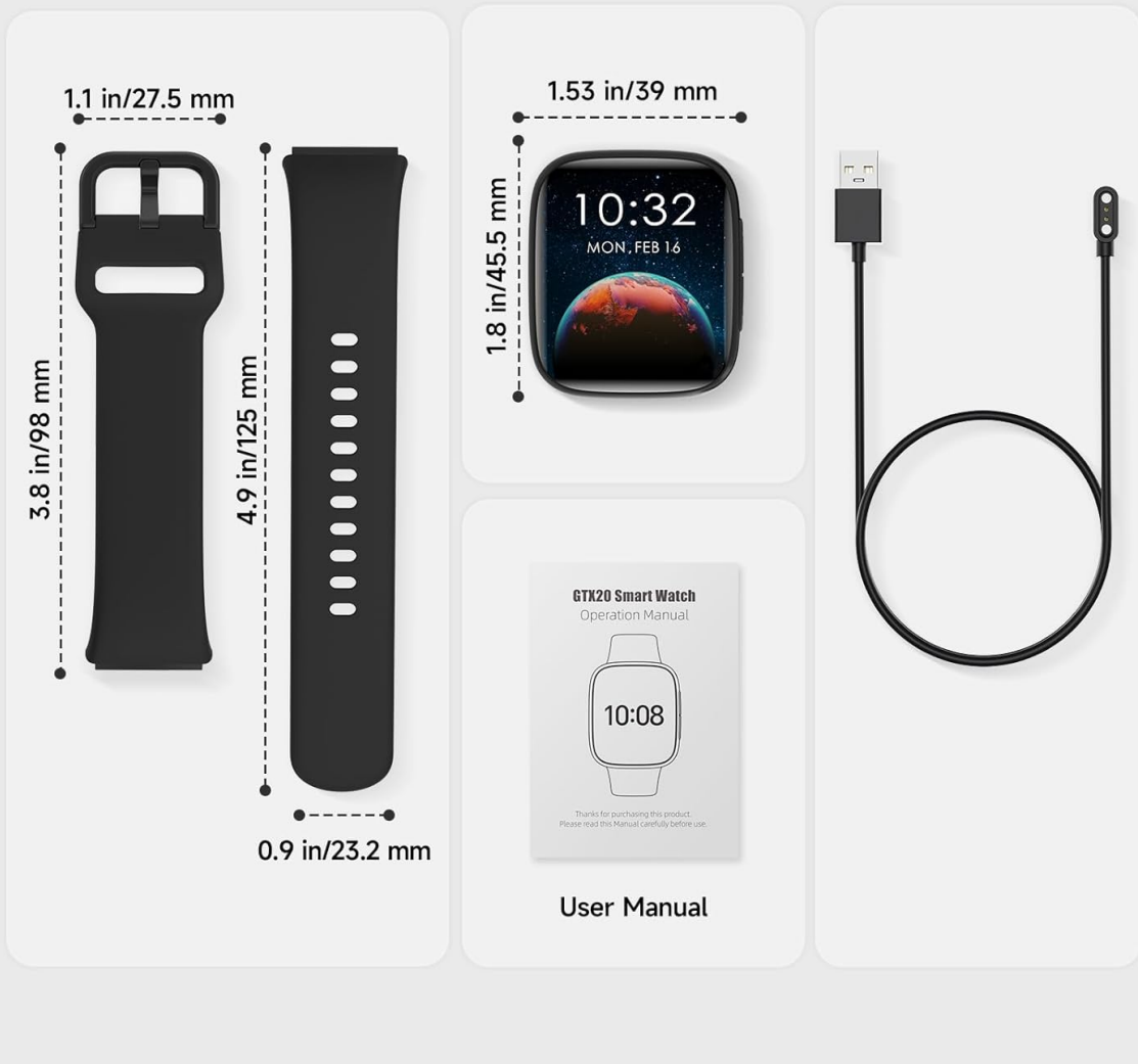
Image: Components included in the ENOMIR Smart Watch GTX20 packaging.