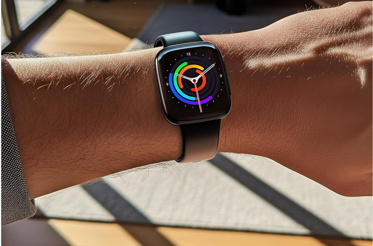
Image: The smartwatch on a wrist, highlighting the wide viewing angle and vivid colors of its 2.5D Curved AMOLED screen.