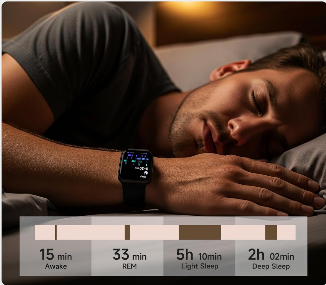
Image: The smartwatch tracking sleep, providing detailed insights into sleep stages for improved rest.