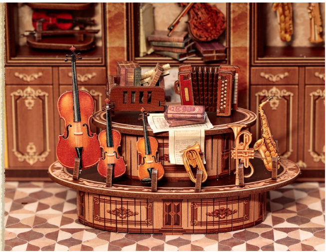
The 'Two-tier Visualiser' design, allowing for a comprehensive display of miniature instruments.