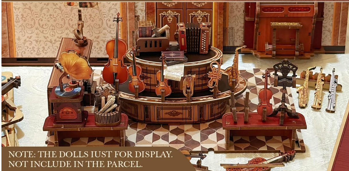
A view of the fully assembled Bach Strings Book Nook, showcasing its intricate details.