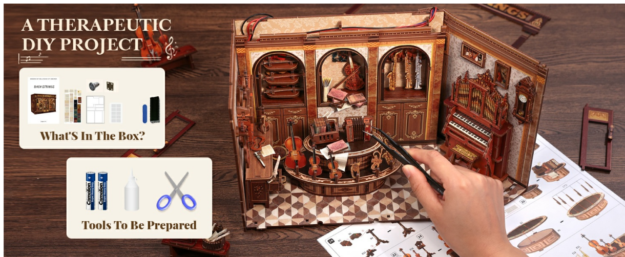
Image illustrating the main components included in the kit.