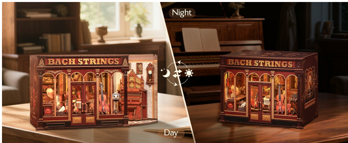
The intricate 'Arched Cabinets' providing display and storage for the miniature instruments.