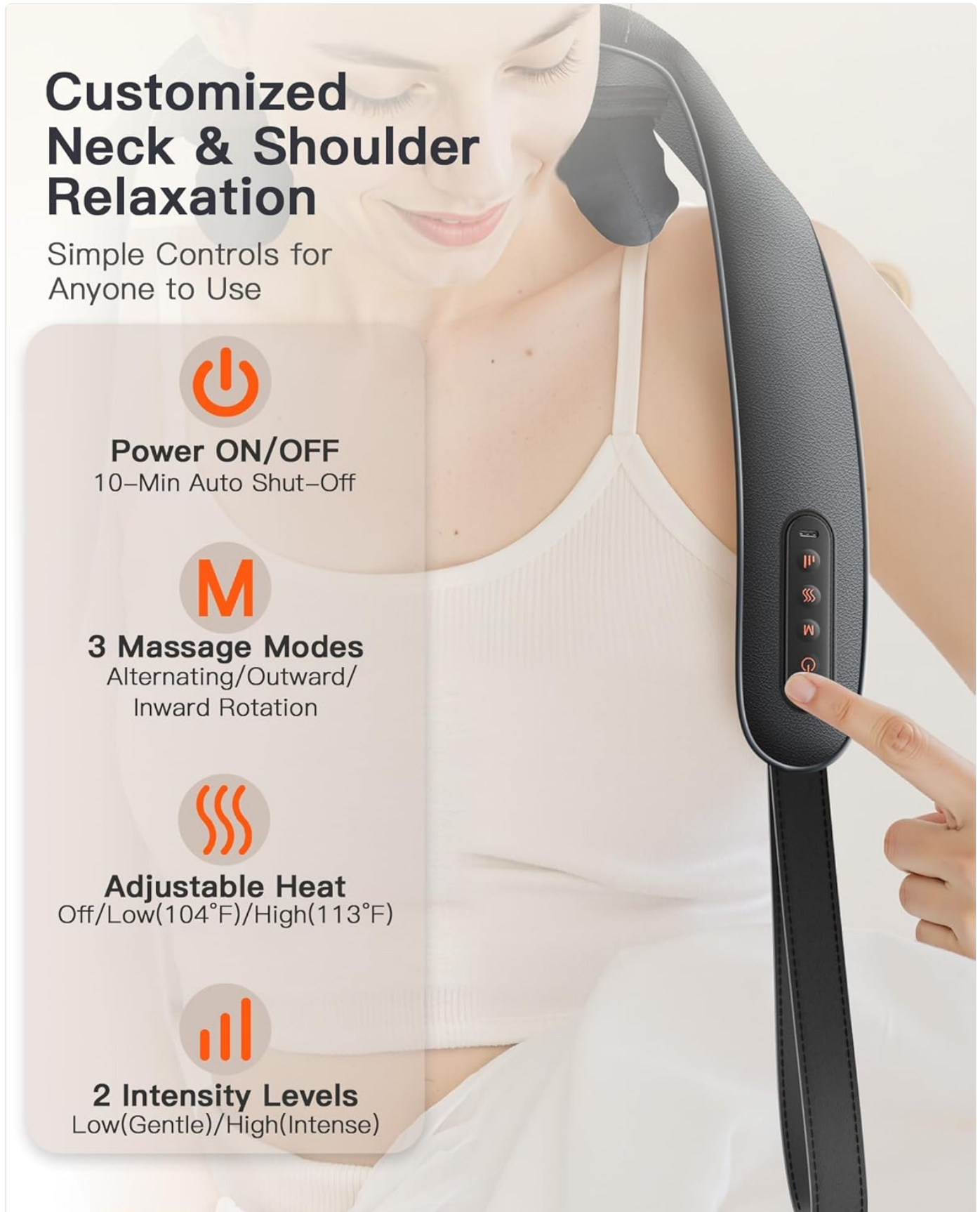
Figure 3: Close-up of the control panel showing the Power, Mode, Heat, and Intensity buttons. This image details the functions of each button for easy operation.

The control panel is located on one of the straps for easy access during use.