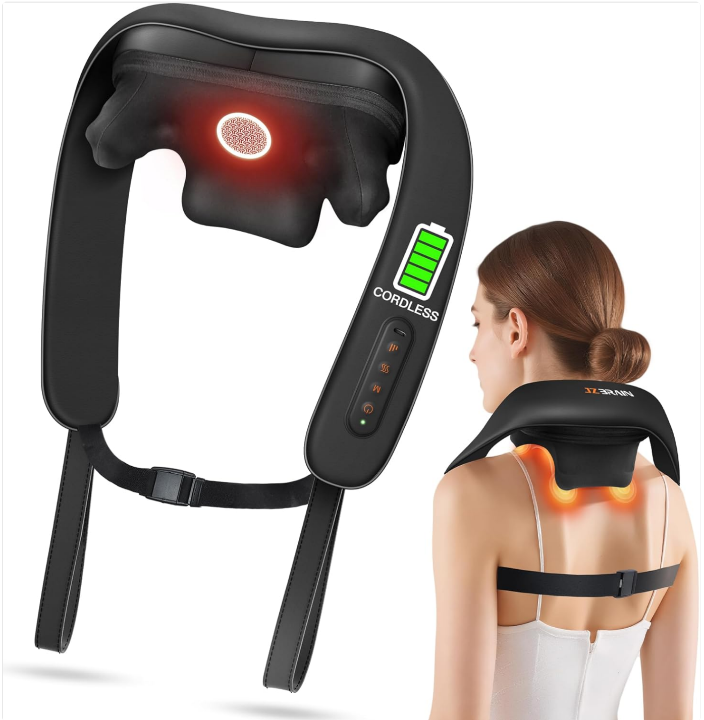
Figure 1: JZBRAIN Neck and Shoulder Massager. This image shows the massager in its full form, highlighting its ergonomic design and control panel.