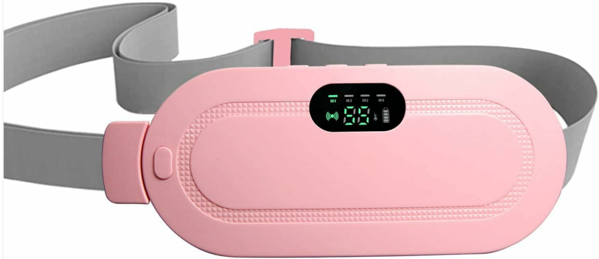
Figure 1: Vilicert Portable Electric Heating Belt in use, demonstrating its wearable design.