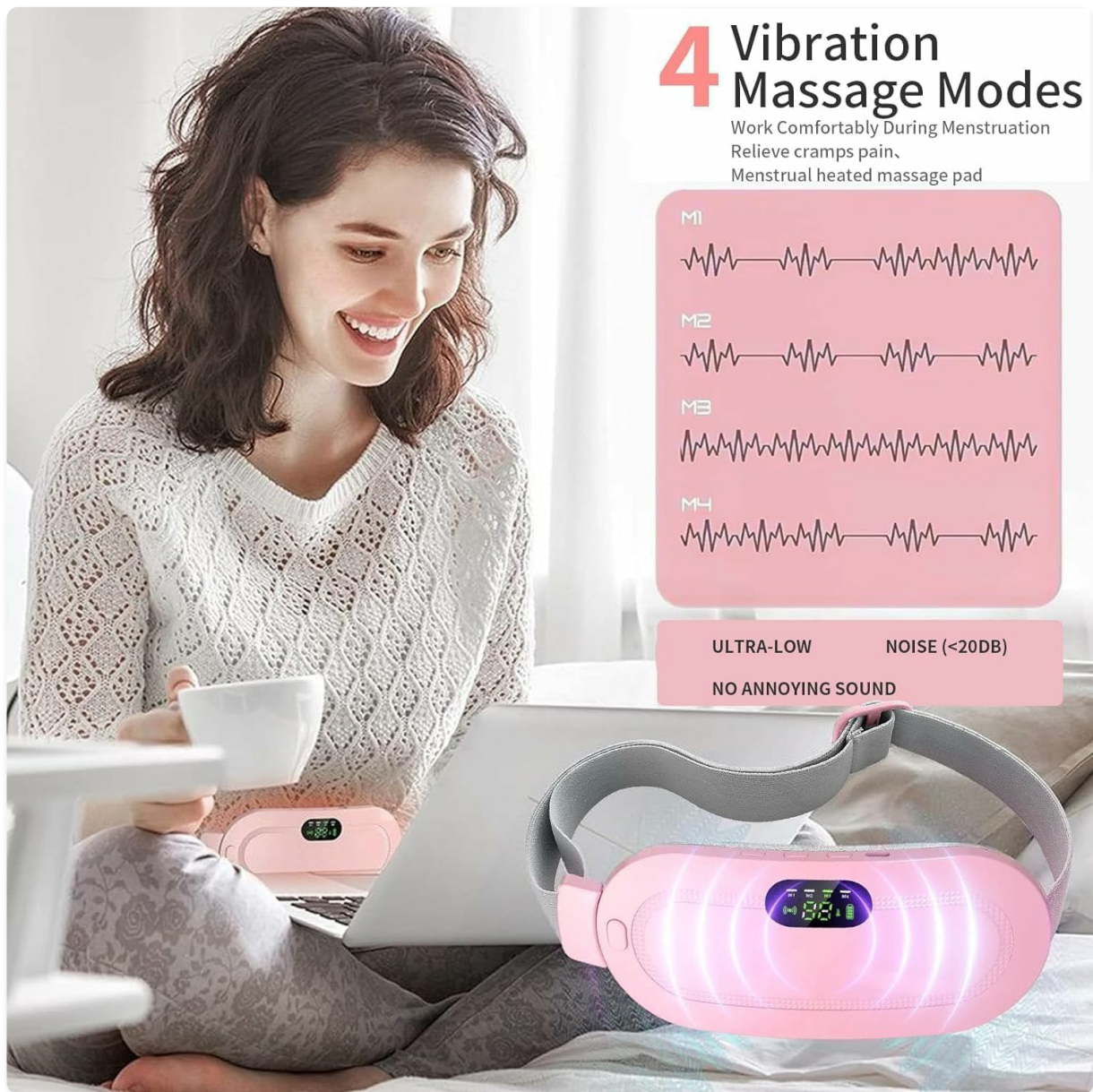
Figure 3: Visual representation of the four distinct vibration massage modes (M1, M2, M3, M4) available on the heating belt.