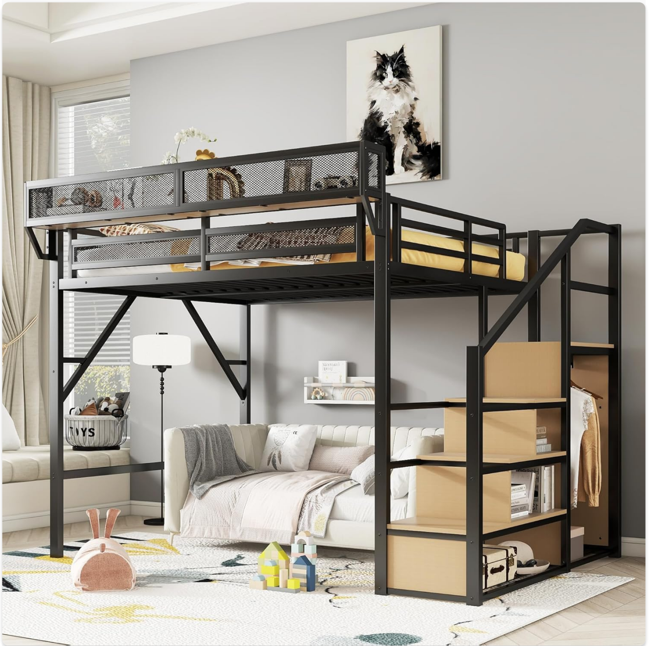
Image: The KEIKI Queen Size Metal Loft Bed Frame, showcasing its integrated staircase, storage shelves, and under-bed space, set up in a modern bedroom environment.