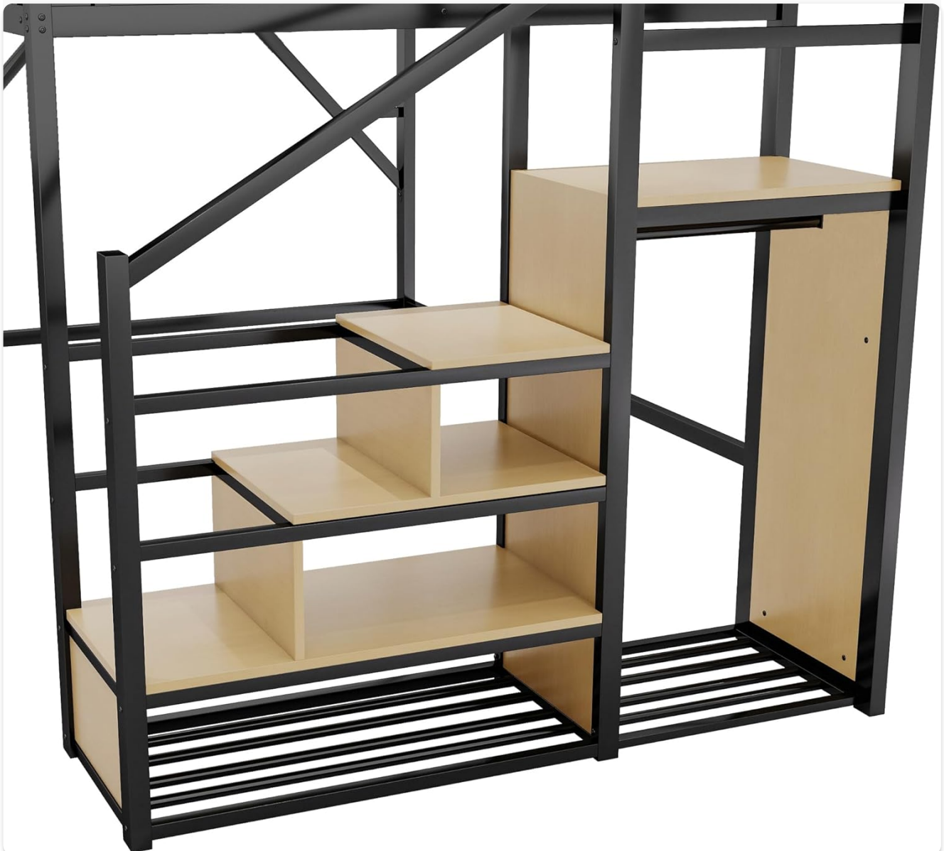
Image: A detailed view of the staircase of the KEIKI Loft Bed, highlighting the integrated storage shelves and the built-in wardrobe section.