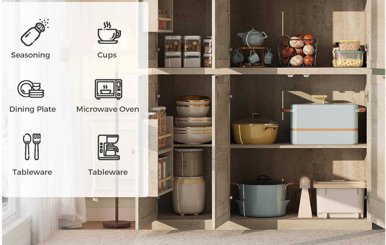
Figure 4: Comprehensive Organization. This image displays the interior of the cabinet, demonstrating how various items like seasoning, cups, dining plates, and small appliances can be neatly organized across the shelves and door-mounted racks.