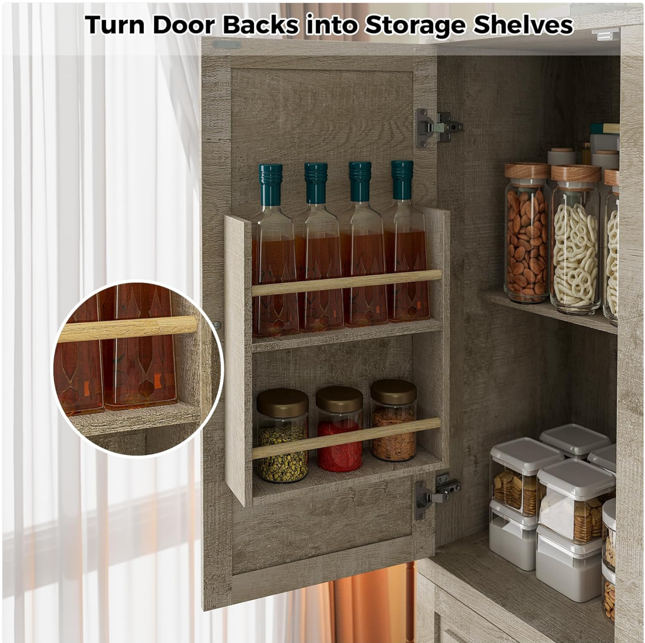
Figure 5: Door Back Storage. A detailed view of the door-mounted shelves, showcasing their utility for storing smaller items such as spice bottles, effectively utilizing the inner door space.