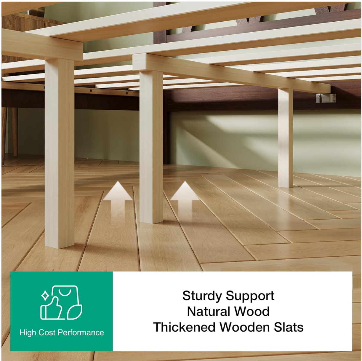
Image: Illustrates the 8.5-inch clearance under the bed frame, providing space for storage.