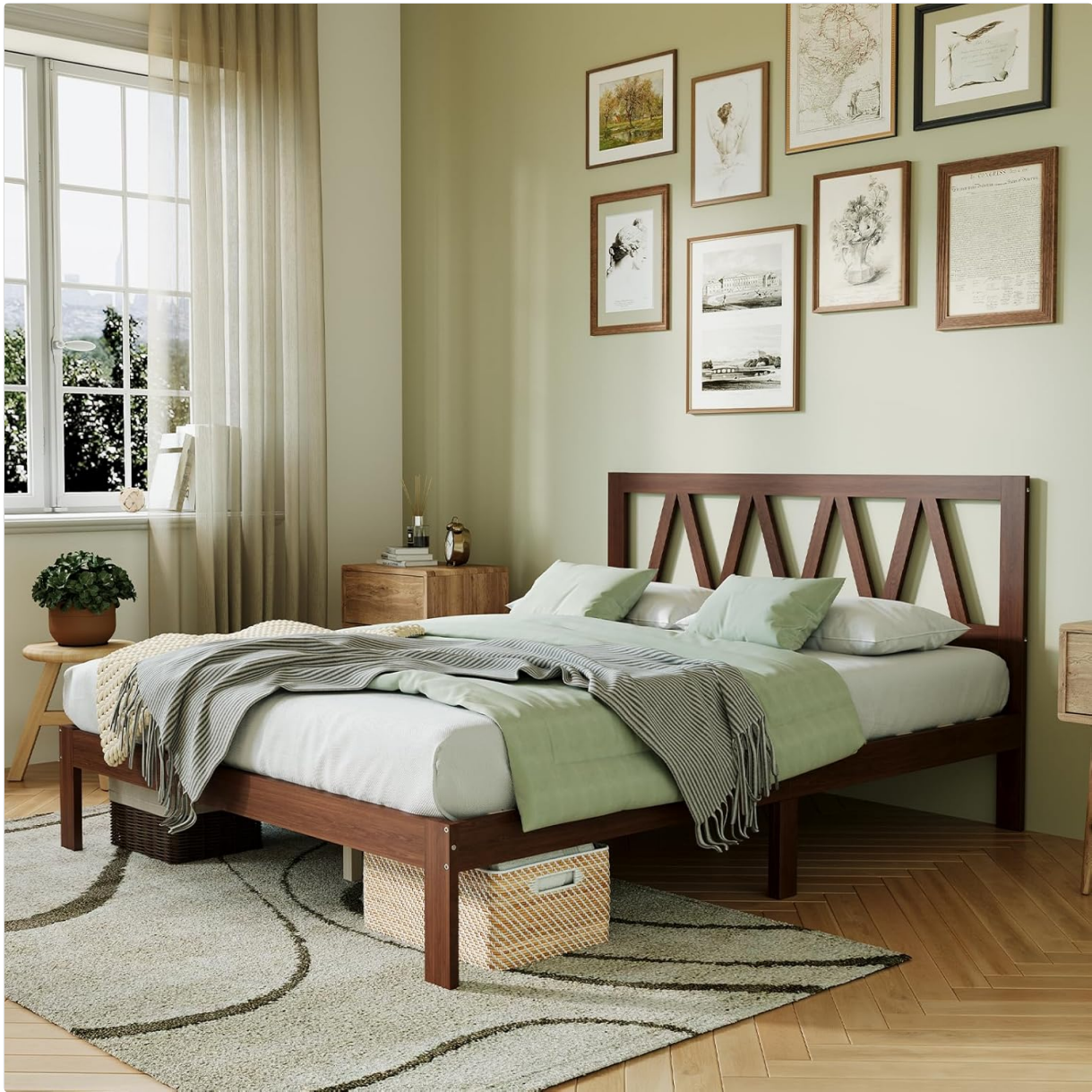
Image: The fully assembled Novilla Queen Bed Frame with Headboard, shown in a bedroom environment with a mattress and bedding.