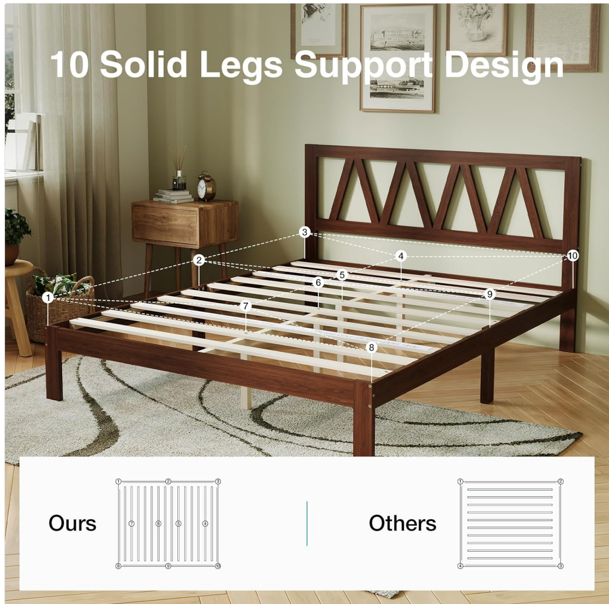
Image: Illustration of the bed frame's structure, highlighting the 10 solid support legs and the arrangement of the wooden slats.