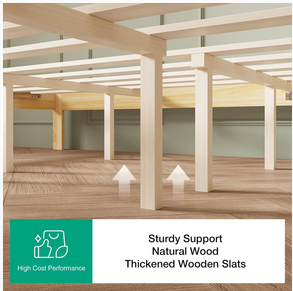
Image: View of the bed frame's underside, illustrating the sturdy support and thickened wooden slats.

Once all components are in place, fully tighten all bolts and screws. Ensure the frame is stable and level.