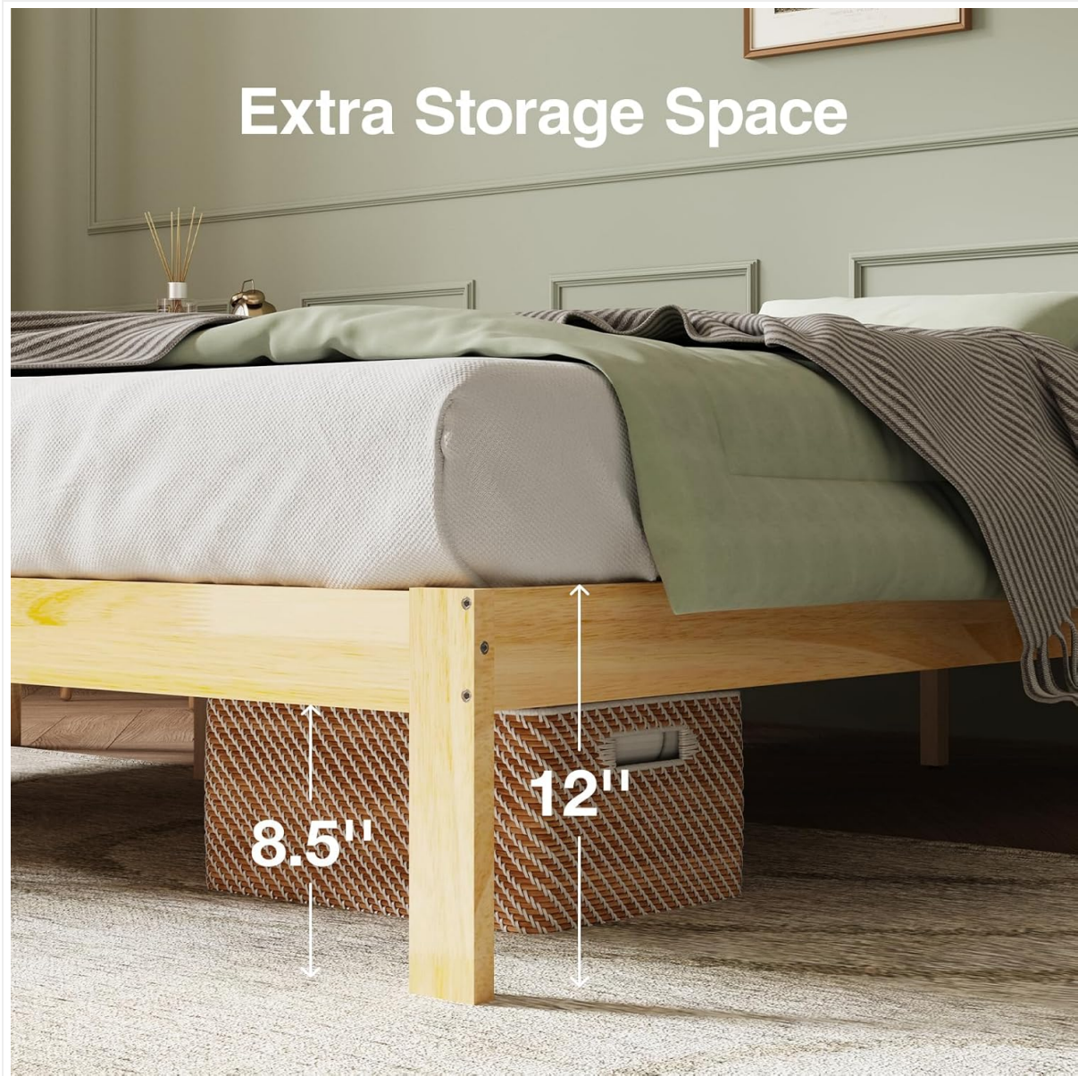
Image: Illustration of the 8.5-inch under-bed storage space, demonstrating its utility with a storage basket.

The frame provides approximately 8.5 inches of under-bed clearance, offering convenient space for storage. This feature helps keep your bedroom organized and allows for easier cleaning underneath the bed.