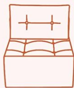
Module B X1