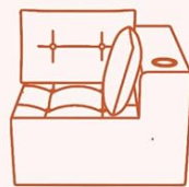
Module C X1