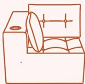
Module A X1