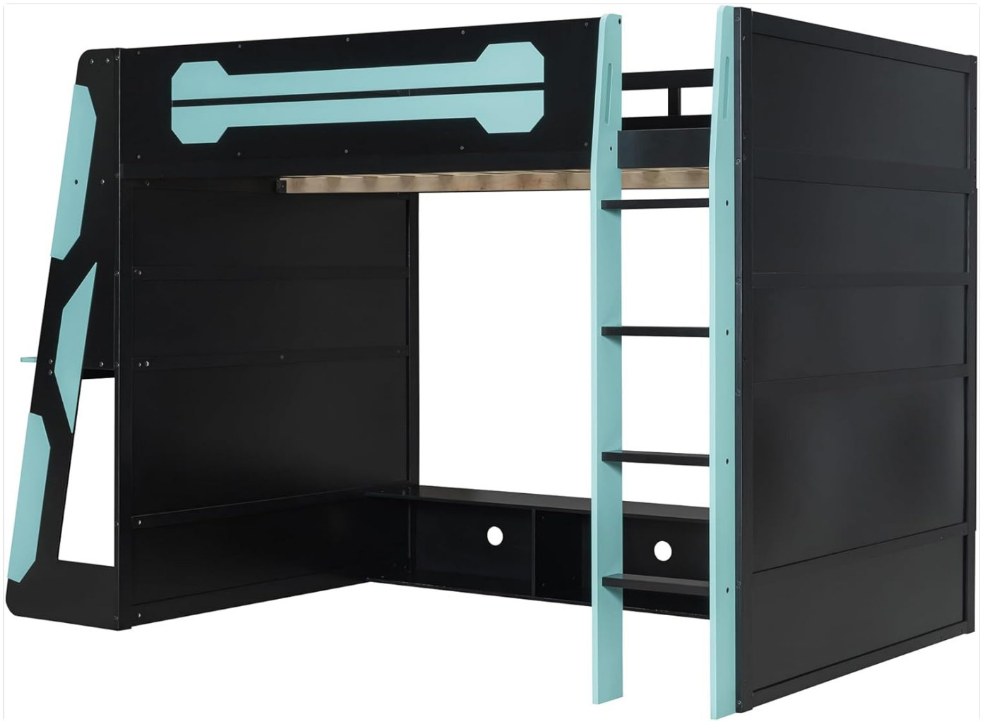
Image: Side view illustrating the structural components of the loft bed.