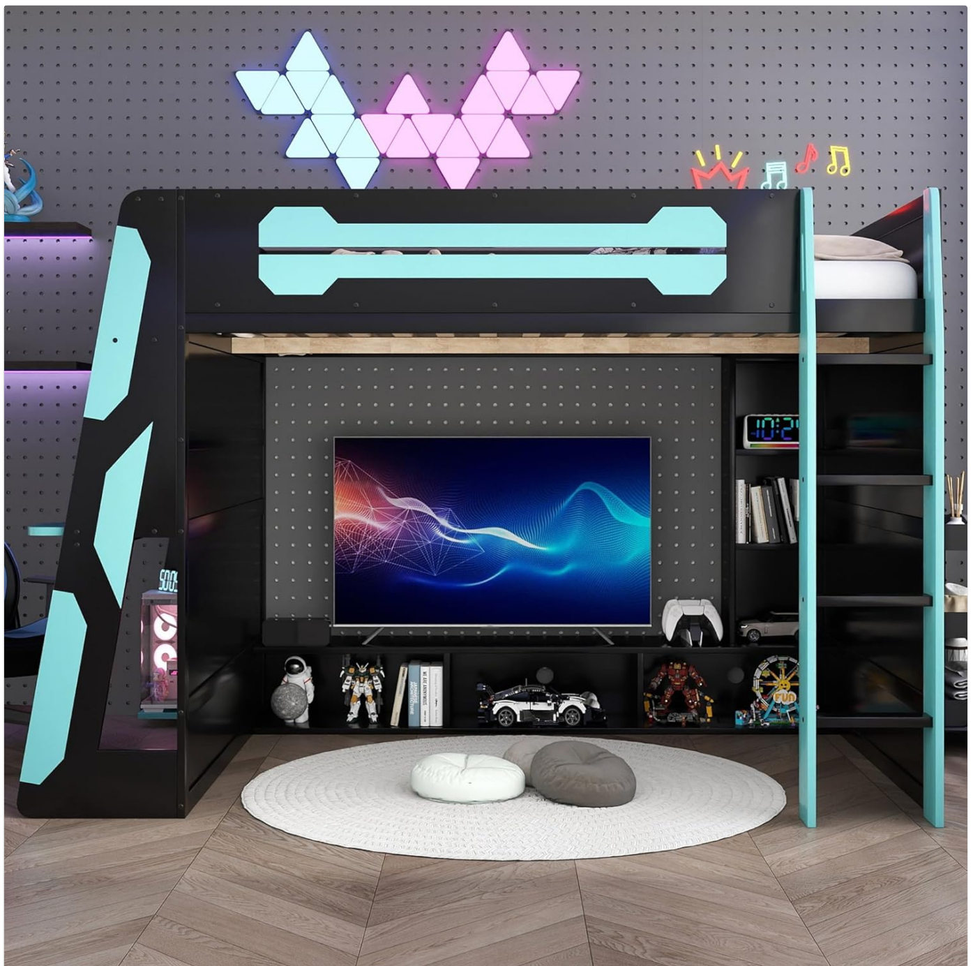
Image: The underbed area of the loft bed, set up with a television and console storage for entertainment.