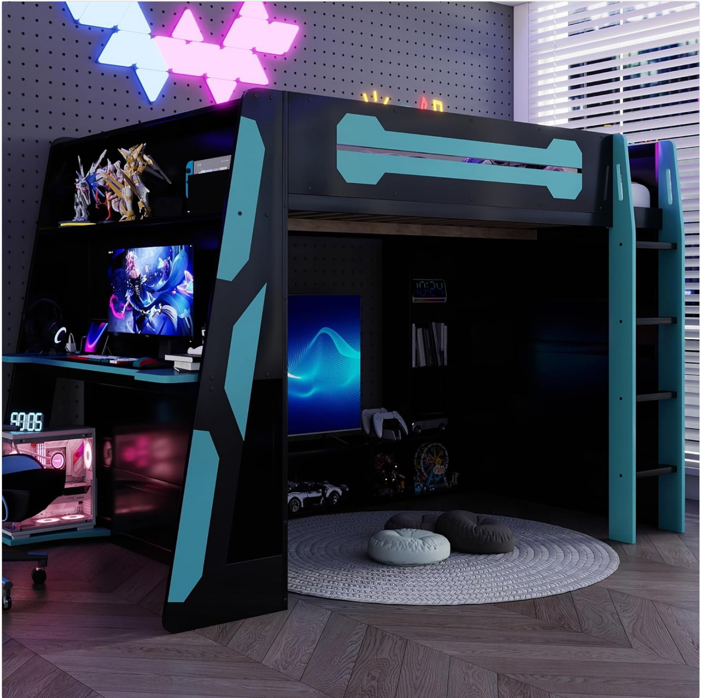
Image: The loft bed configured with a gaming PC setup on the desk and decorative items on shelves.

underbed entertainment area, and overall design.