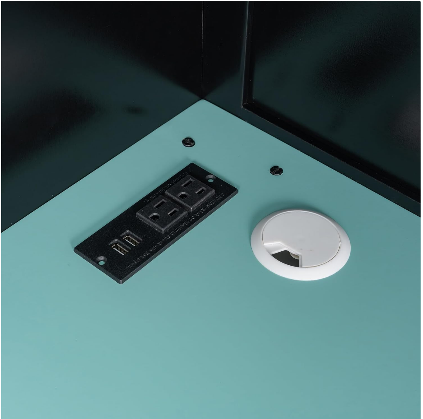
Image: Detail of the charging station with AC outlets and USB ports, alongside a cable management grommet.