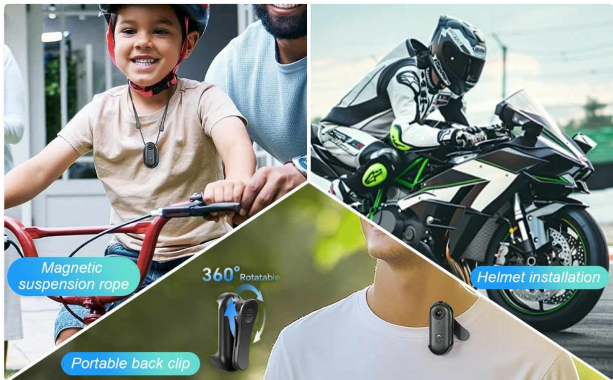
Figure 3.2: Diverse mounting solutions for the Queather POV Pro 4K camera.