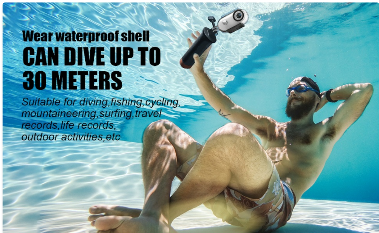
Figure 3.3: The Queather POV Pro 4K camera in its waterproof case, suitable for diving up to 30 meters.