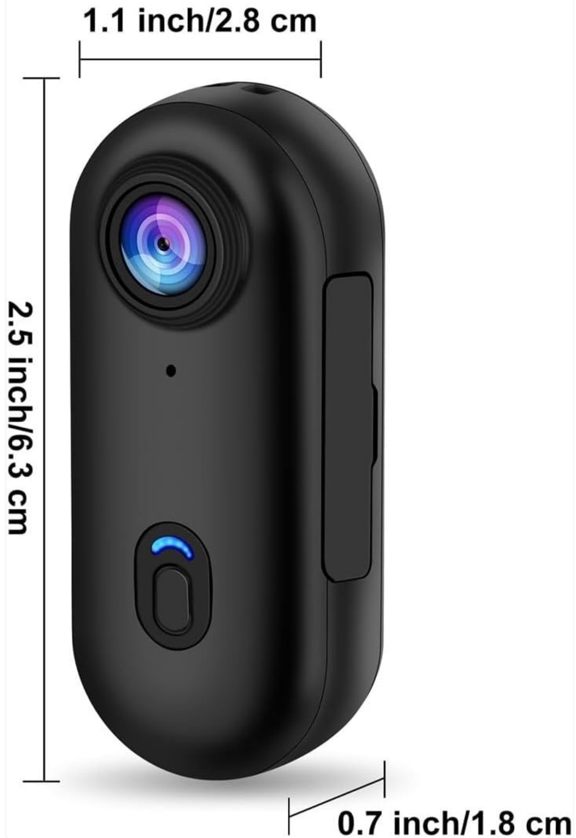
Figure 7.1: Product dimensions of the Queather POV Pro 4K camera.