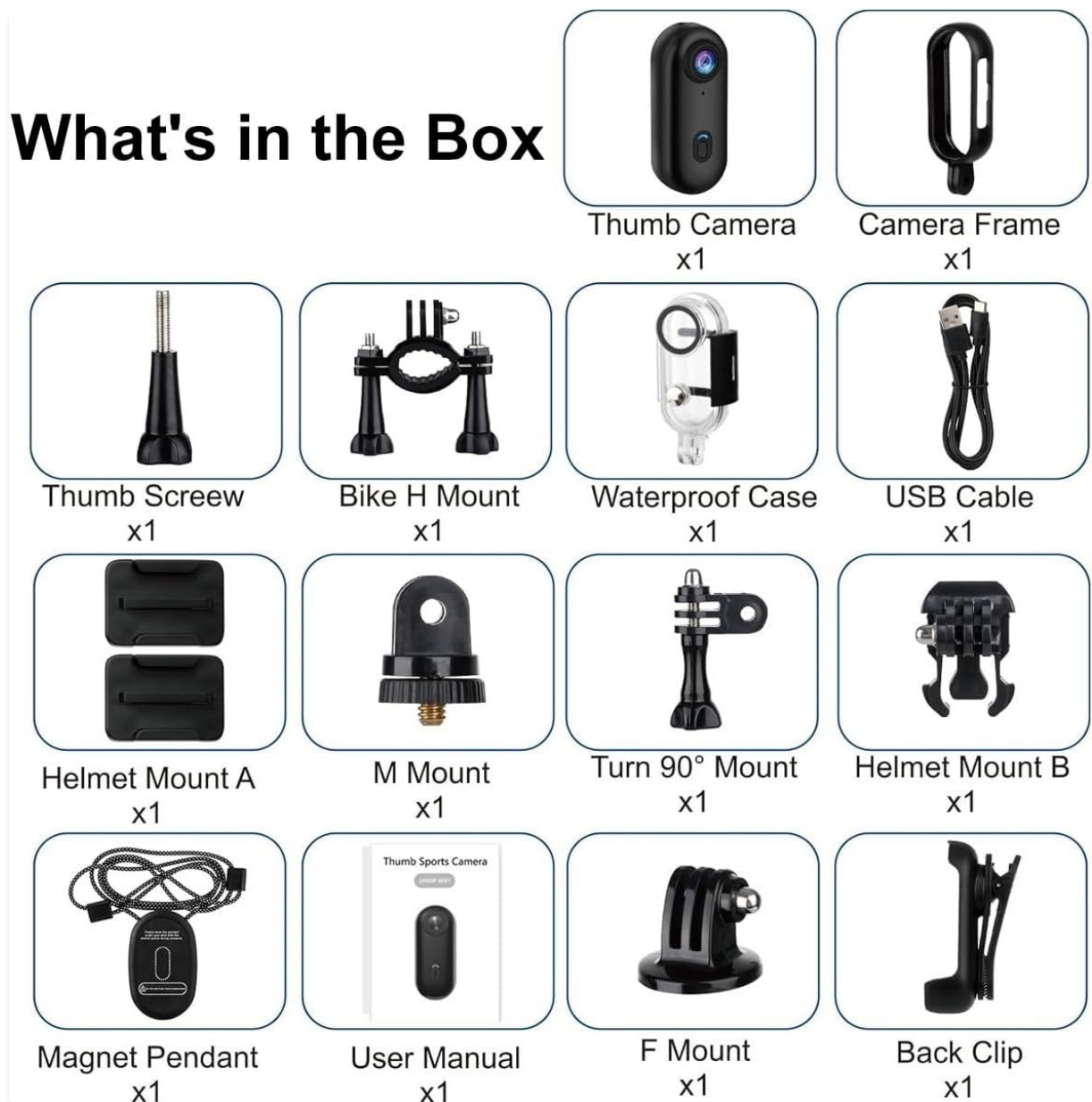
Figure 2.1: The Queather POV Pro 4K camera and its complete set of accessories.