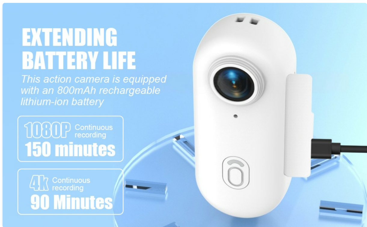
Figure 3.1: Charging the Queather POV Pro 4K camera and its battery performance.

A full charge provides approximately 150 minutes of continuous recording at 1080p or 90 minutes at 4K resolution.