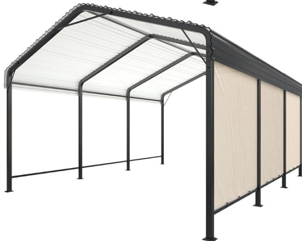
Image: A visual comparison showing the carport's appearance both with and without its removable fabric polyester sidewalls, highlighting the flexibility of its design.

Ball Bungee Cords Reinforced design and easy installation