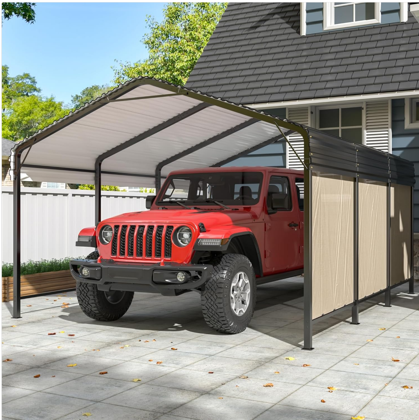
Image: The VIWAT 10' x 15' Metal Carport providing shelter for a red Jeep. This image illustrates the overall appearance and primary function of the carport.