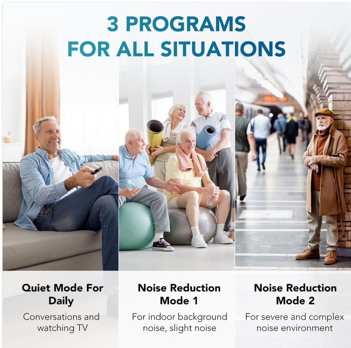
Image: Overview of the three hearing programs.