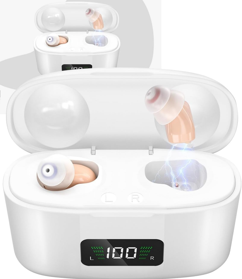
Image: Wupee OTC Hearing Aids Model TY CN430S in charging case.