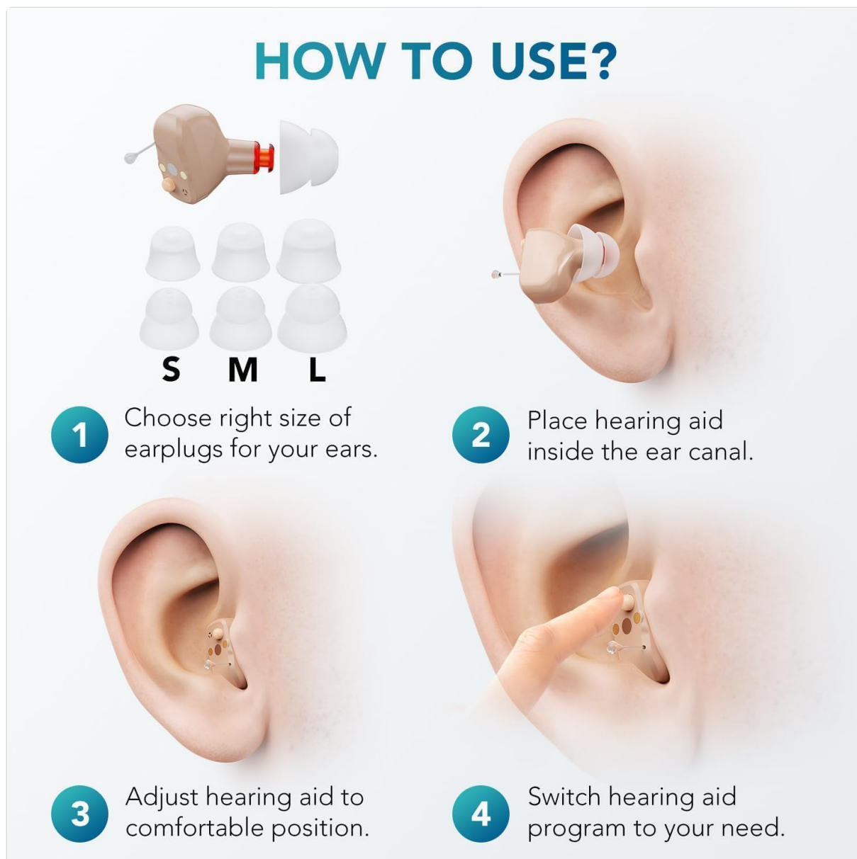
Image: Steps for selecting earplugs and inserting hearing aids.

3. Adjust the hearing aid to a comfortable and secure position.