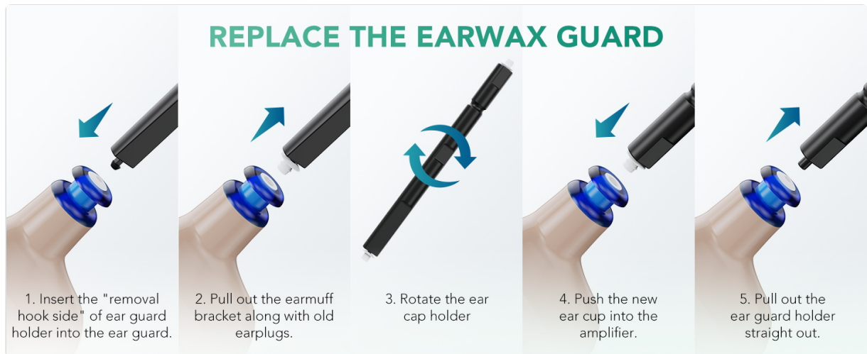
Image: Step-by-step guide for earwax guard replacement.