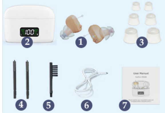
Image: All components included in the Wuvée hearing aid package.