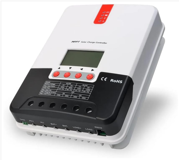
Figure 3.1: Angled view of the SRNE ML2420 MPPT Solar Charge Controller, showing the display and connection terminals.