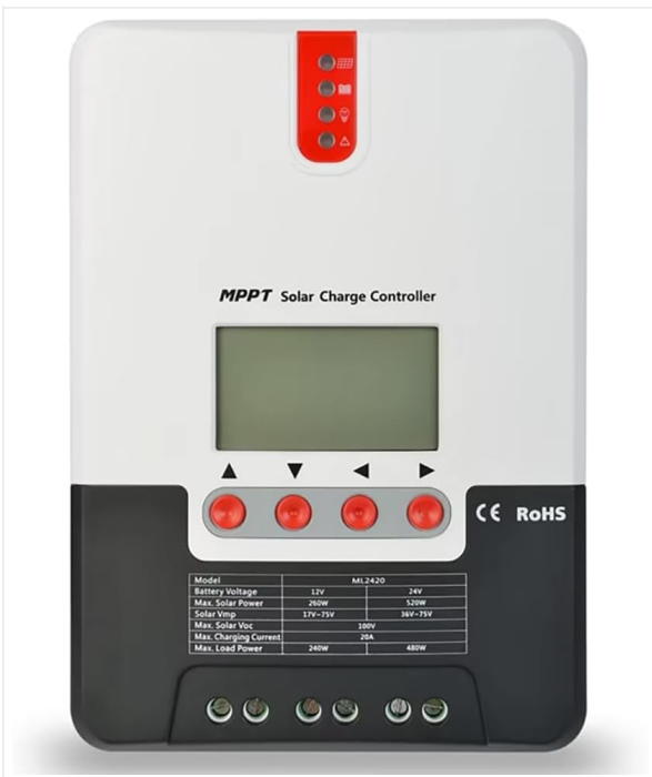
Figure 3.2: Front view of the controller, highlighting the LCD display and control buttons.