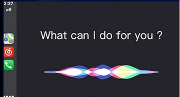
Siri Voice Control