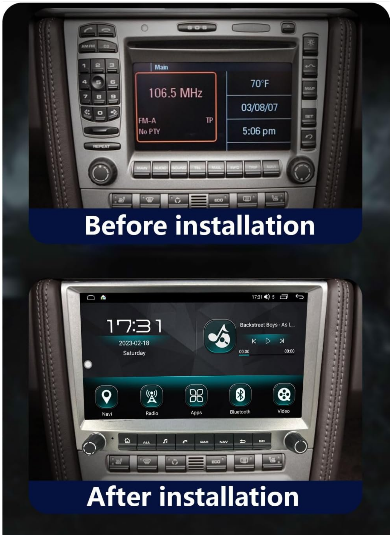
Figure 3.1: Visual comparison of the Porsche dashboard before and after the installation of the CHSTEK Android Car Radio, showcasing the integrated display.