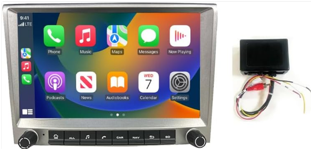
Figure 4.6: The main unit displaying the Apple CarPlay interface, which can also show parking sensor data and camera feeds when engaged.