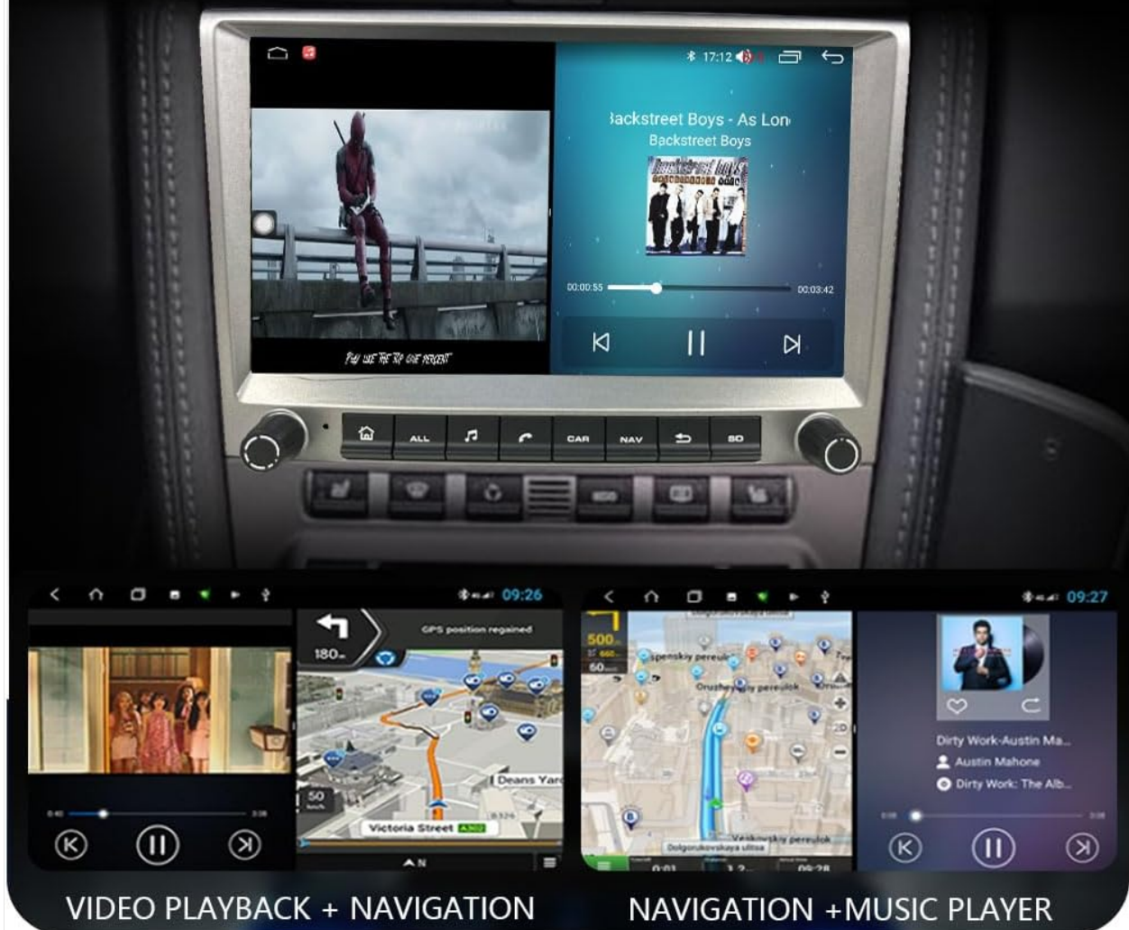
Figure 4.5: The split-screen feature in action, showing video playback on one side and GPS navigation on the other, or navigation with a music player.