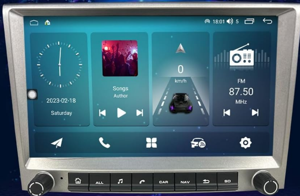
Figure 4.4: The car radio's Bluetooth interface, illustrating features for phone calls, address book access, and music playback.