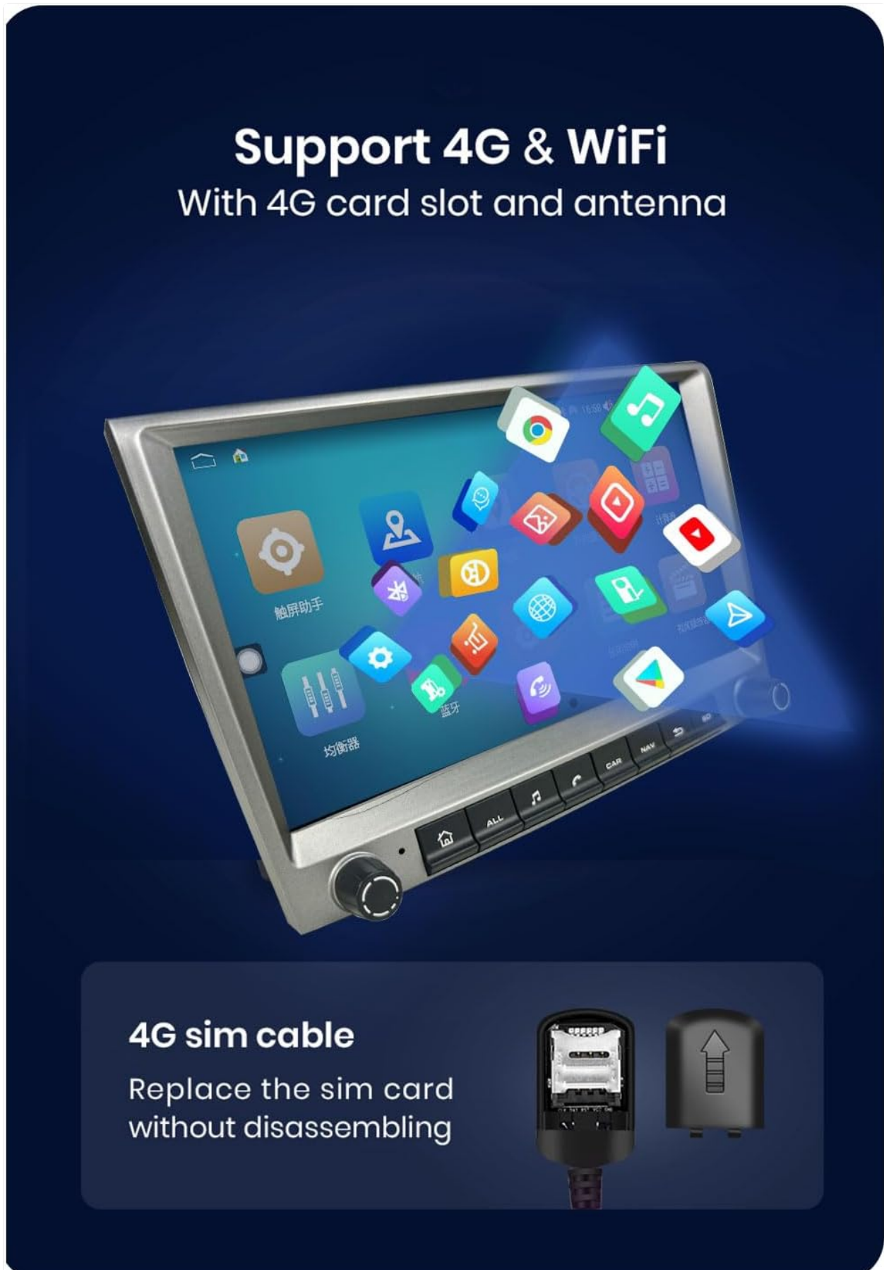
Figure 4.1: The Wireless CarPlay interface displayed on the car radio, showing common applications like Phone, Music, Maps,

Connect your iPhone wirelessly or Android device via a wired connection to access a simplified version of your phone's screen on the car radio. This allows for navigation, calls, messages, and music playback through the car's display. Voice control (Siri or Google Assistant) is supported.