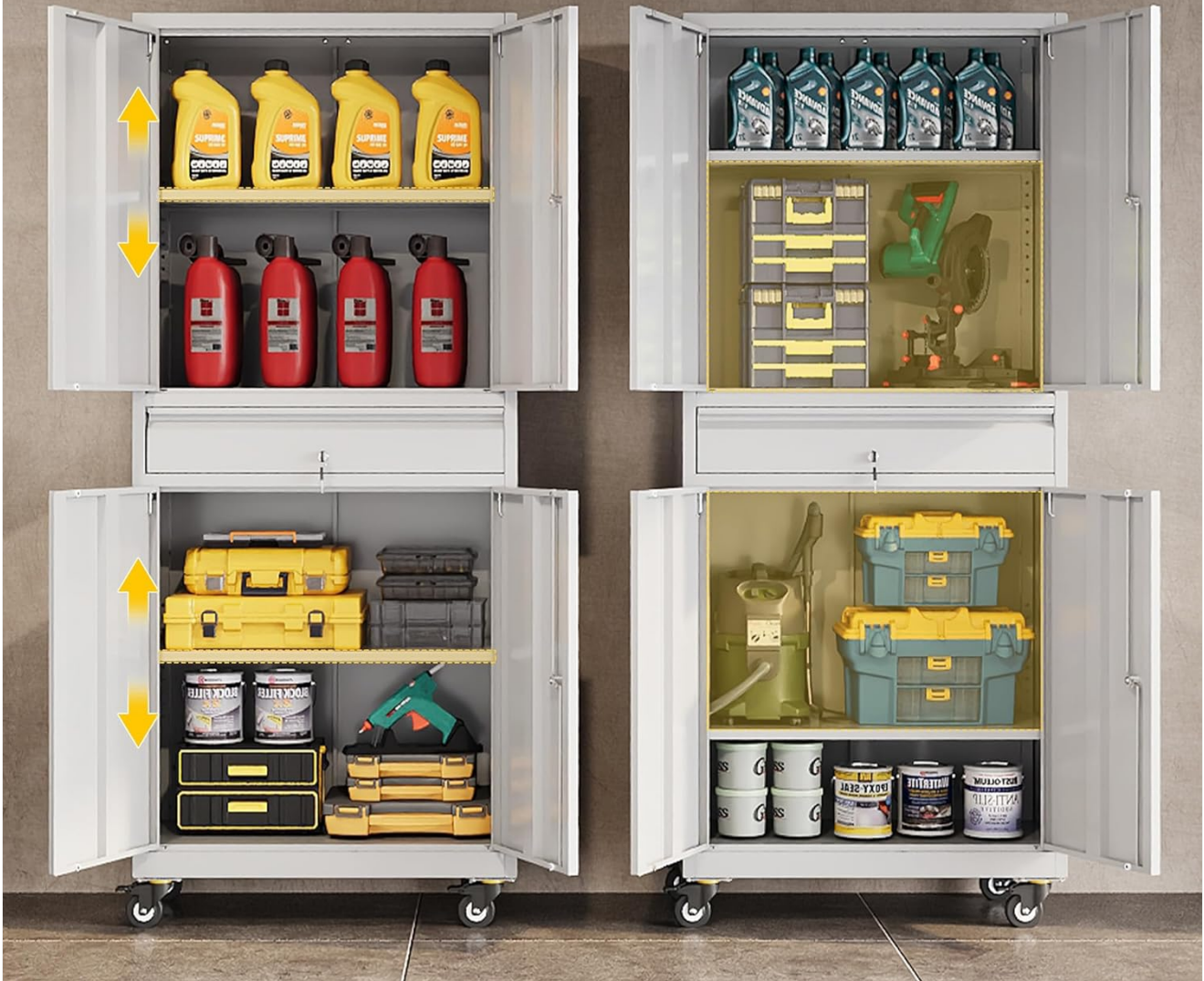
Image: The DEVAISE Metal Garage Storage Cabinet in a garage environment, illustrating its practical storage capabilities.

2 adjustable shelves for customizable organization