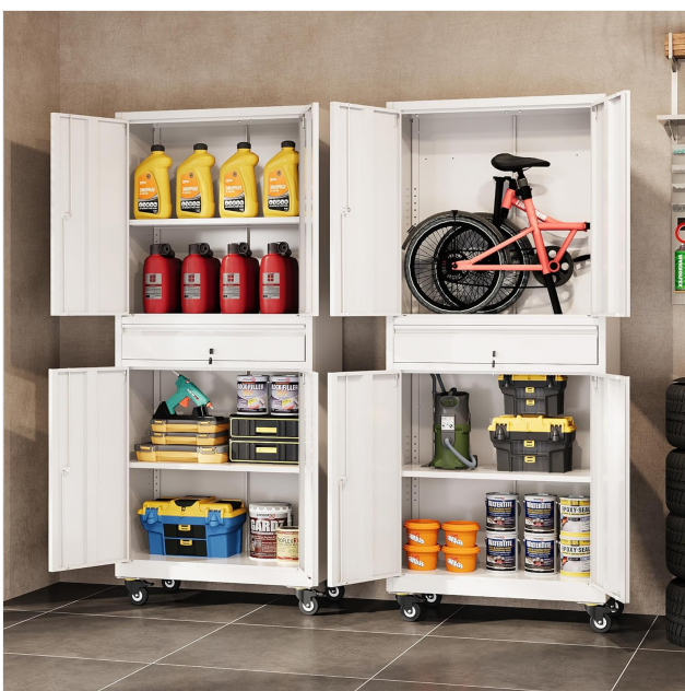
Image: Two DEVAISE cabinets in a garage, demonstrating their use for storing tools and supplies.

The cabinet includes four lockable casters for easy movement. To move the cabinet, unlock all four casters by flipping their levers. Once the cabinet is in the desired location, lock the casters to prevent accidental movement.