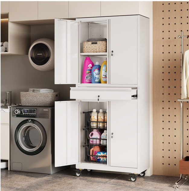
Image: The cabinet's versatility is shown across different environments, including a garage, kitchen, living room, and office.